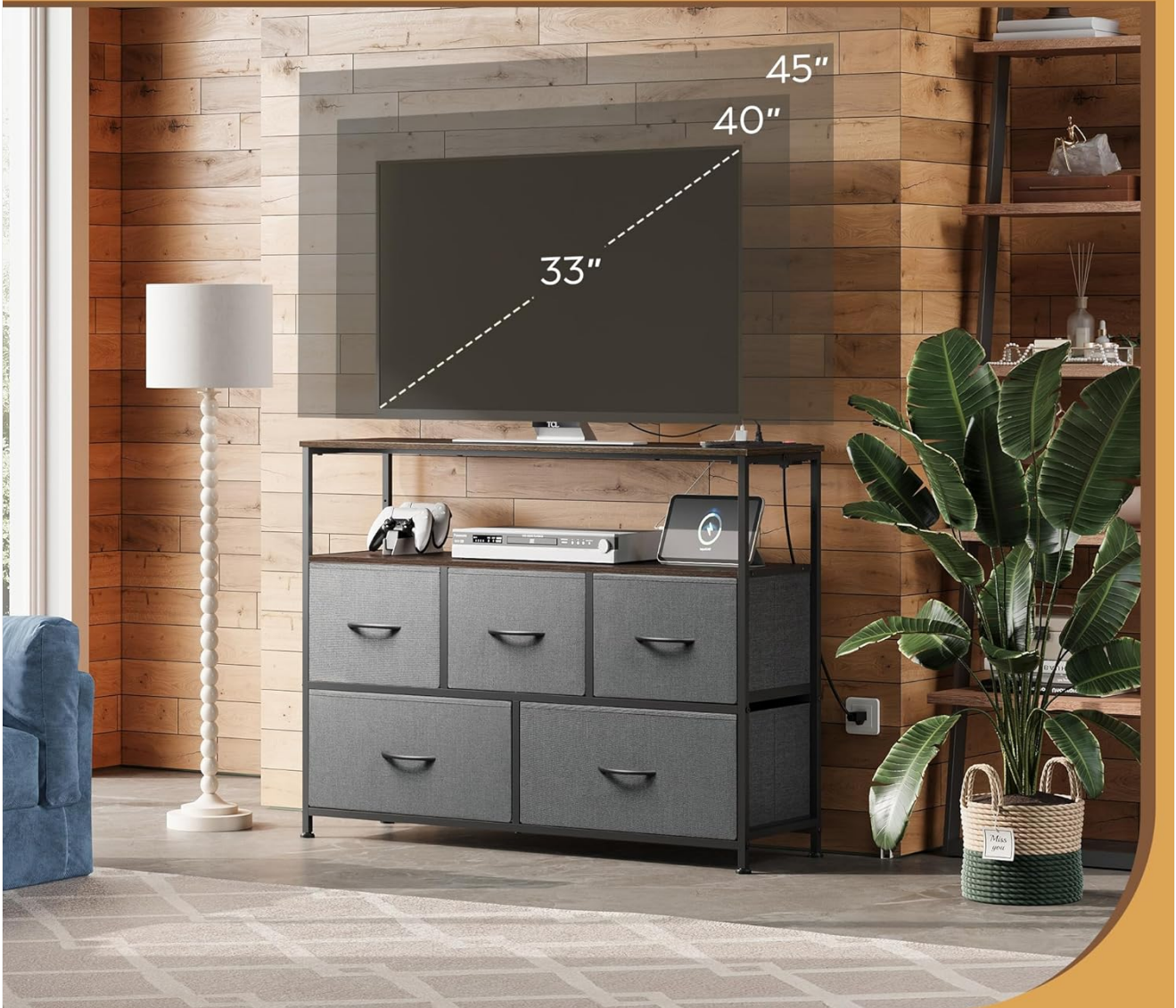
Image: The dresser with a television placed on top, illustrating its suitability for TVs up to 45 inches in size.