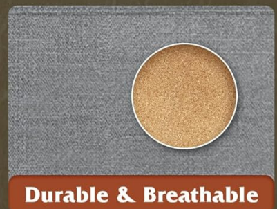
Image: An illustration of the drawer's construction, detailing the layers of breathable non-woven fabric and the sturdy MDF board, emphasizing their wear-resistant and durable qualities.