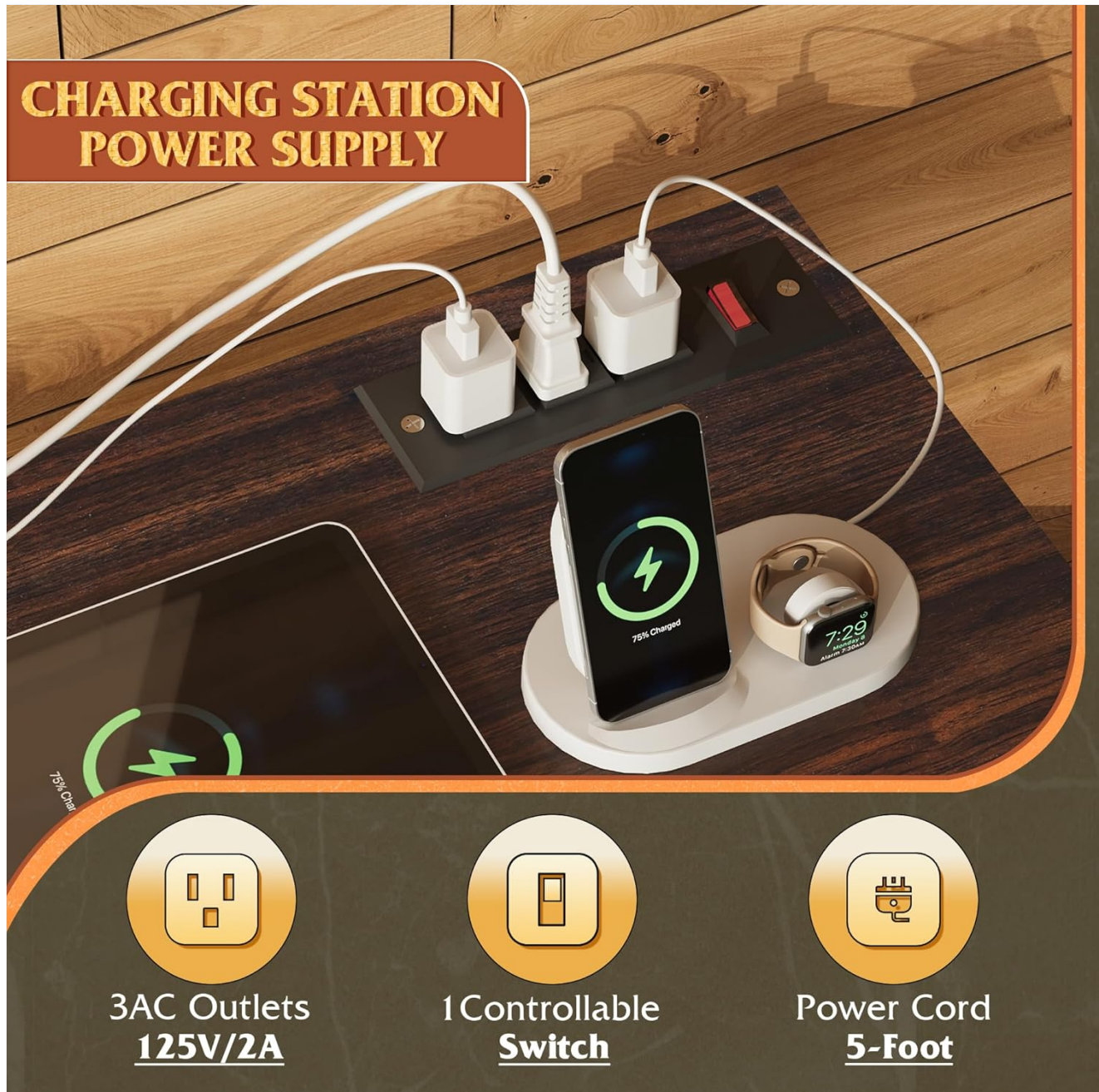
Image: A detailed view of the integrated power strip, showing the three AC outlets, the on/off switch, and the 5-foot power cord, with devices charging.