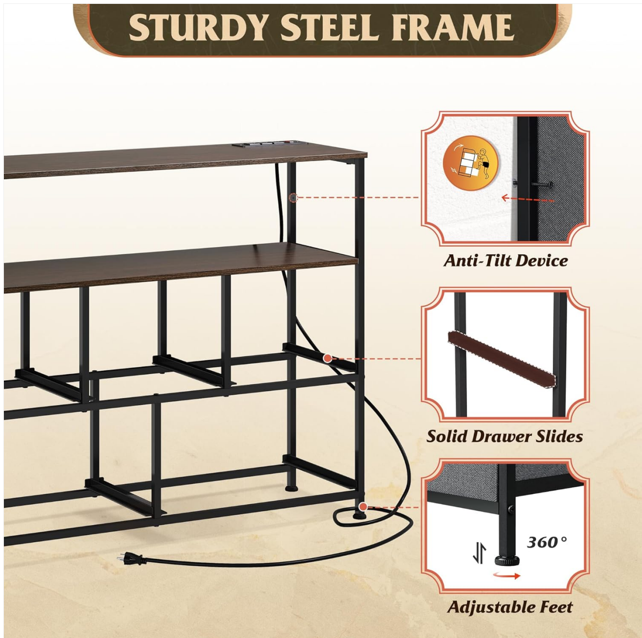
Image: Detailed view of the dresser's structural features, including the anti-tilt device for wall attachment, solid drawer slides for smooth operation, and 360-degree adjustable feet for stability on uneven floors.