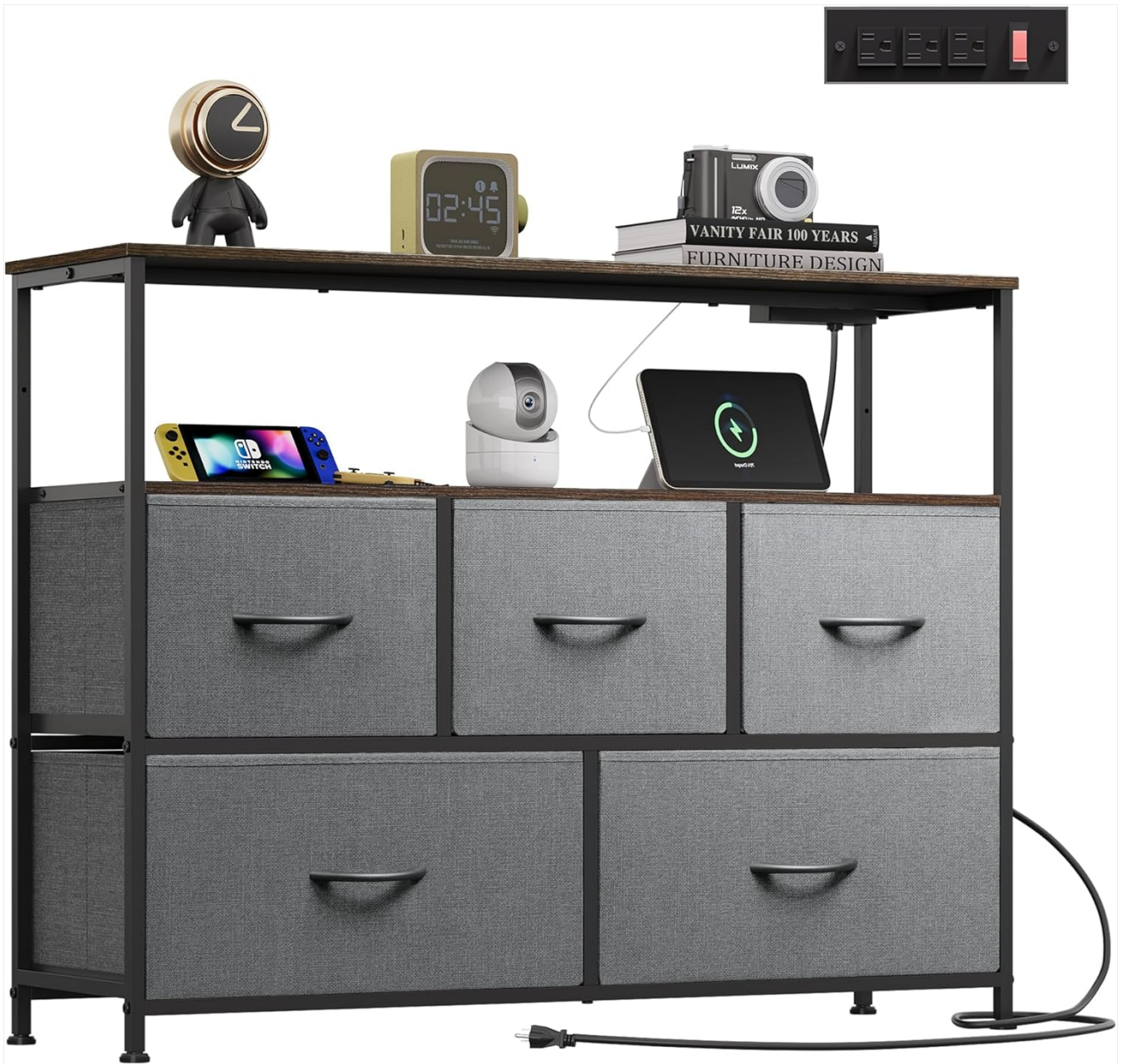
Image: The WLIVE 5 Drawer Dresser TV Stand, showcasing its design with electronics and decorative items on the top shelf, and the integrated power outlet visible.