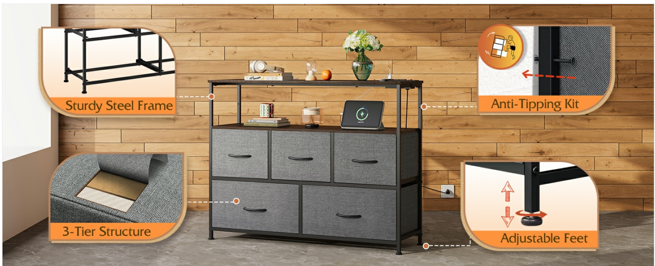
Image: An exploded view highlighting the sturdy steel frame construction, the anti-tipping kit for wall mounting, the multi-layered fabric drawer structure, and the adjustable feet.

For detailed visual instructions, please refer to the assembly manual provided in the packaging.