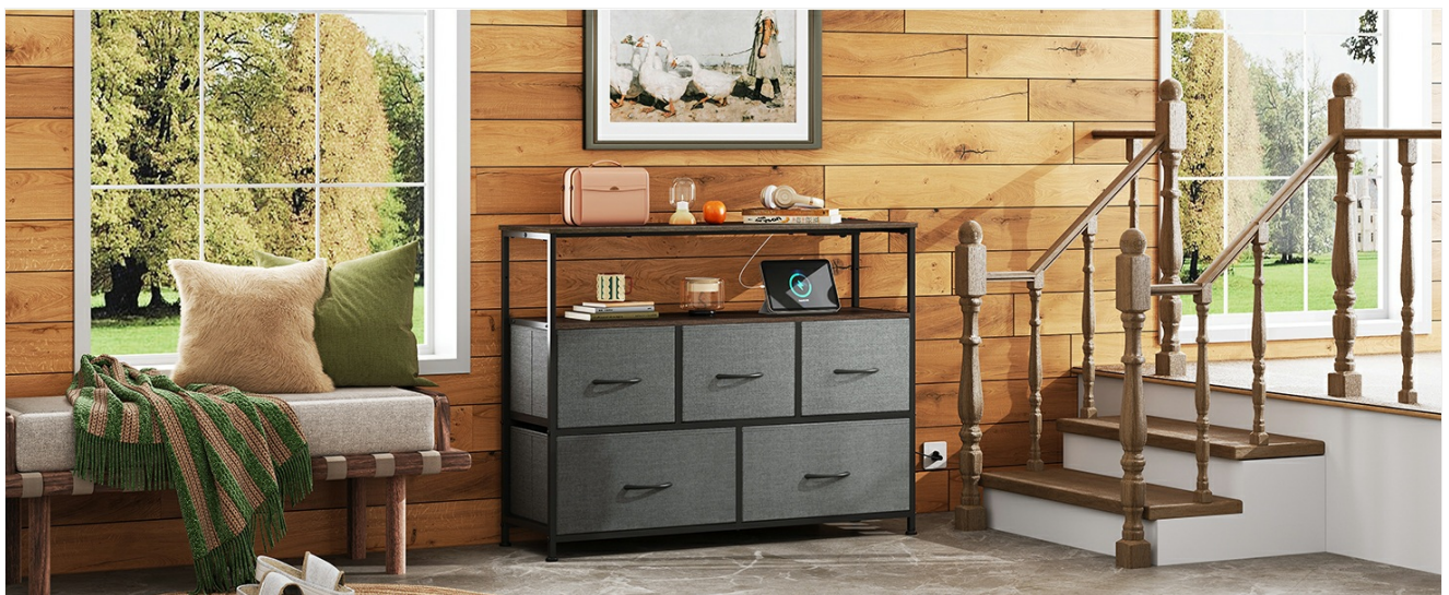
Image: The dresser integrated into a bedroom environment, demonstrating its aesthetic appeal and functional placement.