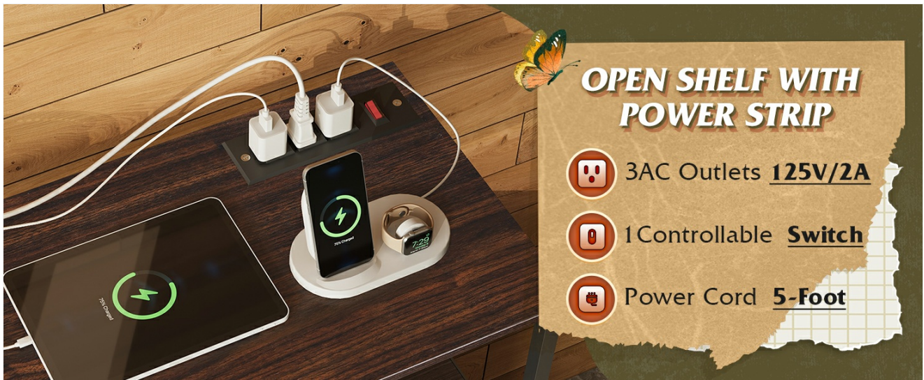
Image: The open shelf area of the dresser, highlighting the integrated power strip and its utility for charging various electronic devices.