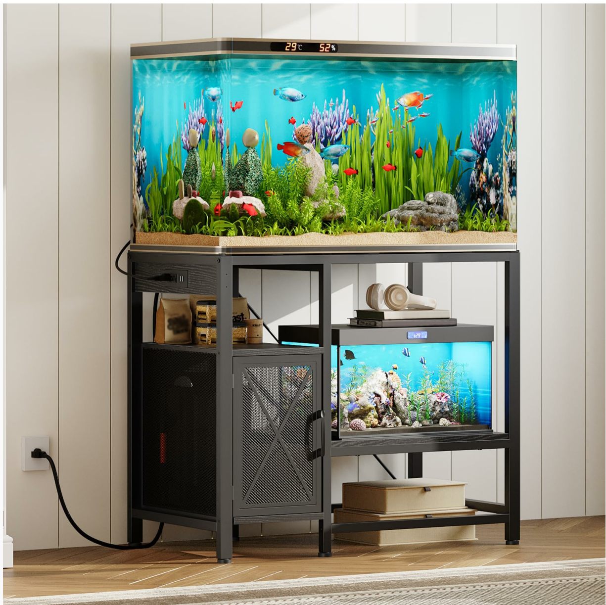
Figure 1: Assembled MAHANCRIIS 40-50 Gallon Fish Tank Stand.