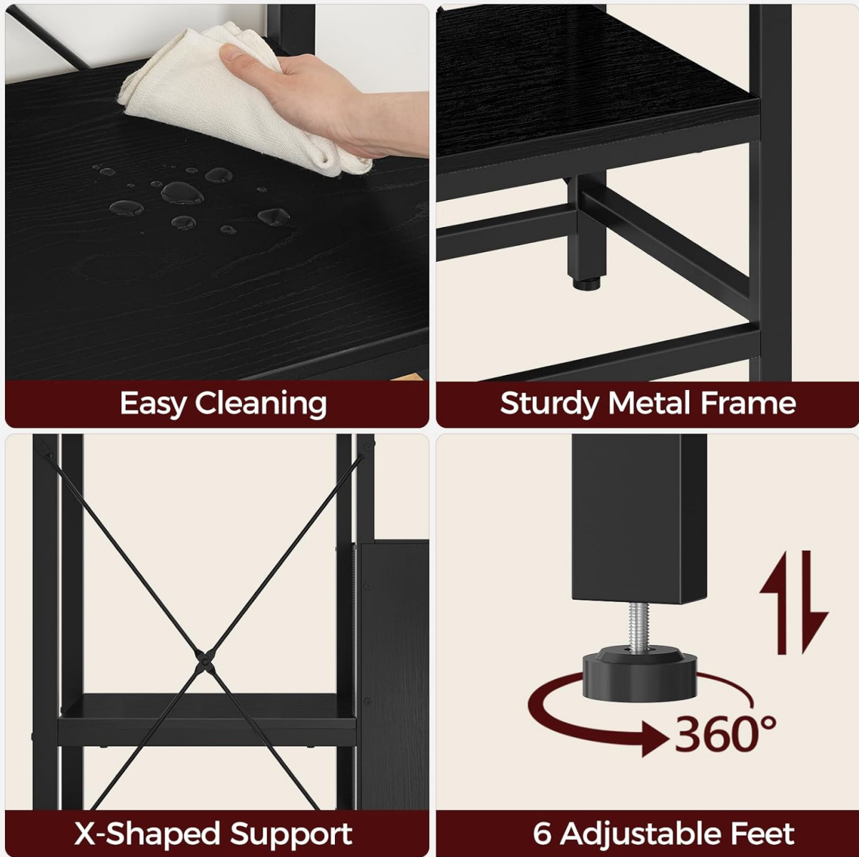
Figure 3: Key structural features including easy-clean surface, sturdy metal frame, X-shaped support, and adjustable feet.

Your browser does not support the video tag.