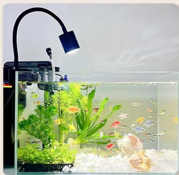
Fish Tank Lamp