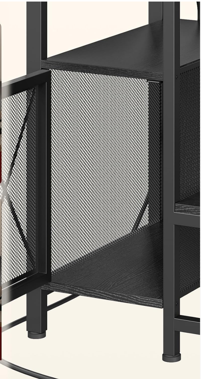
Figure 6: Storage cabinet for organizing supplies and hiding electronics.