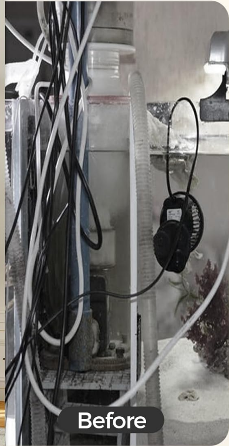
Figure 5: Effective Cable Management using the stand's design.