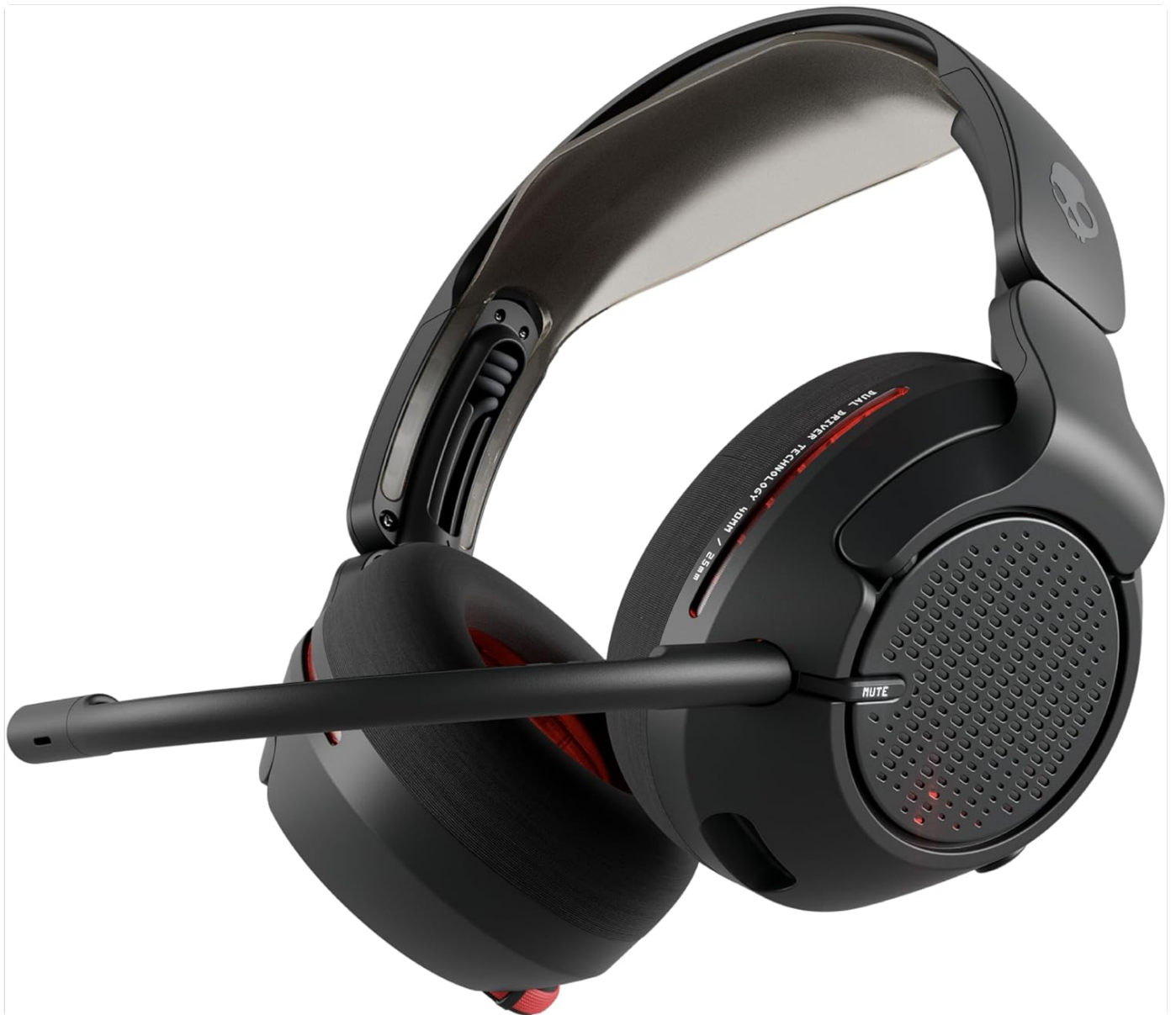
Image: Angled view of the Skullcandy Crusher PLYR 720 headset with boom mic attached.