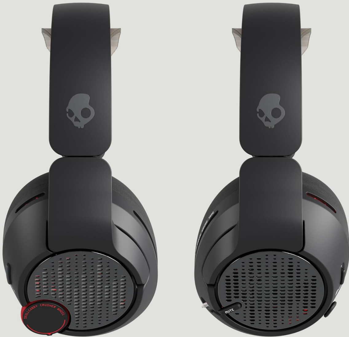
Image: All included components of the Skullcandy Crusher PLYR 720 Wireless Gaming Headset package.