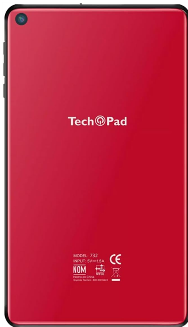
Figure 3.4: Rear view of the tablet, showcasing its distinctive red casing, the Tech Pad logo, and regulatory markings including the model number 732.