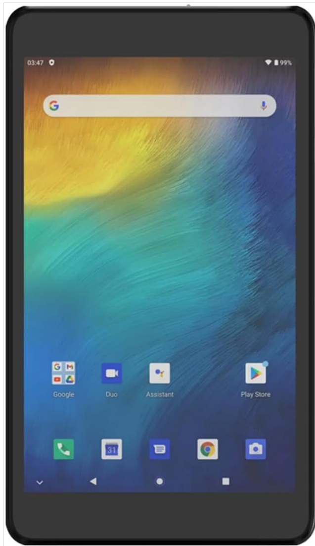
Figure 3.1: Front view of the tablet, displaying the Android home screen with various app icons and a search bar.