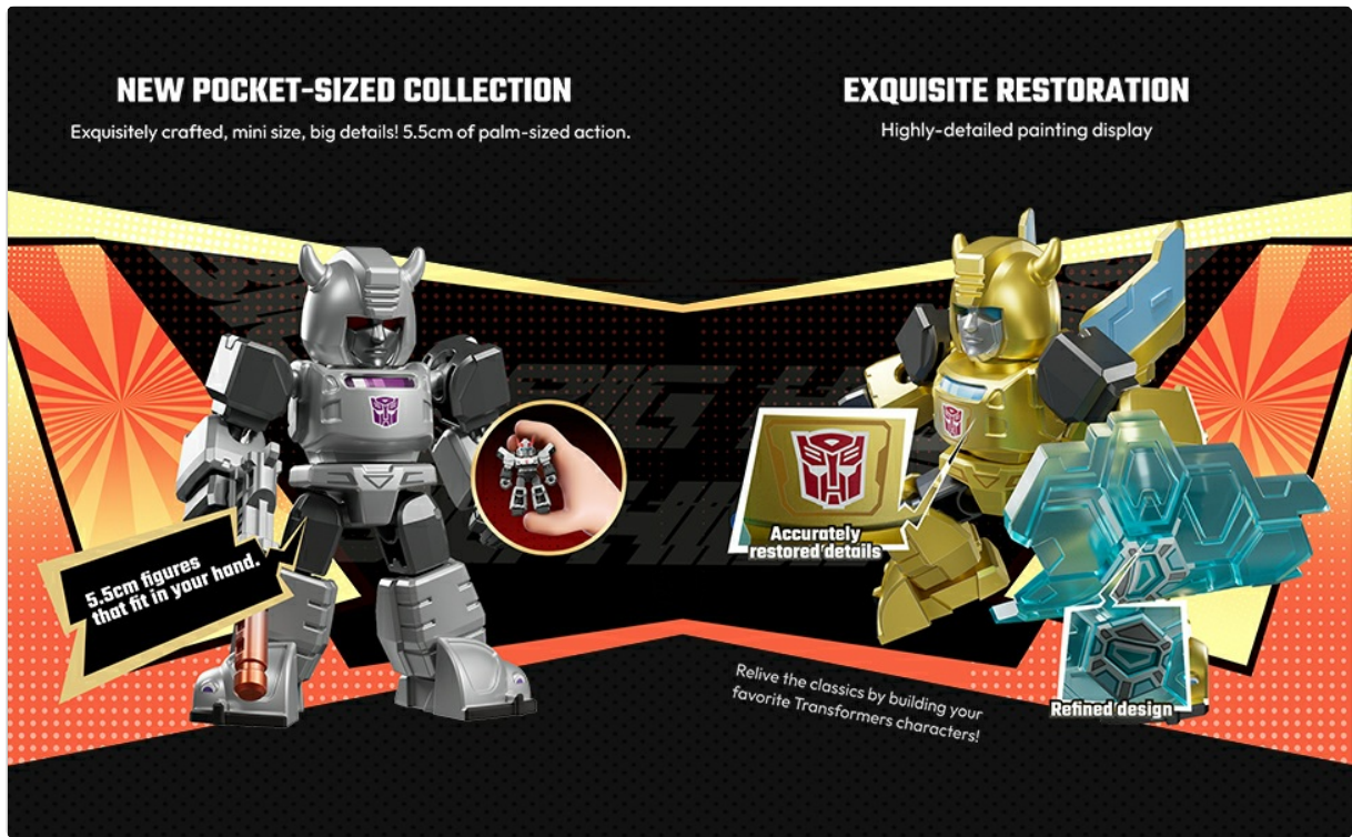
Image: Megatron and Special Armor Type Bumblebee figures, illustrating their compact 5.5cm size and exquisite restoration with highly-detailed painting.