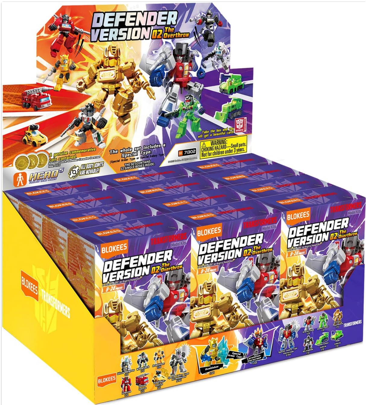
Image: A display box showcasing various BLOKEES Transformers Defender Version 02 figures and their vehicle modes, indicating the collectible nature of the series.