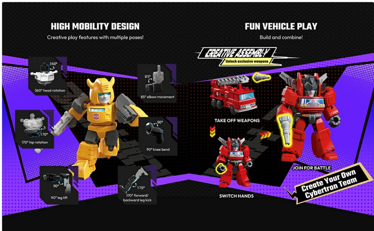
Image: A visual demonstrating the high mobility design with articulation points (360° head, 170° hip, 85° elbow, 90° knee, 90° leg lift) and creative assembly options like taking off weapons, switching hands, and combining elements for vehicle play.