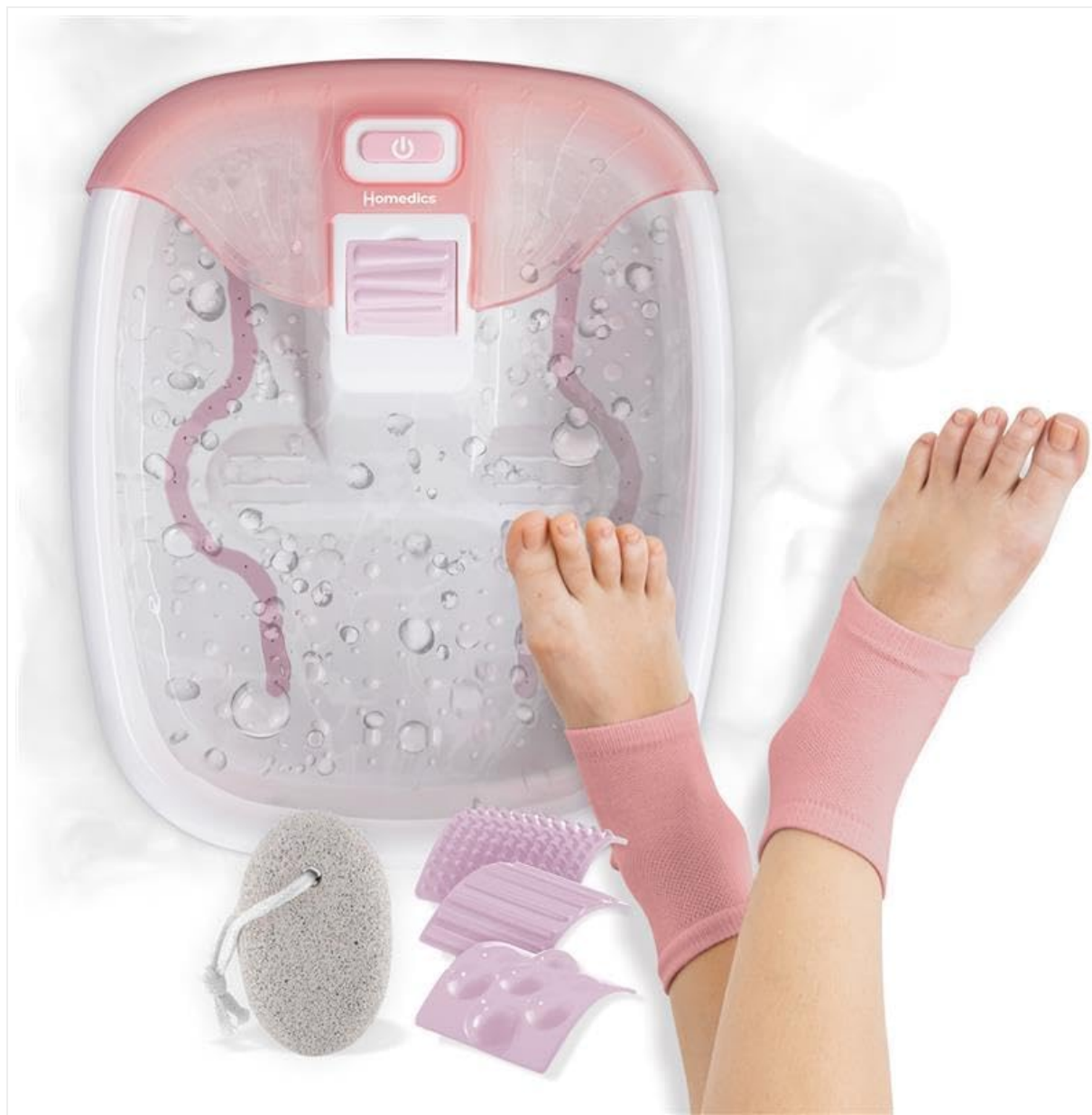
Image: The HoMedics Bubble Bliss Deluxe Footbath in pink, shown with the included pumice stone, three interchangeable massage attachments, and a pair of pink moisturizing heel socks. A pair of feet are shown wearing the socks.