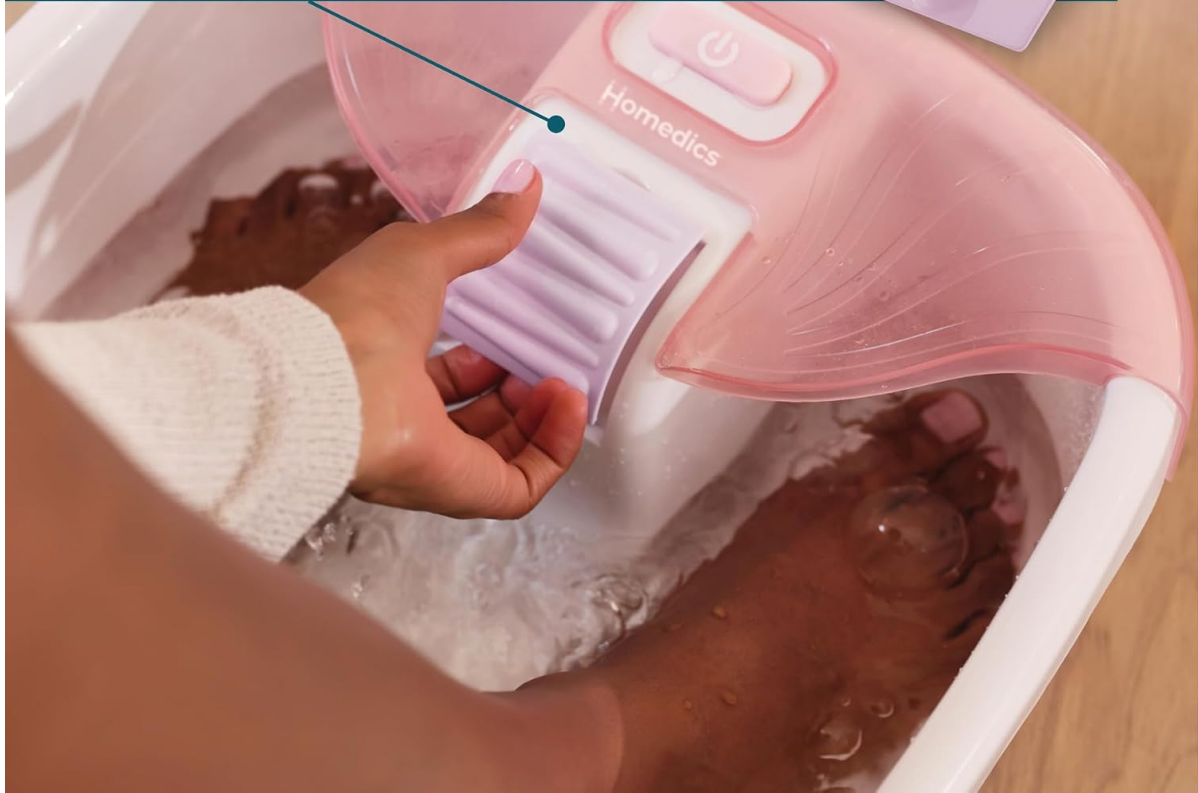
Image: A hand demonstrating how to change one of the three interchangeable massage attachments on the central node of the footbath.