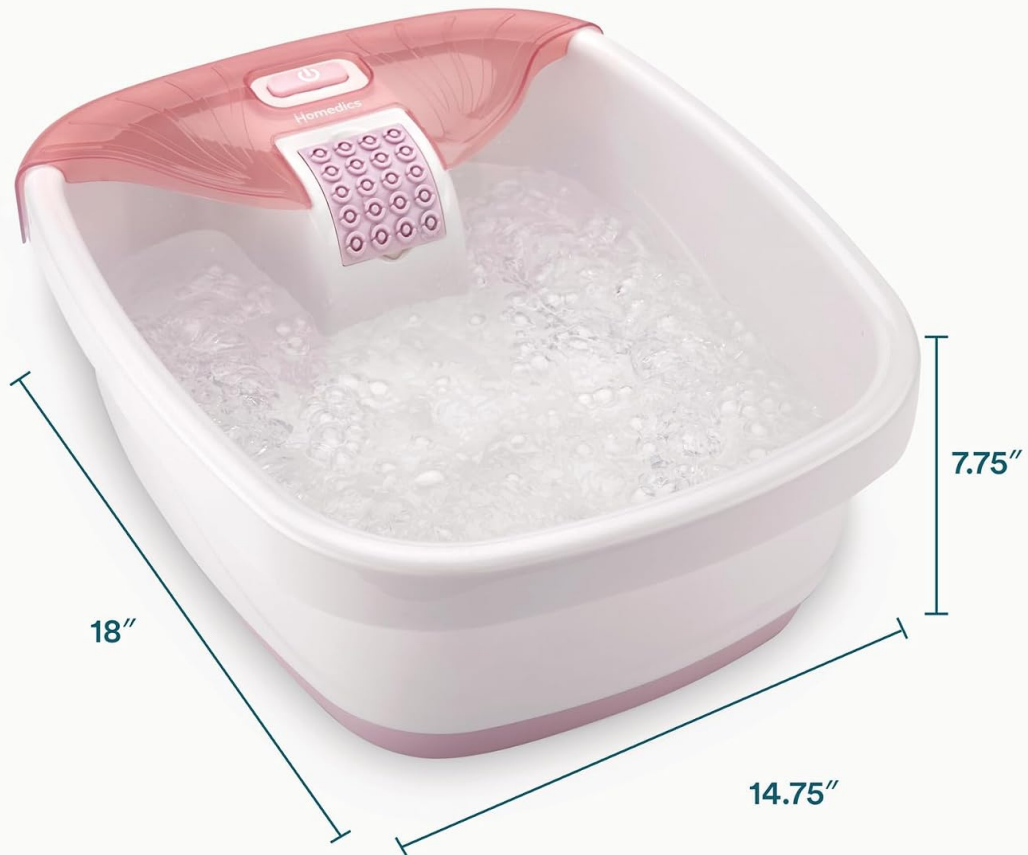
Image: A diagram showing the dimensions of the HoMedics footbath: 18 inches long, 14.75 inches wide, and 7.75 inches high.