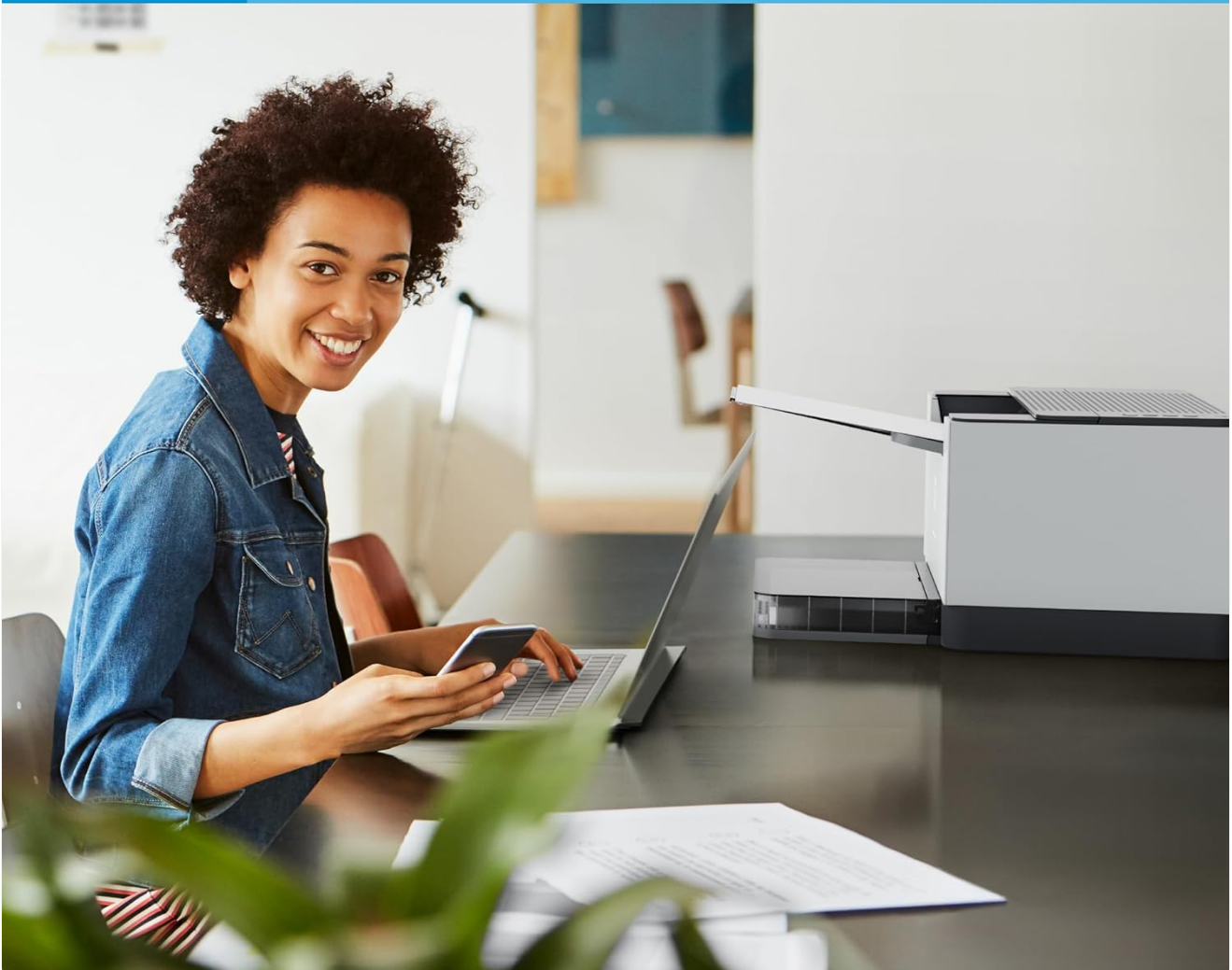
Image: A user working with a laptop and smartphone, with the HP LaserJet M207dw printer visible, emphasizing its dual-band Wi-Fi capability for seamless connection.

Dual-band Wi-Fi® automatically reconnects to stay online