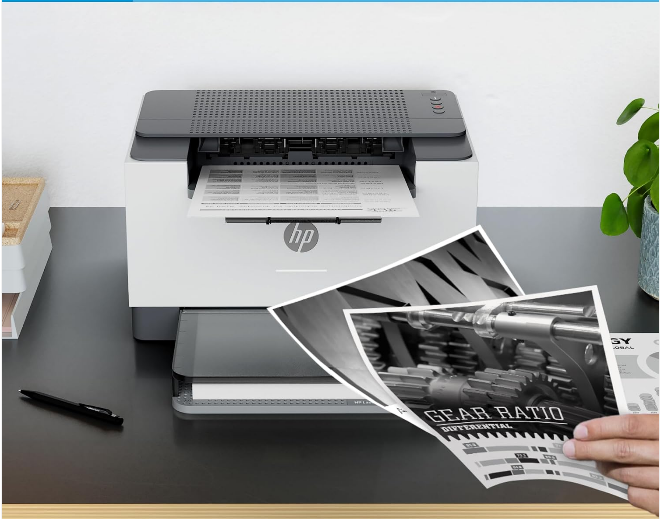
Image: The HP LaserJet M207dw printer delivering exceptional quality black and white prints, page after page.