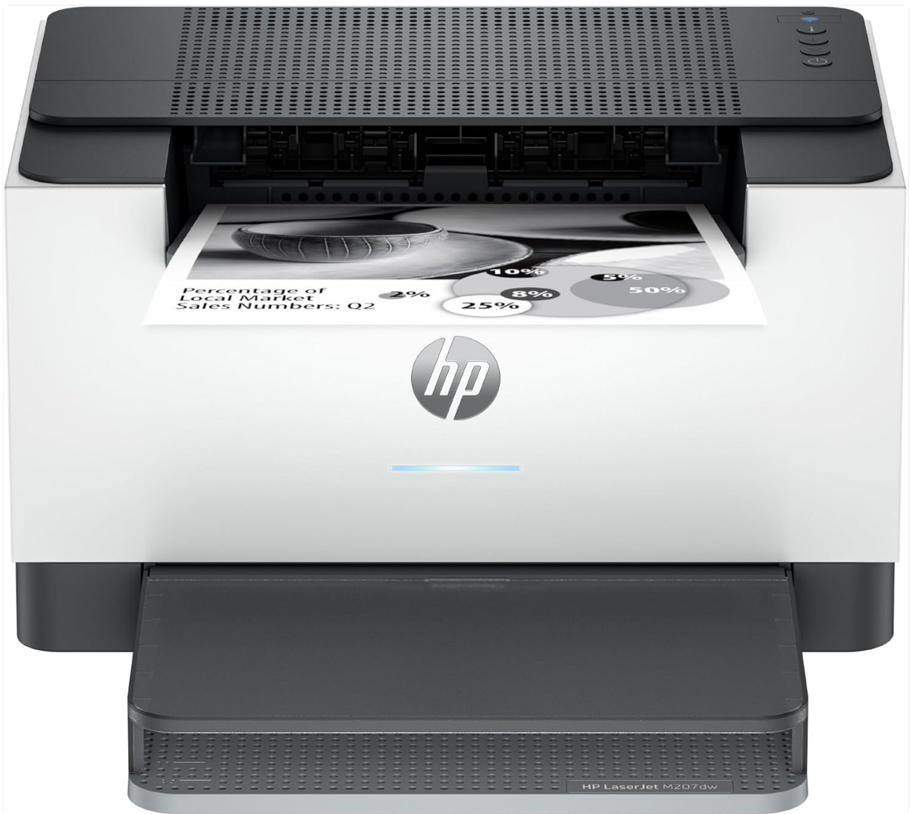
Image: The HP LaserJet M207dw printer in operation, printing a document with charts.