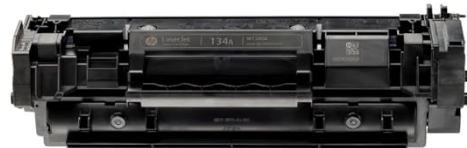
Original HP 134A Black Toner Cartridge

Image: The HP LaserJet M207dw printer, power cord, and an Original HP 134A Black Toner Cartridge, illustrating the typical contents of the product box.