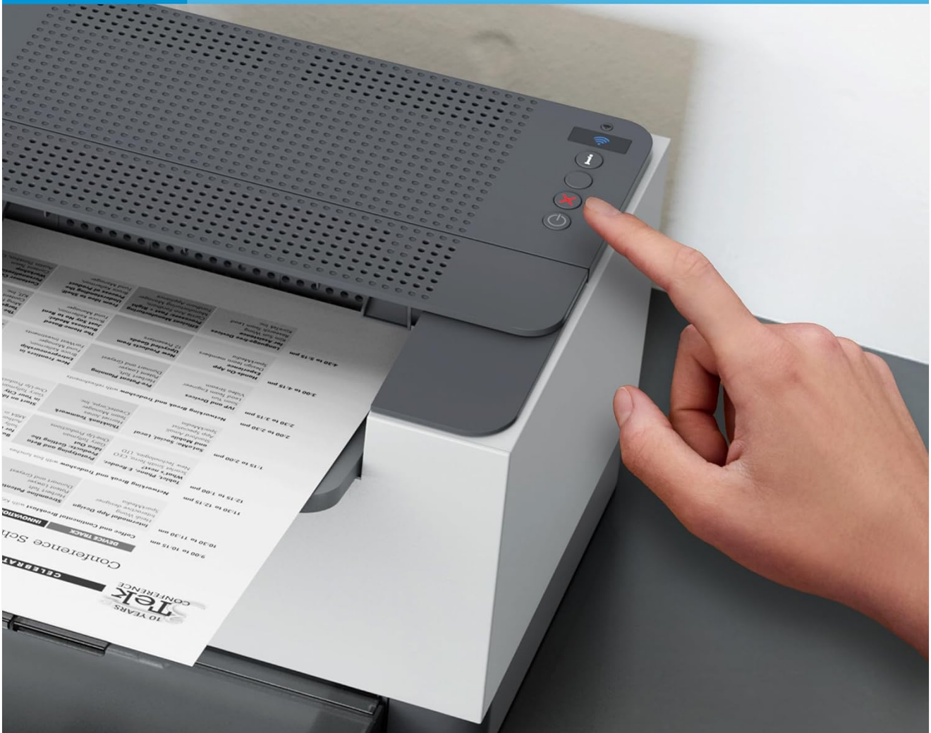
Image: A hand interacting with the smart-guided buttons on the HP LaserJet M207dw printer's control panel, demonstrating ease of task management.