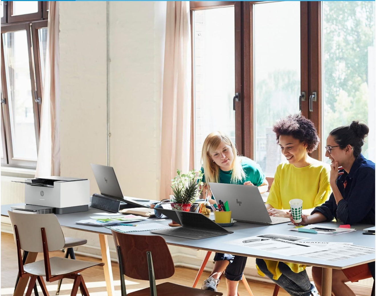
Image: An office setting with multiple individuals working, featuring the HP LaserJet M207dw printer, emphasizing its fast two-sided printing capability.