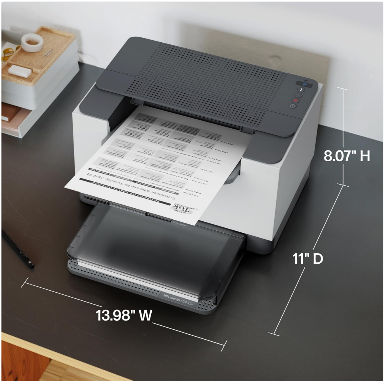
Image: The HP LaserJet M207dw printer with its physical dimensions clearly indicated: 13.98 inches width, 11 inches depth, and 8.07 inches height.