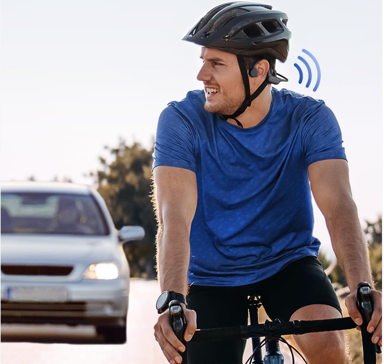
Figure 5.2: A cyclist wearing the headphones, illustrating how the open-ear design allows awareness of the environment.

Let the rhythm of music energize your workout while remaining aware of your natural environment.