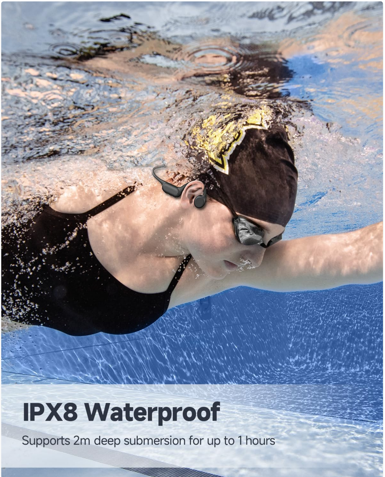
Figure 5.1: The headphones in use during swimming, demonstrating their IPX8 waterproof capability.