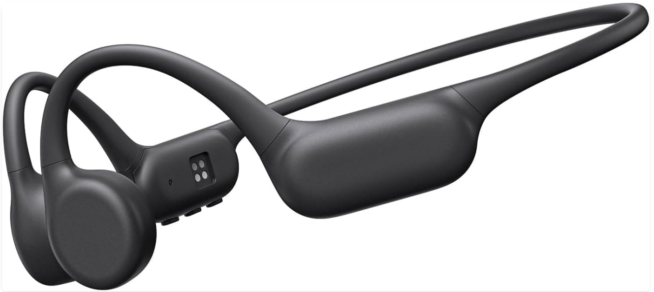
Figure 2.1: Side view of the PSIER Bone Conduction Headphones, showcasing their ergonomic design.