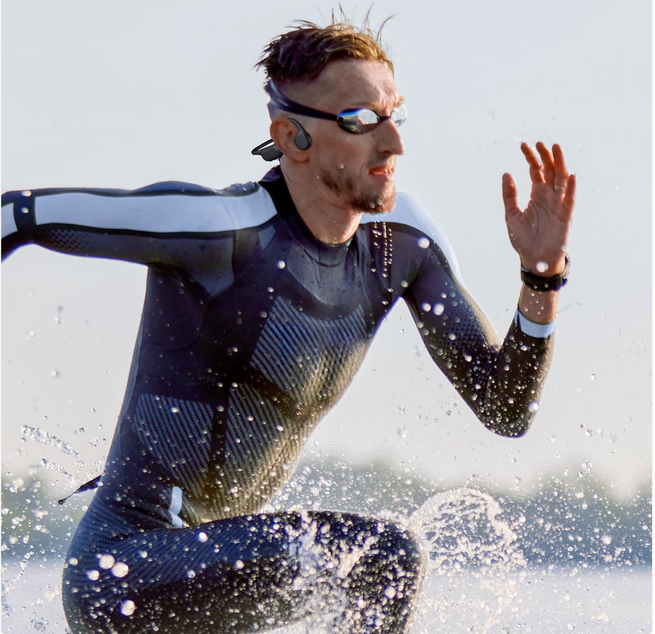
Figure 5.3: An athlete running, showcasing the stability and secure fit of the headphones during motion.

Relax to go ahead, run, jump or make a flash! Experience the pinnacle of durability.