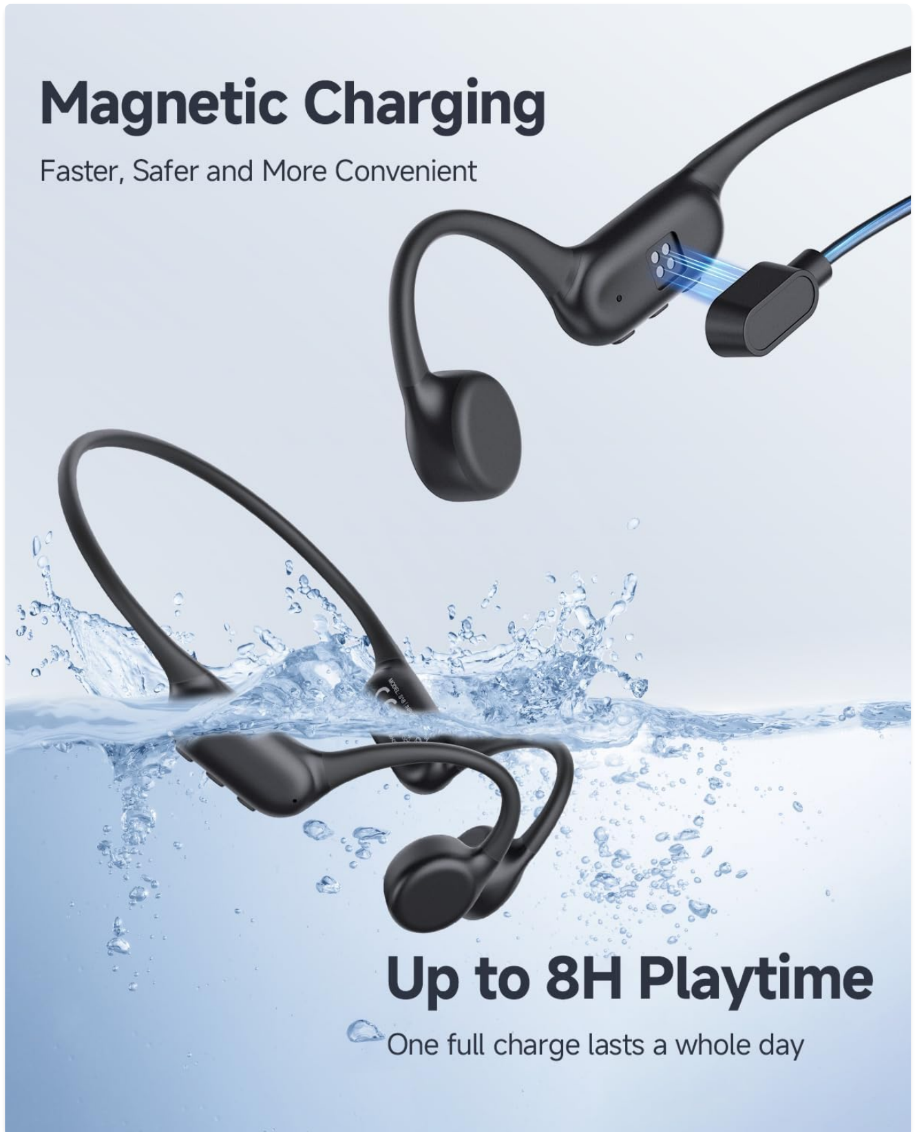
Figure 3.1: Illustration of the magnetic charging process for the headphones, emphasizing up to 8 hours of playtime.