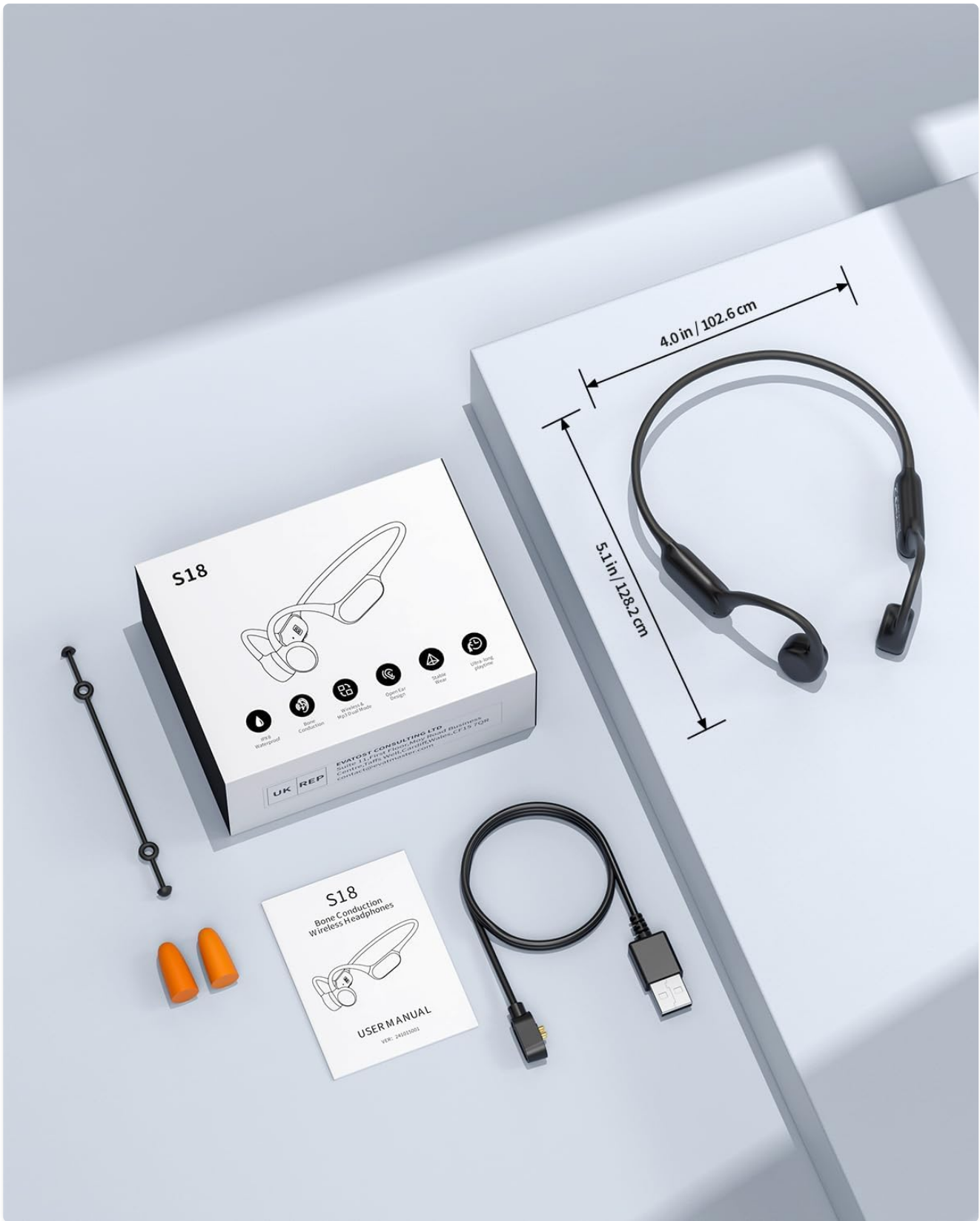
Figure 1.1: Package contents and product dimensions. The image shows the S18 headphones, charging cable, earplugs, and user manual laid out, with dimensions indicating a width of 4.0 inches (102.6 cm) and a height of 5.1 inches (128.2 cm).