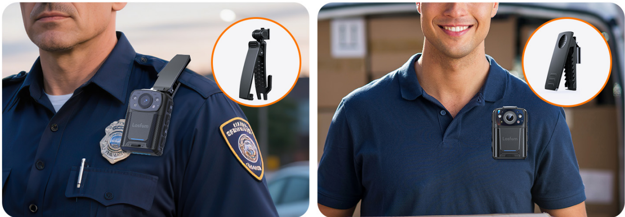
Figure 4: Two examples of the Losfom WD11 body camera being worn with different clips: one on a police officer's uniform and another on a delivery driver's shirt, demonstrating flexible mounting for various situations.

Video 3: A demonstration of how to use the various accessories, including the clips, with a body camera (Z5 Model, but relevant for accessory use).