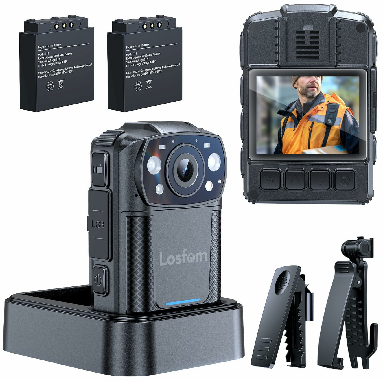
Figure 2: The Losfom WD11 Body Camera is shown on its charging base, with a spare battery positioned next to it, illustrating the dual battery system and charging method.

Video 2: A demonstration of the Losfom 4K Body Camera's dual battery system and charging dock, highlighting the ease of battery replacement and charging process.