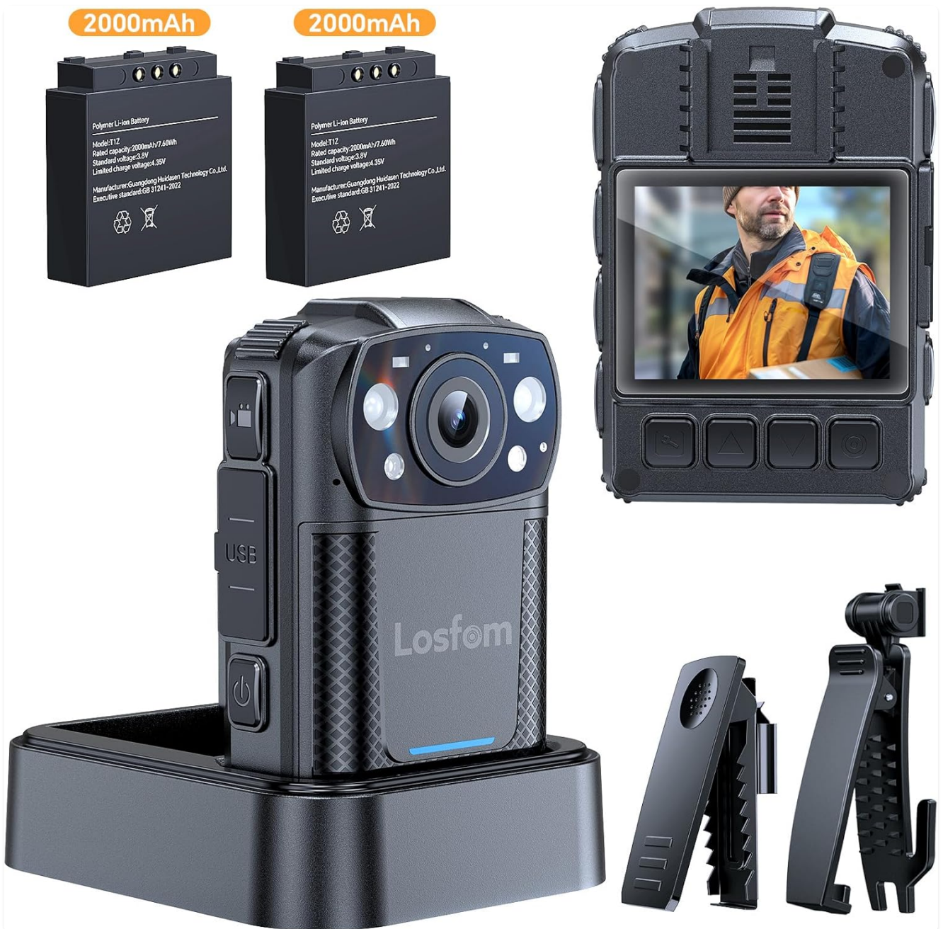
Figure 1: Losfom WD11 Body Camera with all included accessories, such as the camera unit, two batteries, charging base, USB-C cable, and various clips.

Video 1: An overview of the Losfom WD11 Body Camera and its components, demonstrating what is included in the package.