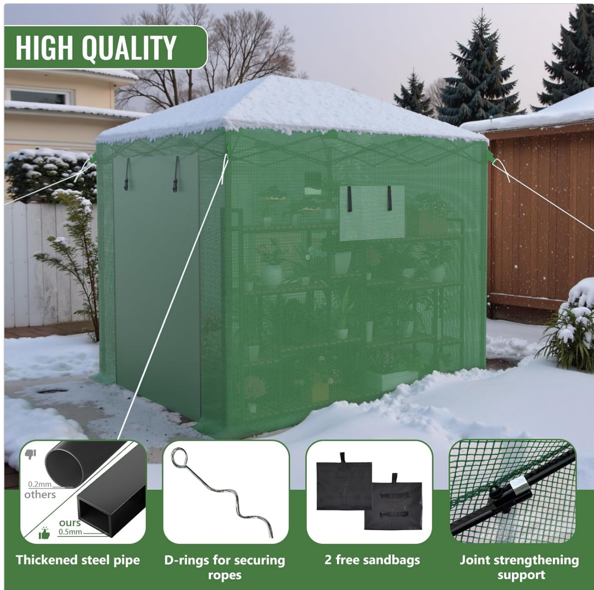
Figure 1: Key components of the Benass Pop Up Greenhouse, highlighting the thickened steel pipes, D-rings for securing ropes, sandbags, and joint strengthening support.

The package includes the pre-assembled frame, PE cover, D-rings for securing ropes, sandbags, and ground stakes.