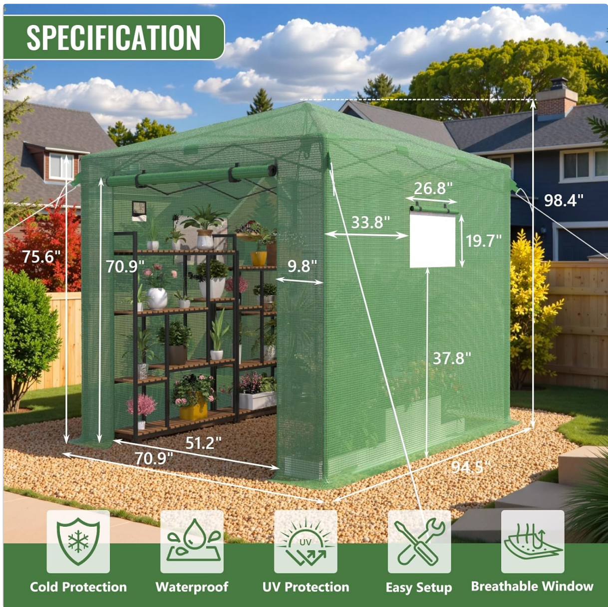
Figure 4: Detailed dimensions and features of the Benass 8X6 FT Pop Up Greenhouse.