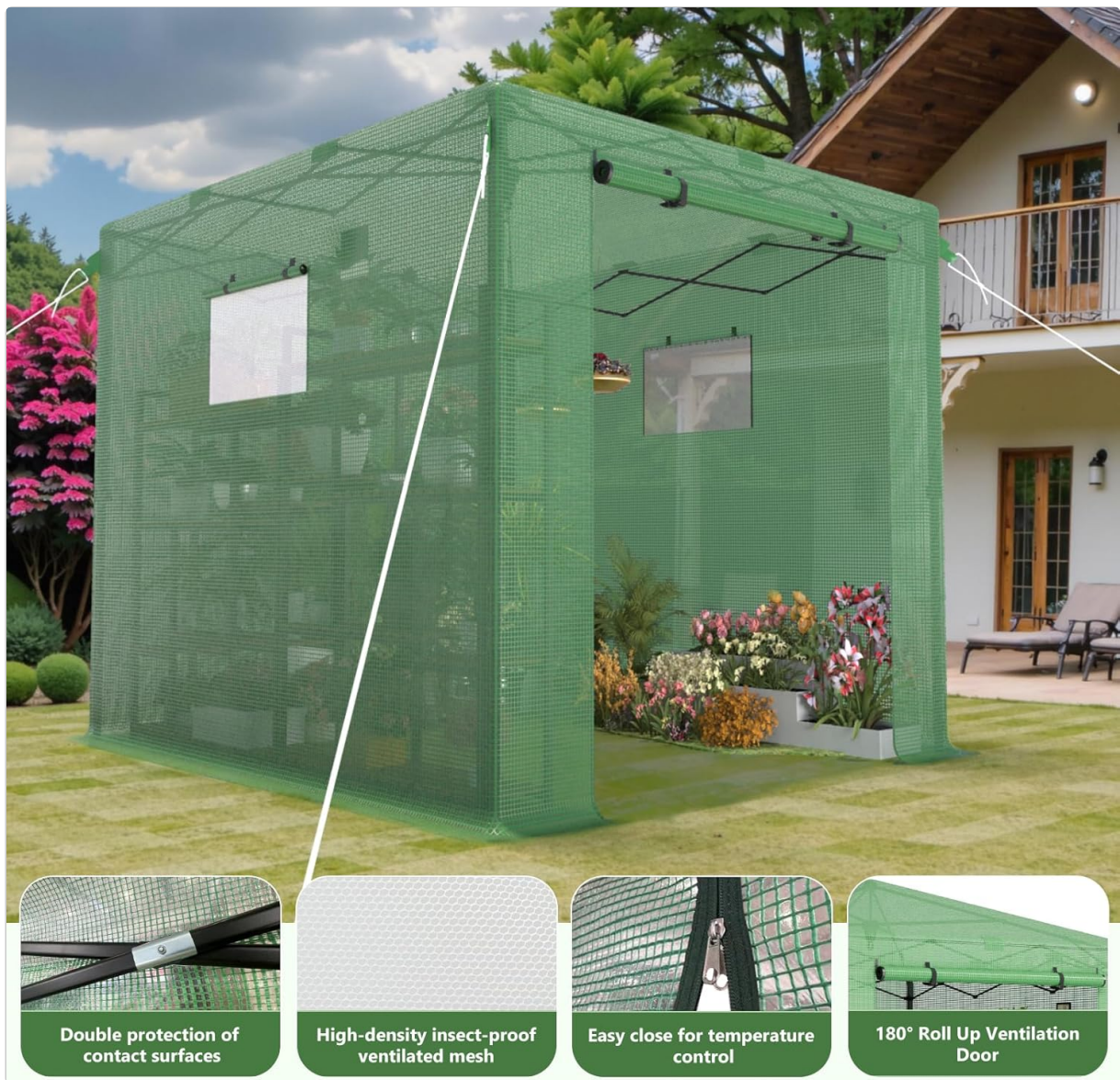
Figure 2: Detailed view of greenhouse features: double protection at contact surfaces, high-density insect-proof mesh for ventilation, a smooth zipper for access, and a 180-degree roll-up door for wide entry.