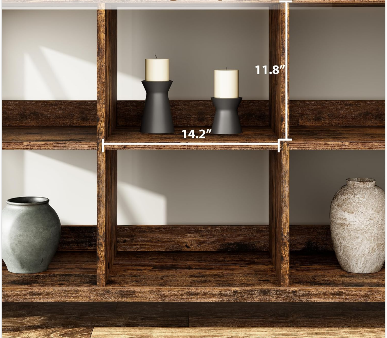
Figure 3: Individual cube dimensions for storage planning.