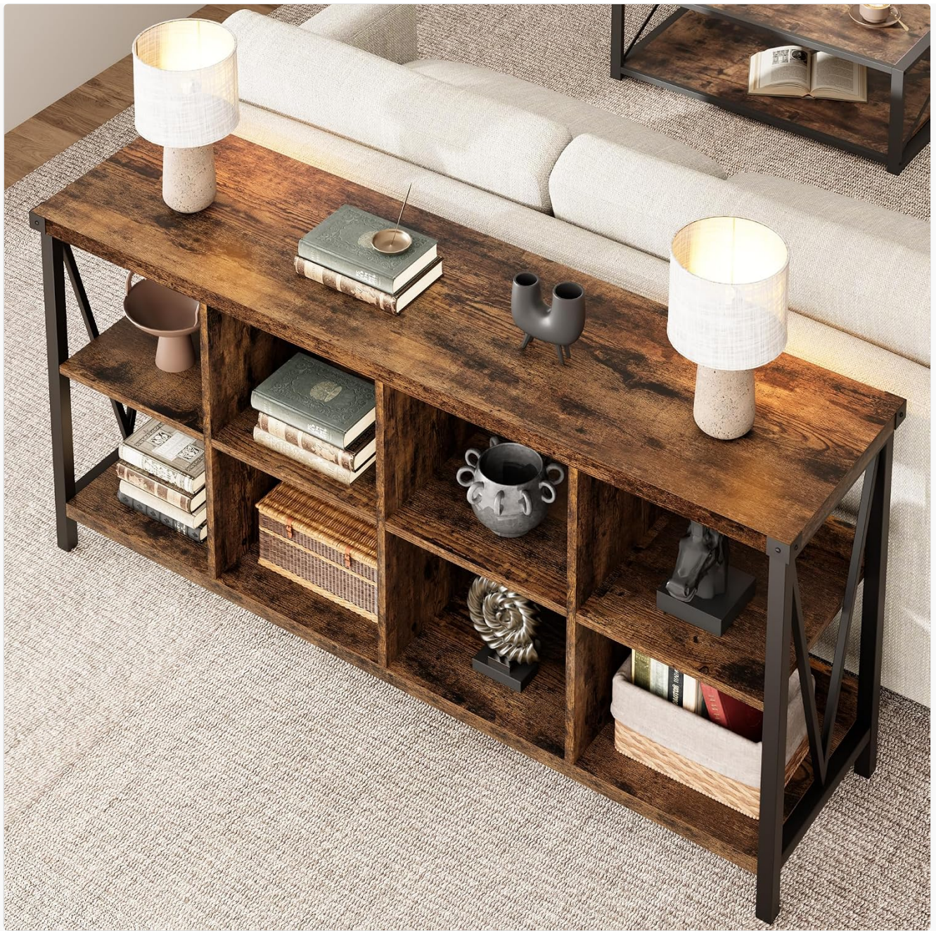
Figure 4: Bookshelf utilized as a console table.