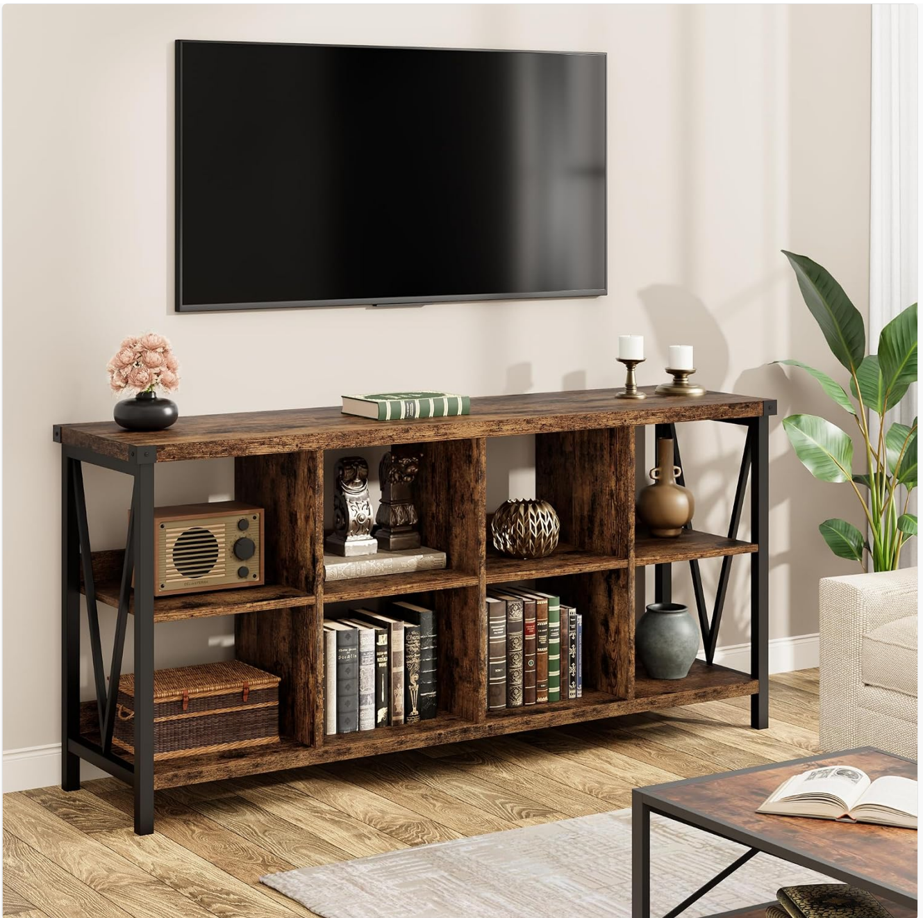
Figure 5: Bookshelf functioning as a TV cabinet.