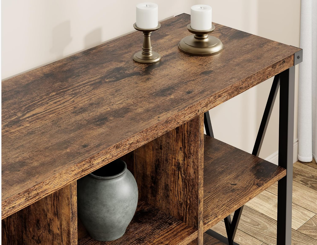
Figure 6: Natural texture of the bookshelf surface.