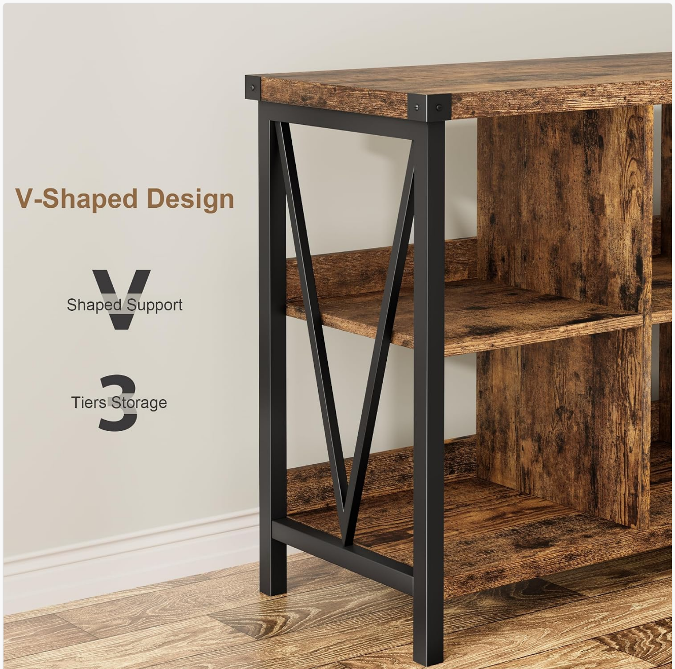
Figure 2: V-Shaped Design for enhanced stability.