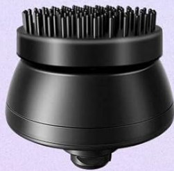
Facial Massage Brush