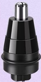
Nose Hair Trimmer