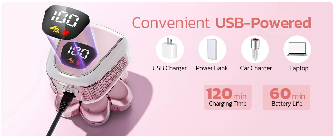
Figure 3: The shaver can be conveniently charged via various USB power sources, including USB chargers, power banks, car chargers, and laptops.