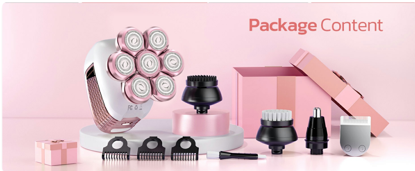
Figure 6: The package includes a small brush for detailed cleaning of the shaver heads.