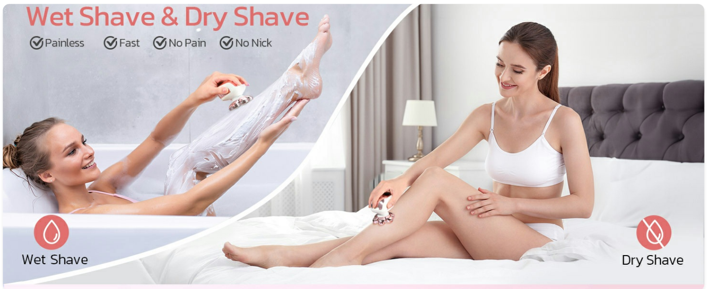
Figure 4: The shaver is suitable for both wet shaving in the shower or bath and dry shaving for convenience.