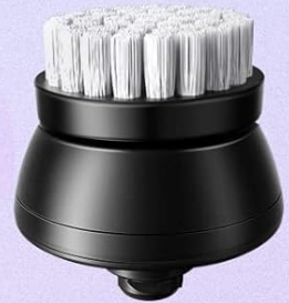
Facial Cleaning Brush