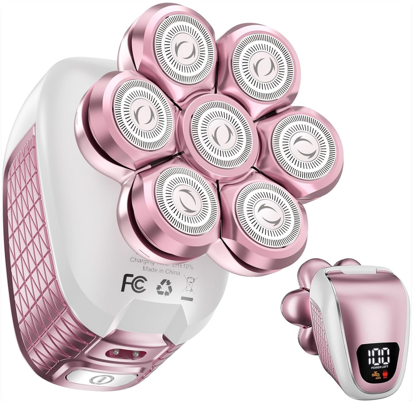
Figure 1: Main unit of the Wyklus 5-in-1 Electric Shaver with the 7D floating shaving head attached.