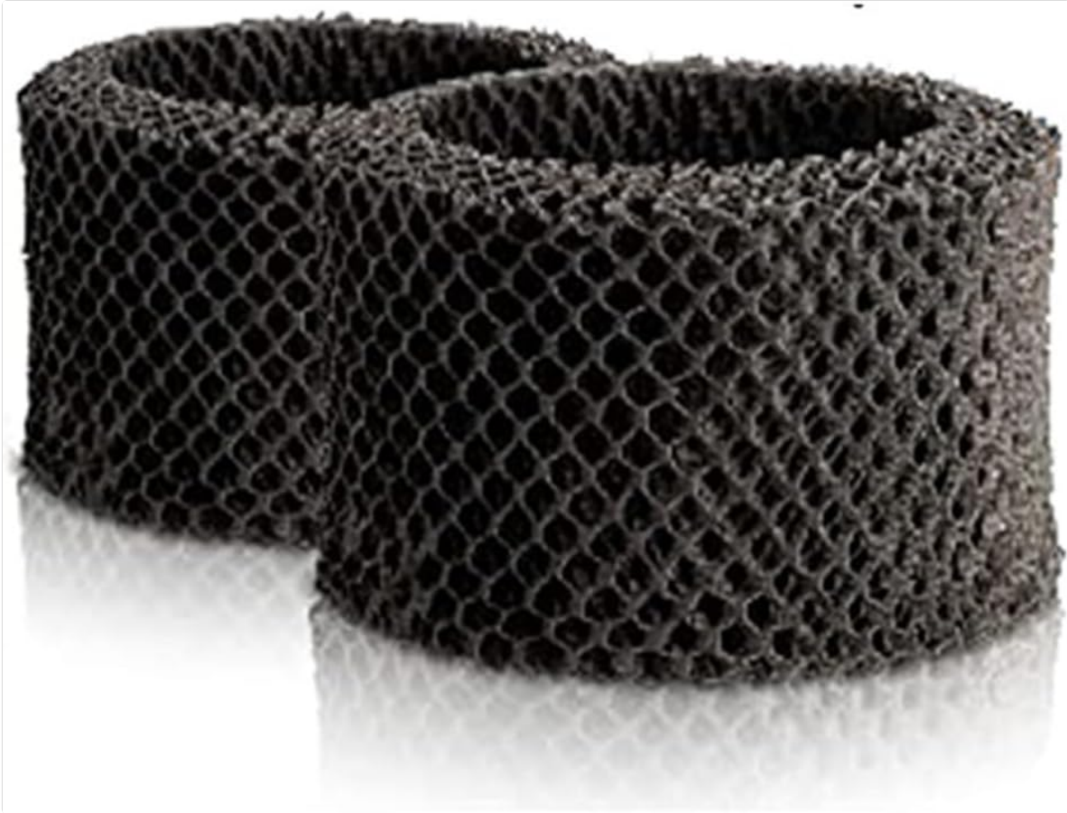
Image 1: Two VEODONT FY2401/30 humidifier filters, shown from a side perspective.