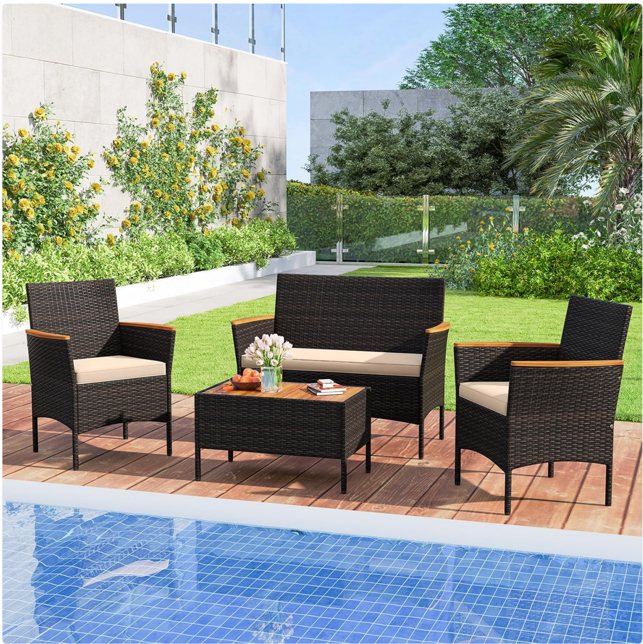
Image 1.1: The HAPPYGRILL 4-Piece Outdoor Patio Rattan Furniture Set positioned next to a swimming pool, showcasing its elegant design in an outdoor setting.