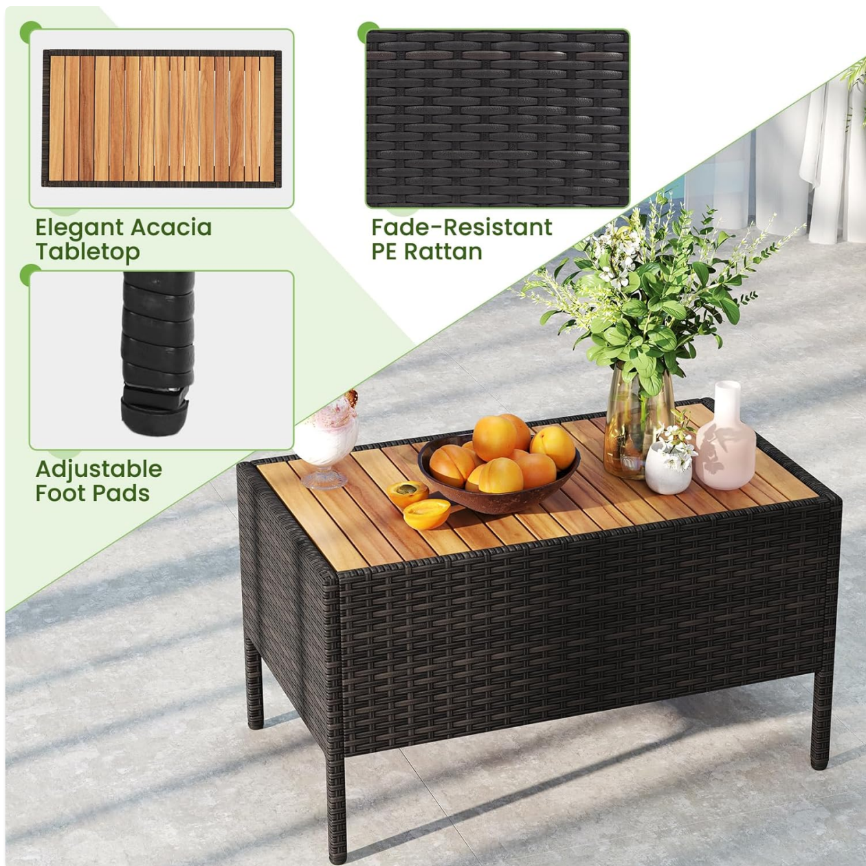
Image 6.2: This image showcases key material features: the elegant acacia wood tabletop, the fade-resistant PE rattan weave, and the adjustable foot pads designed for stability on uneven surfaces.