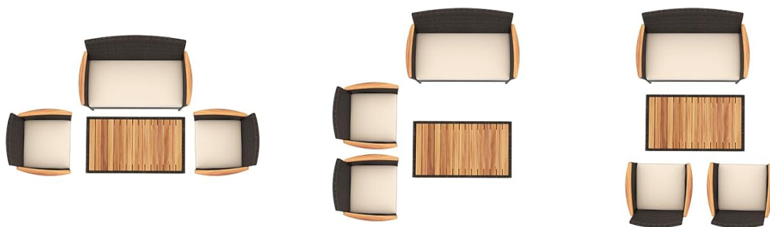
Image 5.2: This image illustrates the versatility of the patio furniture set, showing it placed in a yard, by a poolside, and on a patio, along with different possible arrangements of the chairs, loveseat, and coffee table.