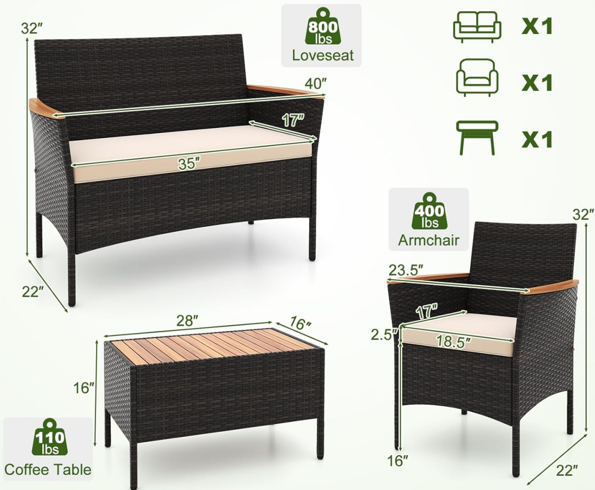
Image 8.1: A visual representation of the product dimensions for the loveseat, armchair, and coffee table, including their respective weight capacities.