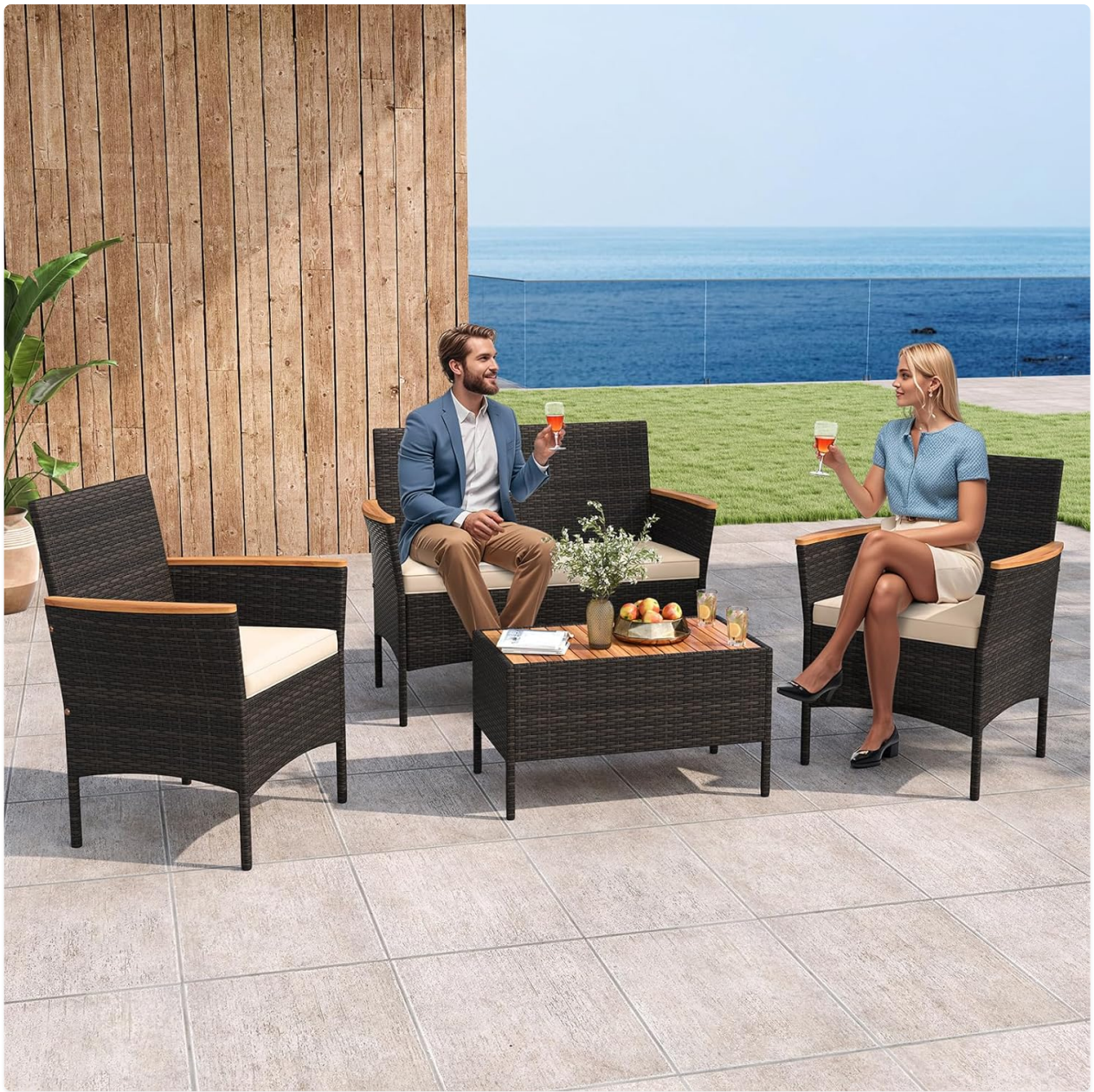
Image 5.1: Two individuals comfortably seated on the HAPPYGRILL patio furniture set, demonstrating its use in an outdoor setting.