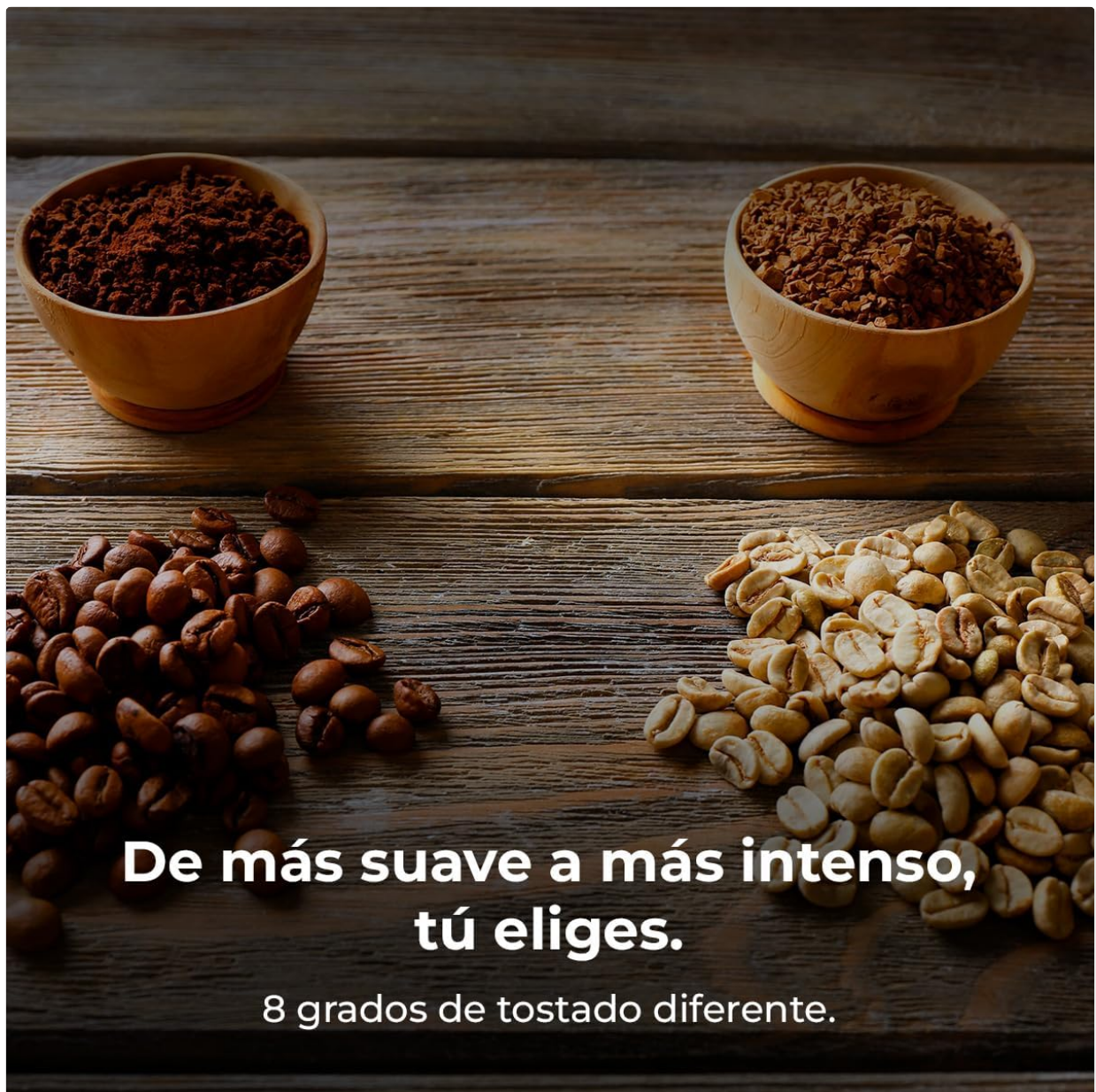
Image 4: A visual representation of different roast levels, from light to dark, achievable with the roaster's 8 settings.