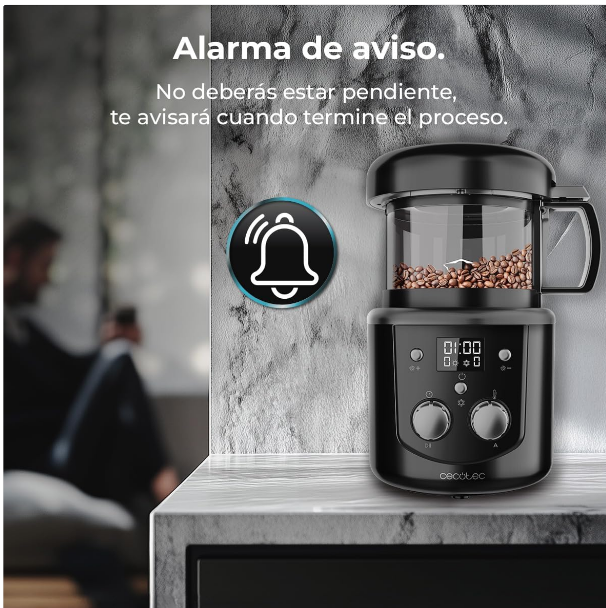
Image 5: The roaster with an alarm icon, signifying the completion reminder feature.