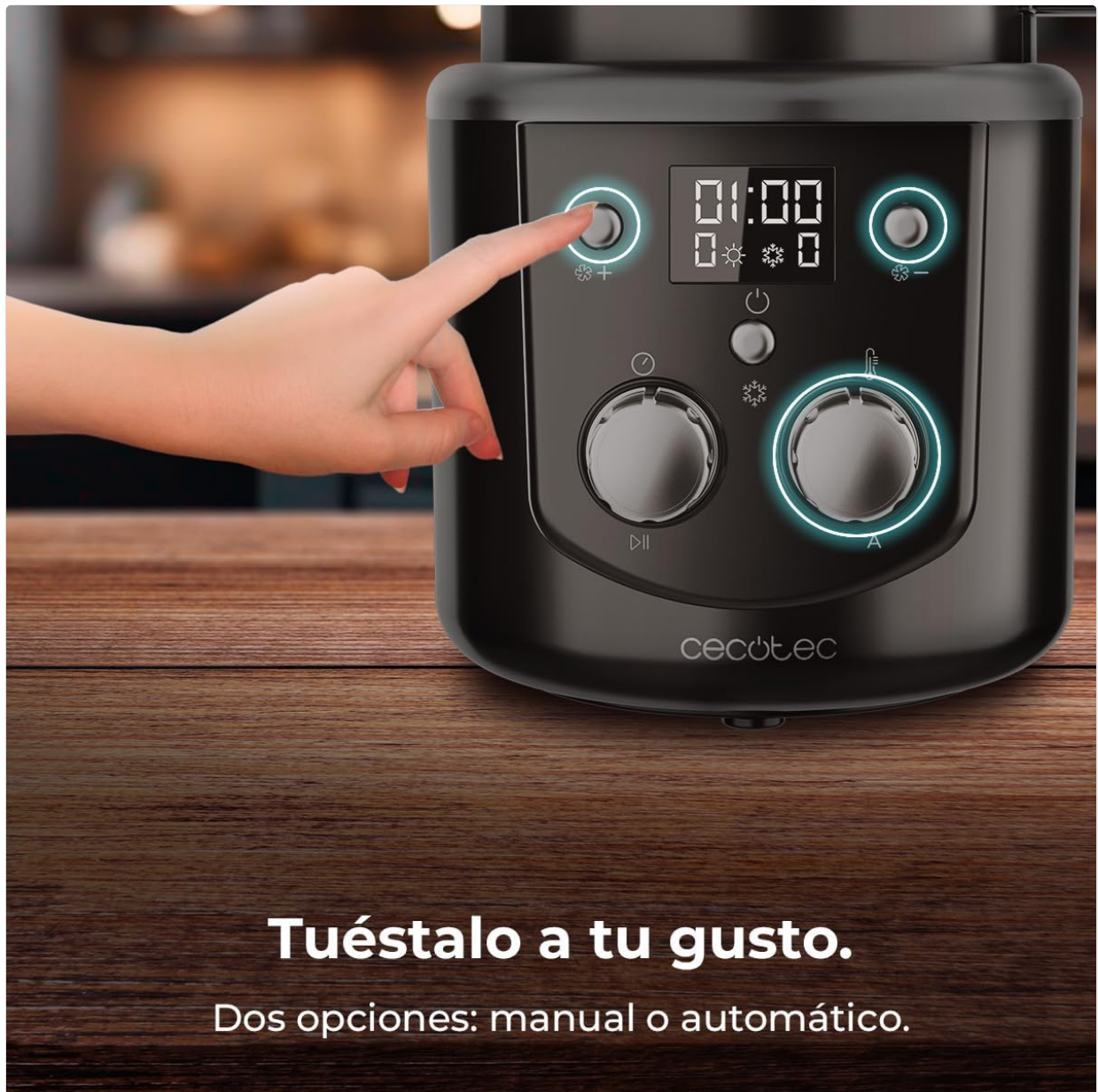
Image 2: Close-up of the control panel, illustrating the manual and automatic roasting options.