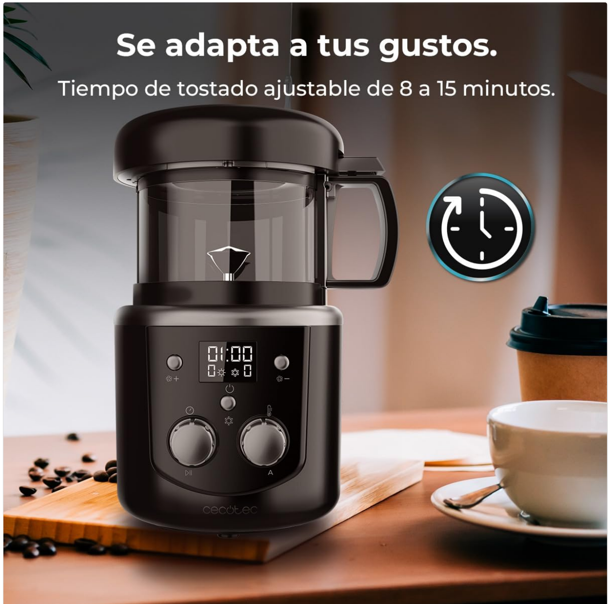
Image 3: The roaster displaying an adjustable time setting, emphasizing the 8 to 15 minute range.