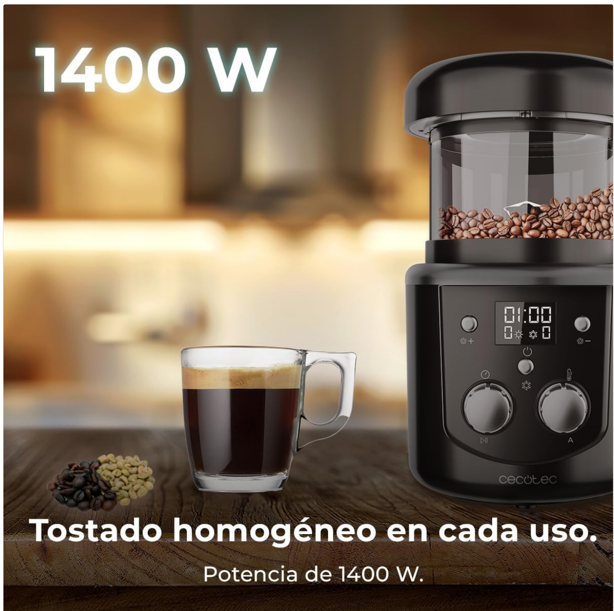
Image 1: The Cecotec Roaster Booster, highlighting its 1400W power and ability to achieve homogeneous roasting. A cup of coffee and green beans are also visible.