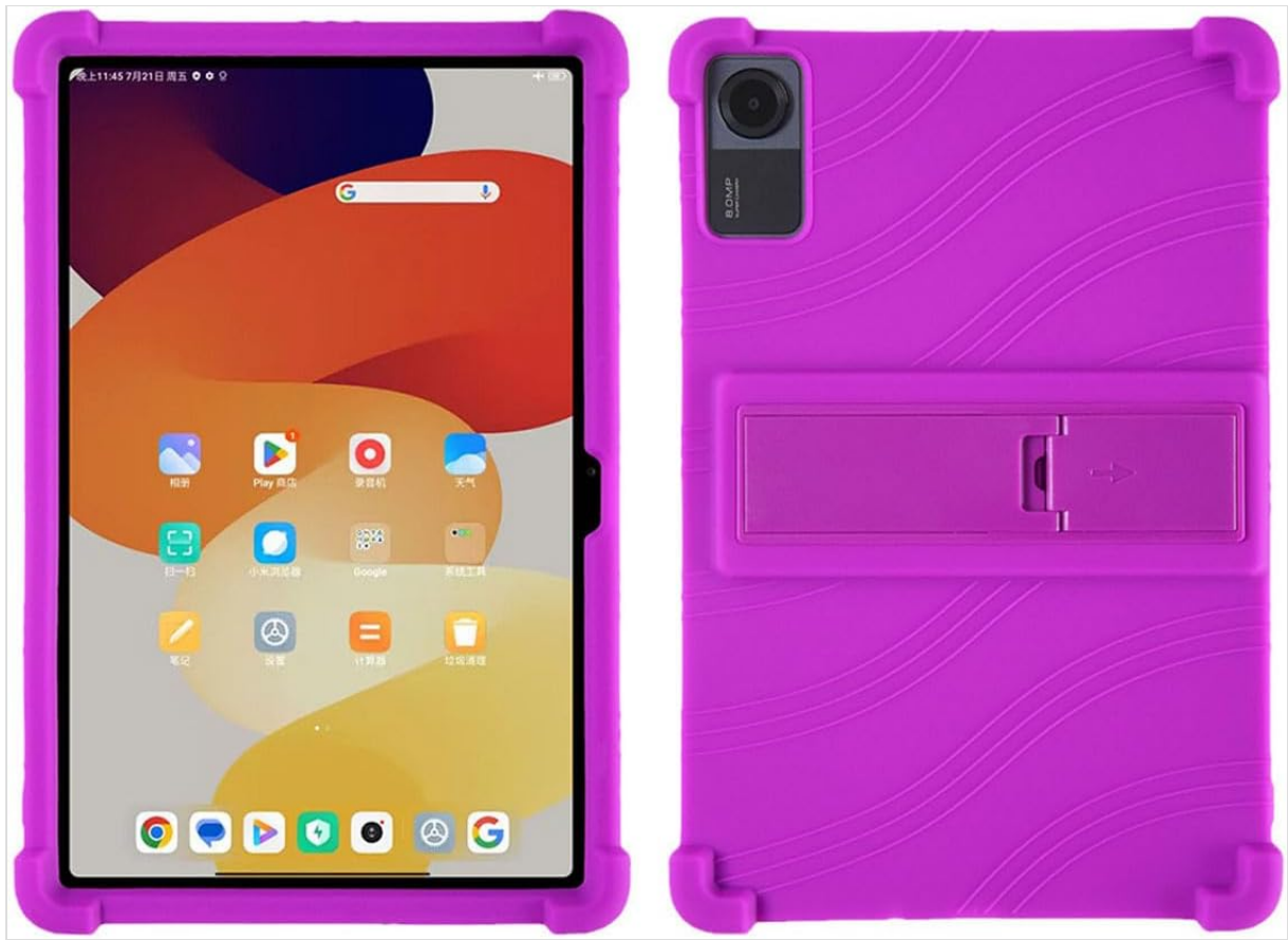
Figure 2.1: Front and back view of the FZZSZS Protective Case in purple, installed on a ZTE W202DS tablet, showcasing precise fit and design.