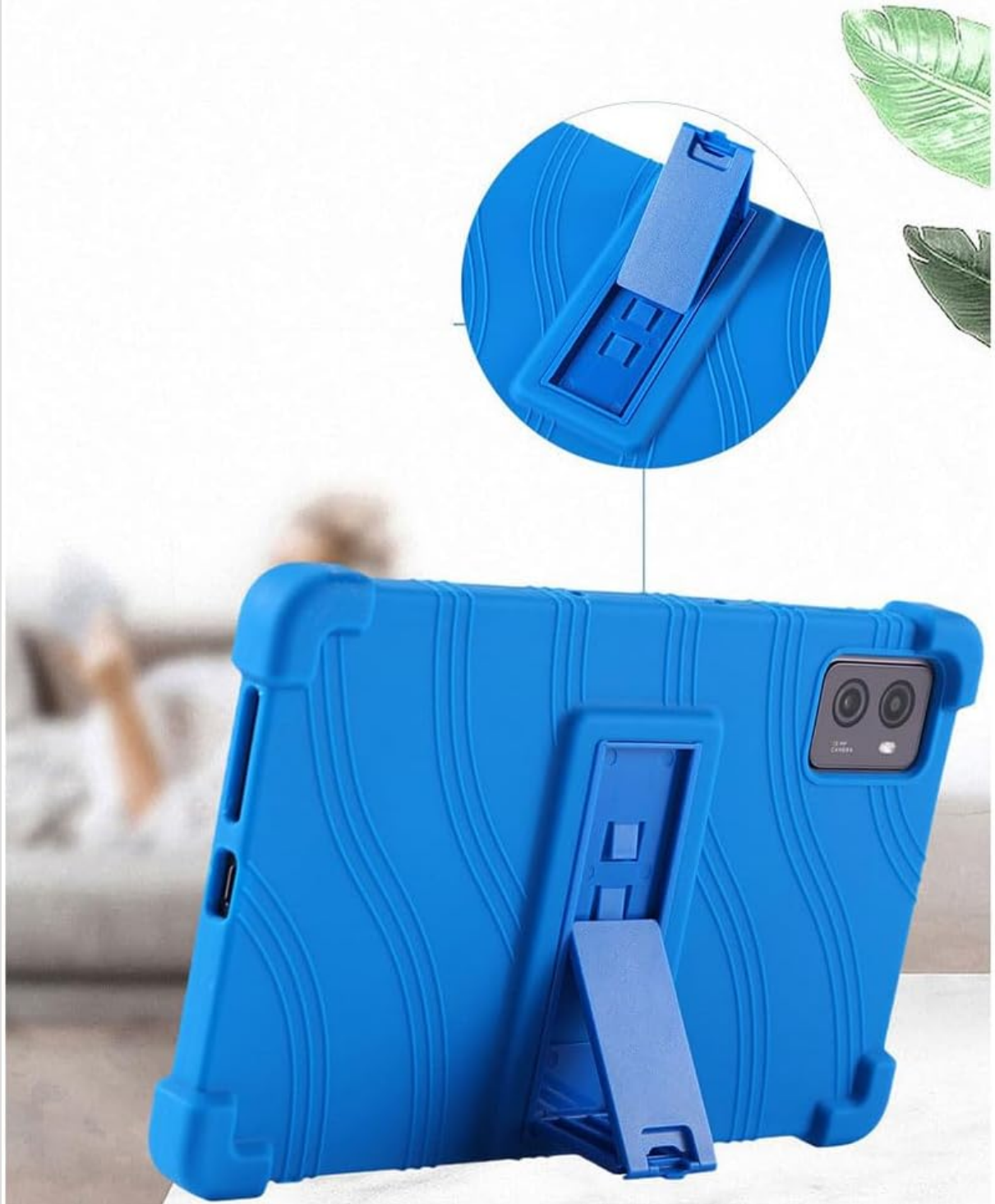
Figure 3.2: Close-up demonstrating the precise camera cutout, designed to protect the camera lens from scratches.