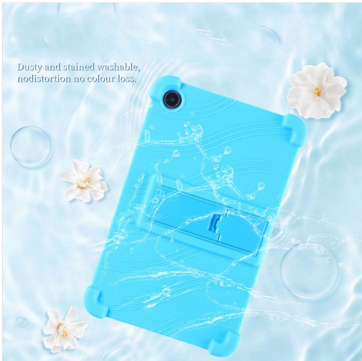
Figure 2.2: Illustration of the integrated silicone protective sleeve design, highlighting full package coverage, thickening for protection, shock absorption, and anti-drop features.