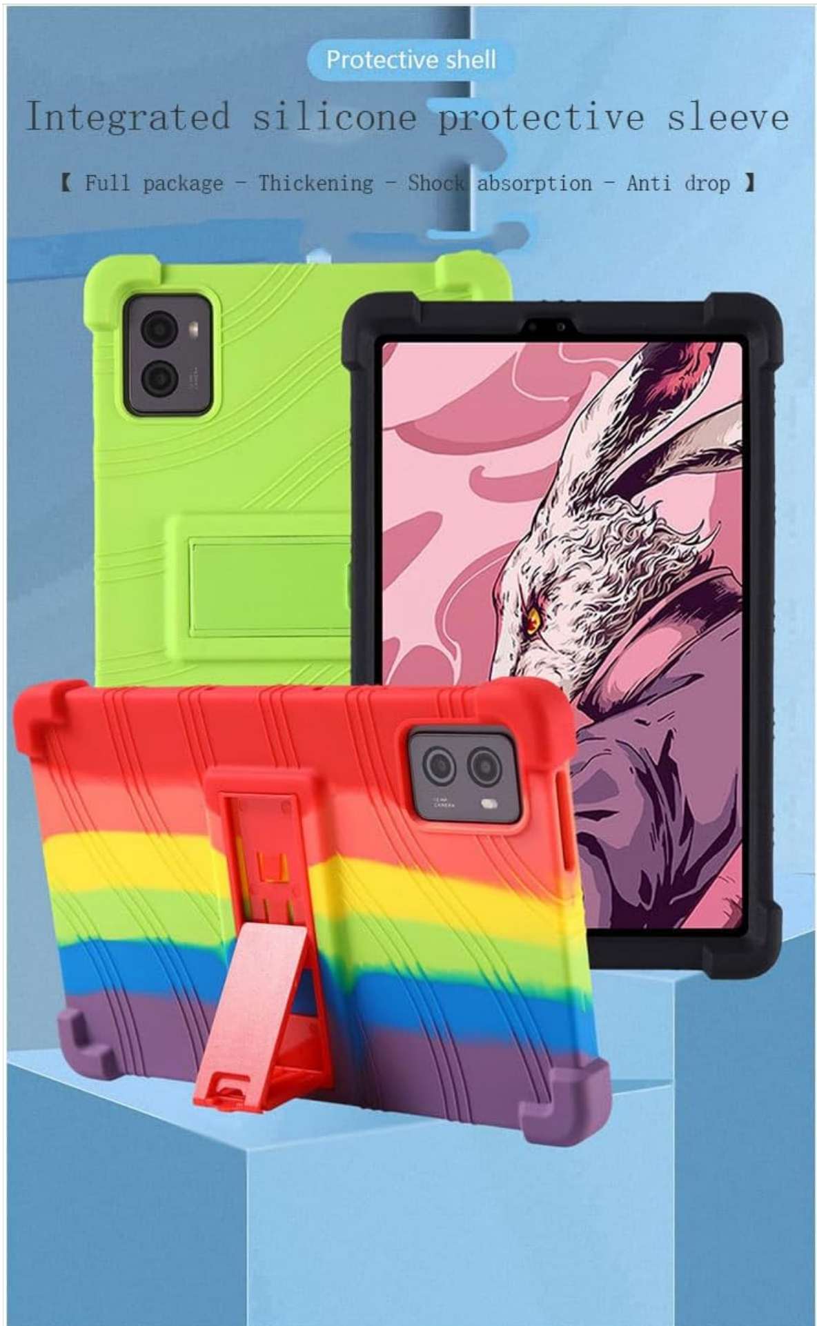
Figure 4.1: The anti-slip texture on the back of the case enhances grip and prevents accidental drops.

minor impacts and scratches. The flexible material allows for easy handling and reduces the risk of accidental slips.