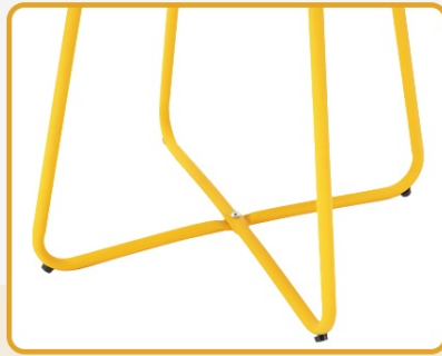
Attractive Cross Stand with Foot Pads