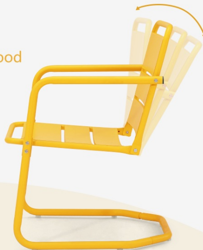
Image: Illustration of the C-spring motion chair demonstrating its gentle swaying capability.

Body swaying like the feeling of childhood sitting on a small wooden horse fun.