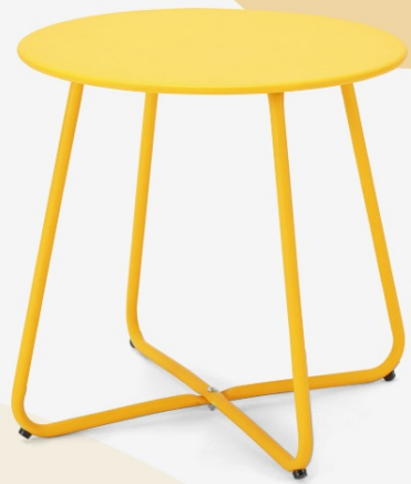
Image: Close-up of the round side table, highlighting its smooth edge and stable cross-stand with foot pads.