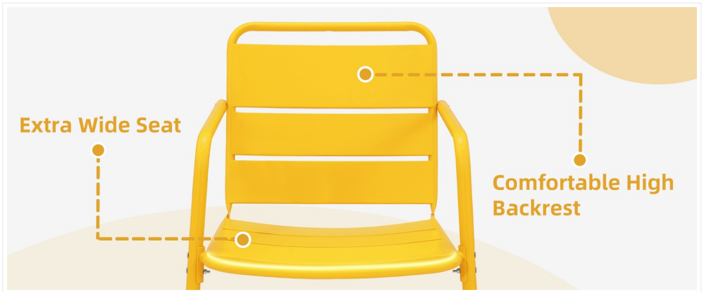
Image: Close-up view of the chair's wide seat and high backrest, designed for enhanced comfort.