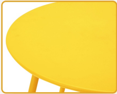
Smooth Table Edge to Prevent Bumps