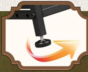
5 Adjustable Feet