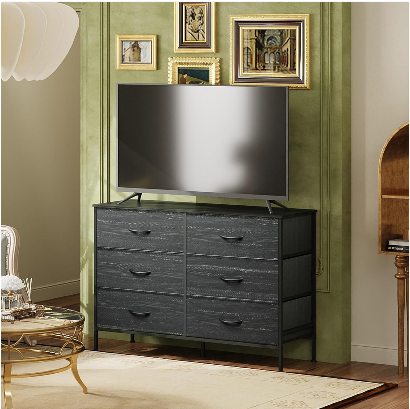
Figure 3: The dresser supporting a television, demonstrating its use as a media console.

The dresser is equipped with six detachable fabric drawers, providing ample storage for various items. The spacious wooden top offers additional display space for decorative items, books, or other personal belongings.