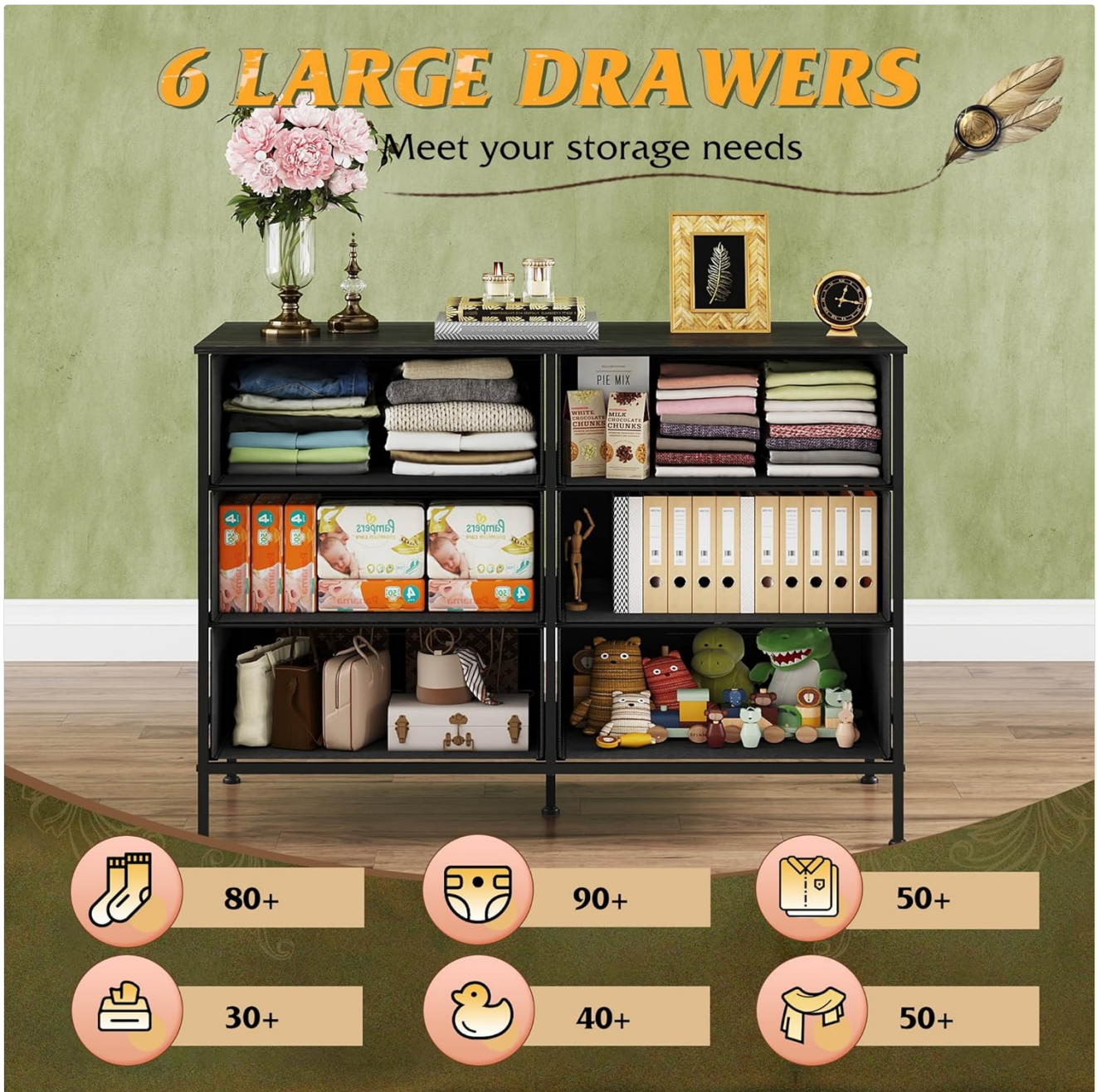
Figure 4: Drawers opened to illustrate the internal storage capacity for clothing and other household items.

Each drawer features a smooth slide track and curved handles, ensuring easy and smooth opening and closing. The robust construction allows the dresser to bear up to 100 lbs on its top surface without compromising stability.