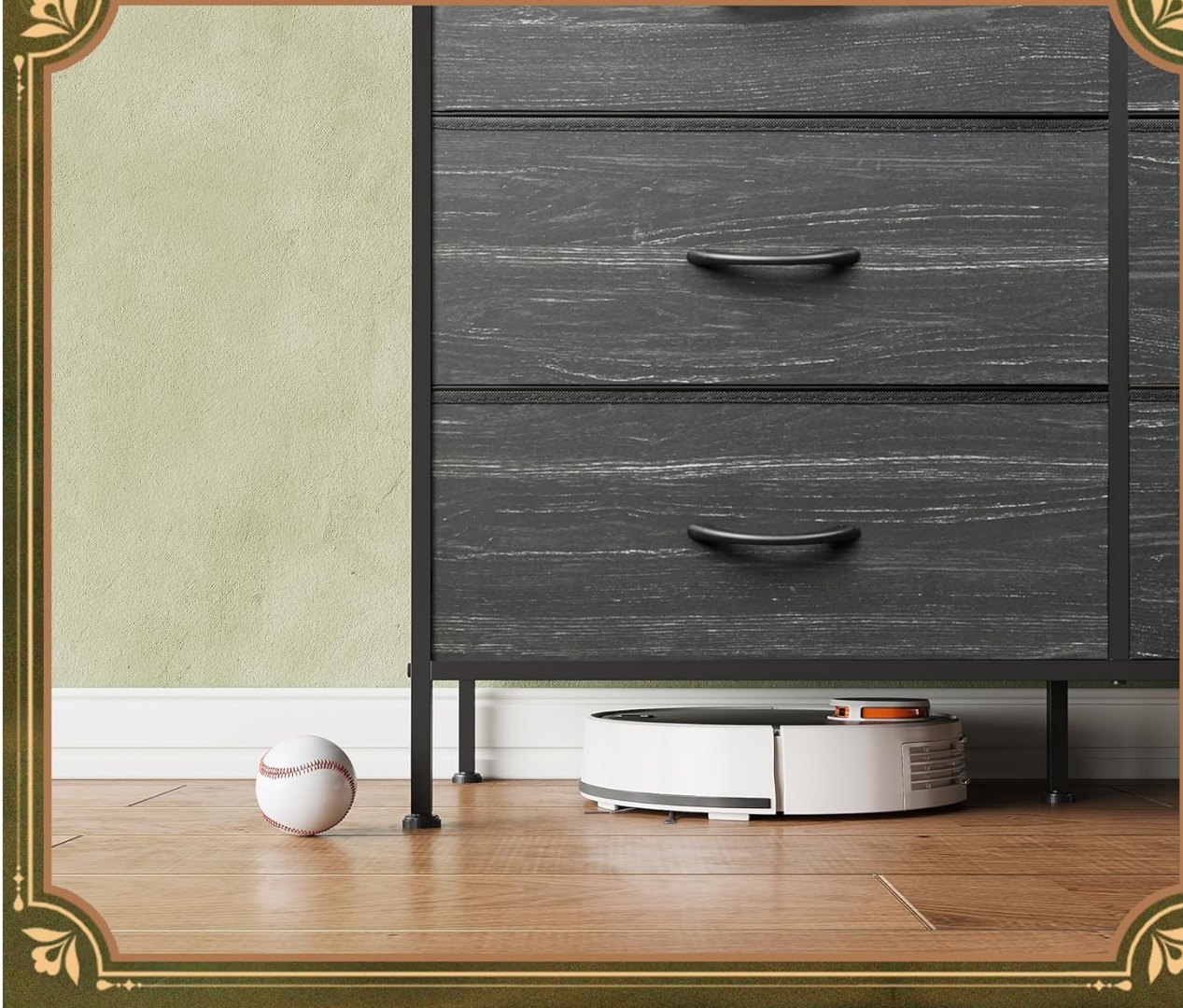
Figure 1: Illustration of the dresser's sturdy steel frame, highlighting the anti-tilt device and adjustable feet for stability.

The dresser features a robust 15mm thickened metal steel frame with cross support rods for enhanced durability and stability. The fabric drawers are constructed with a 3-tier design, combining high-quality fiberboard, breathable non-woven fabric, and a polyester exterior for strength and longevity.