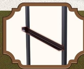
Solid Drawer Slides