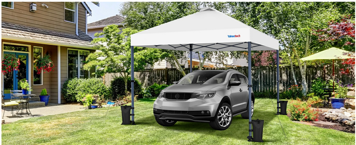
Visual representation of the canopy's water and UV resistant properties.

The canopy fabric is waterproof and features UPF 50+ UV protection. A vented top allows for better air circulation and helps prevent wind uplift. Always ensure the canopy is properly secured with all provided accessories (sandbags, stakes, guy lines) to withstand light wind conditions. Avoid use in severe weather.