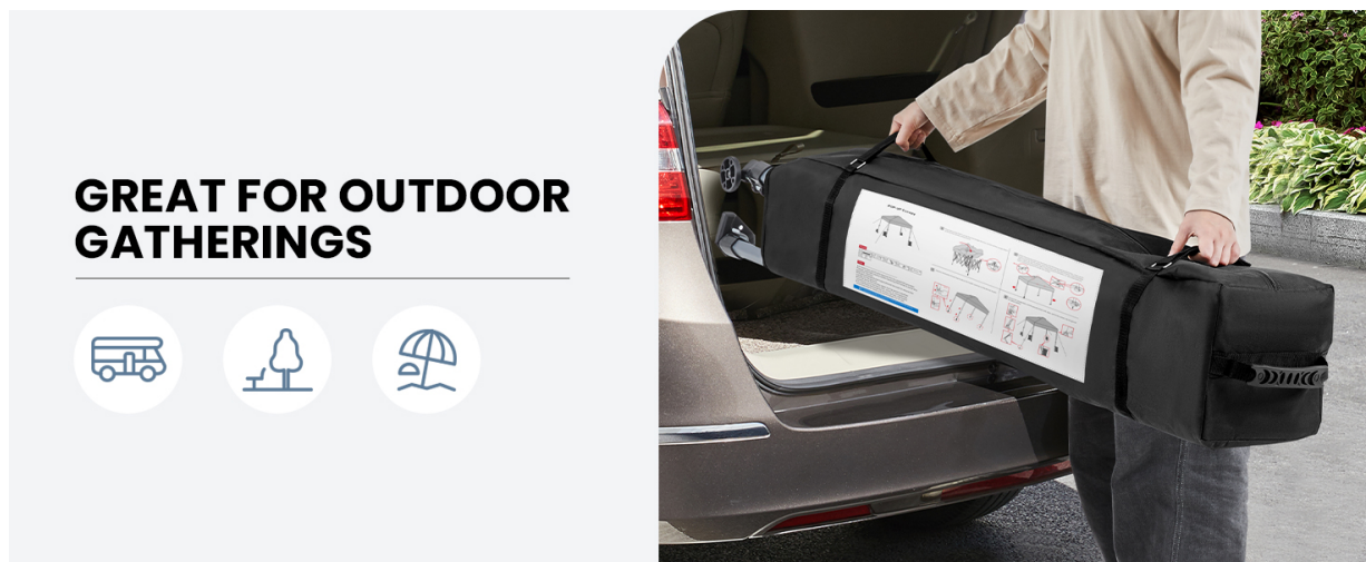
Close-up of the durable carry bag with wheels, handle, and zippers.

Video demonstrating the takedown process of a Yaheetech pop-up tent, including collapsing and packing.