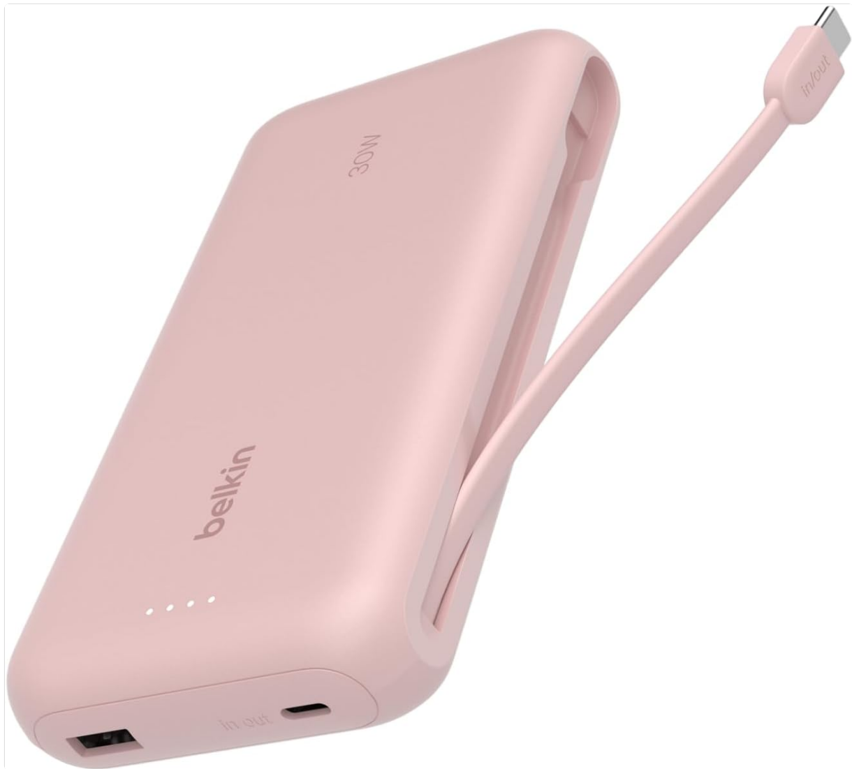
Figure 1: Belkin Portable Charger, Pink model, showcasing its sleek design and integrated USB-C cable.