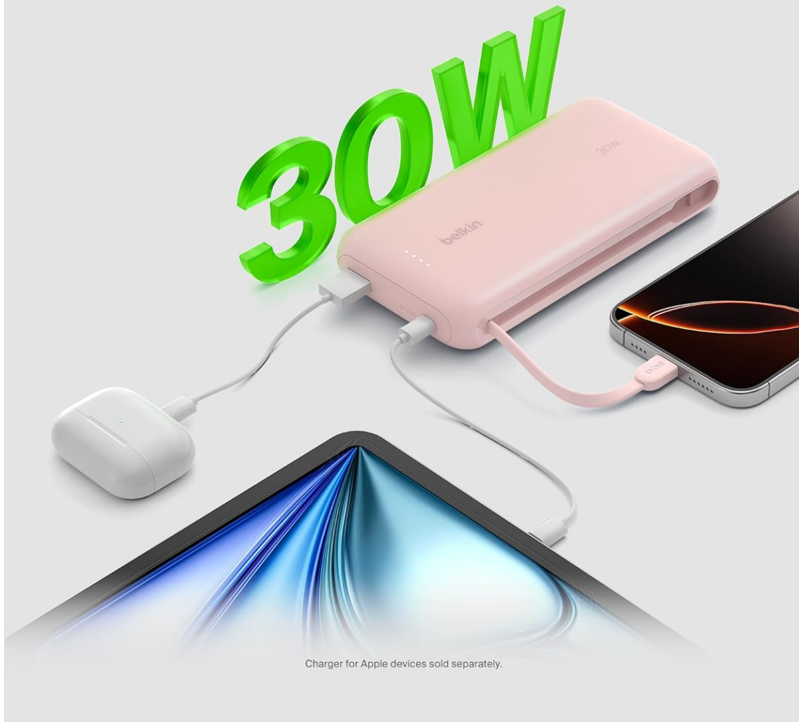
Figure 4: The power bank simultaneously charging an iPhone, an iPad, and a pair of AirPods, demonstrating its multi-device charging capability.