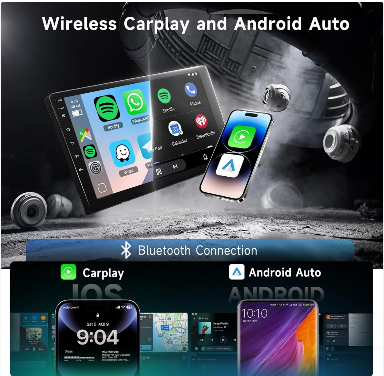
Image: Demonstrates the wireless CarPlay and Android Auto functionality, showing smartphone integration with the car radio.