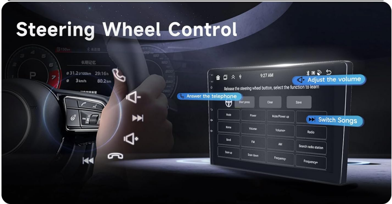
Image: Shows the display from the HD reversing camera and an example of steering wheel controls.