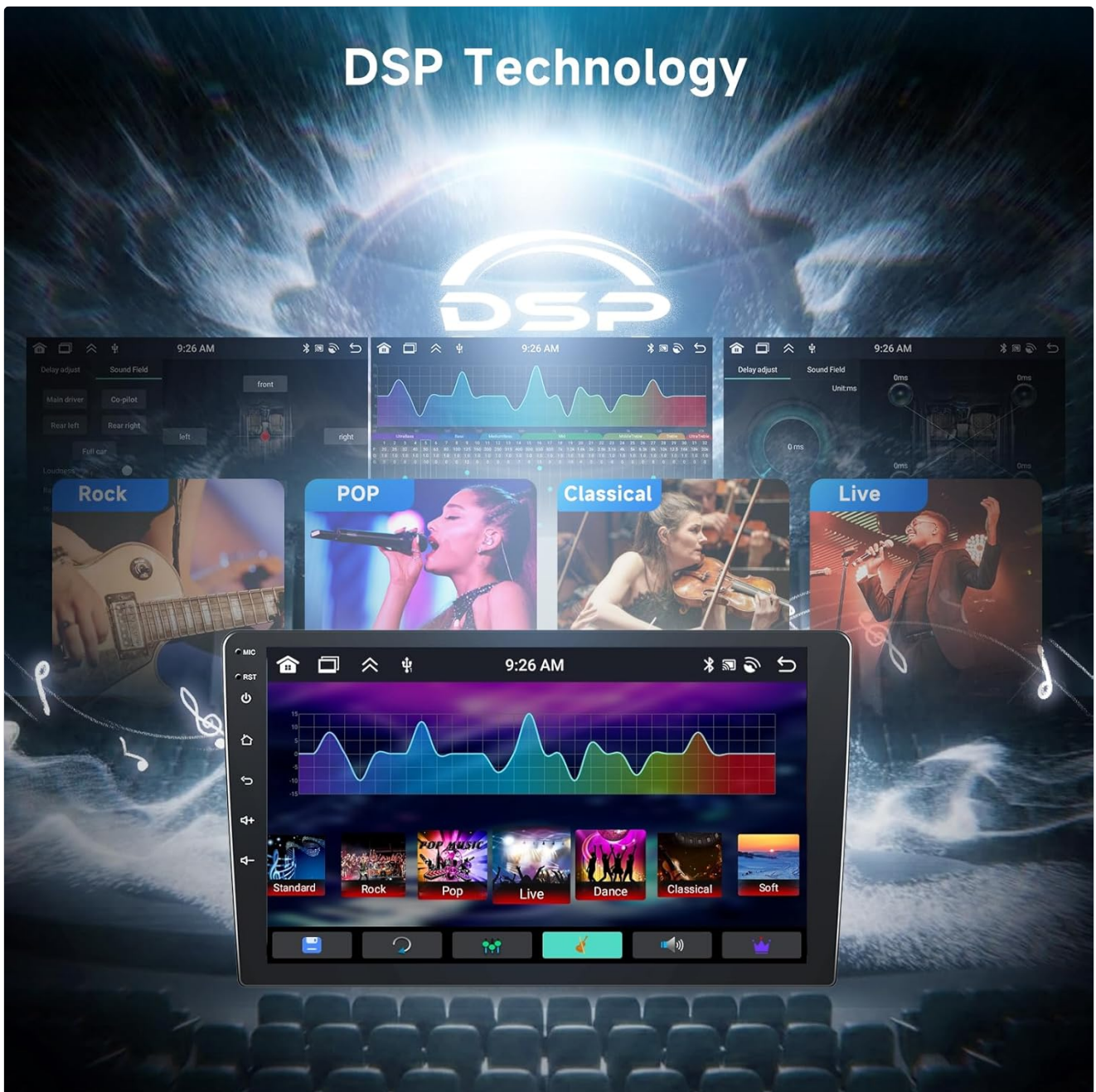
Image: Depicts the DSP technology interface, showcasing various sound equalization and adjustment options.