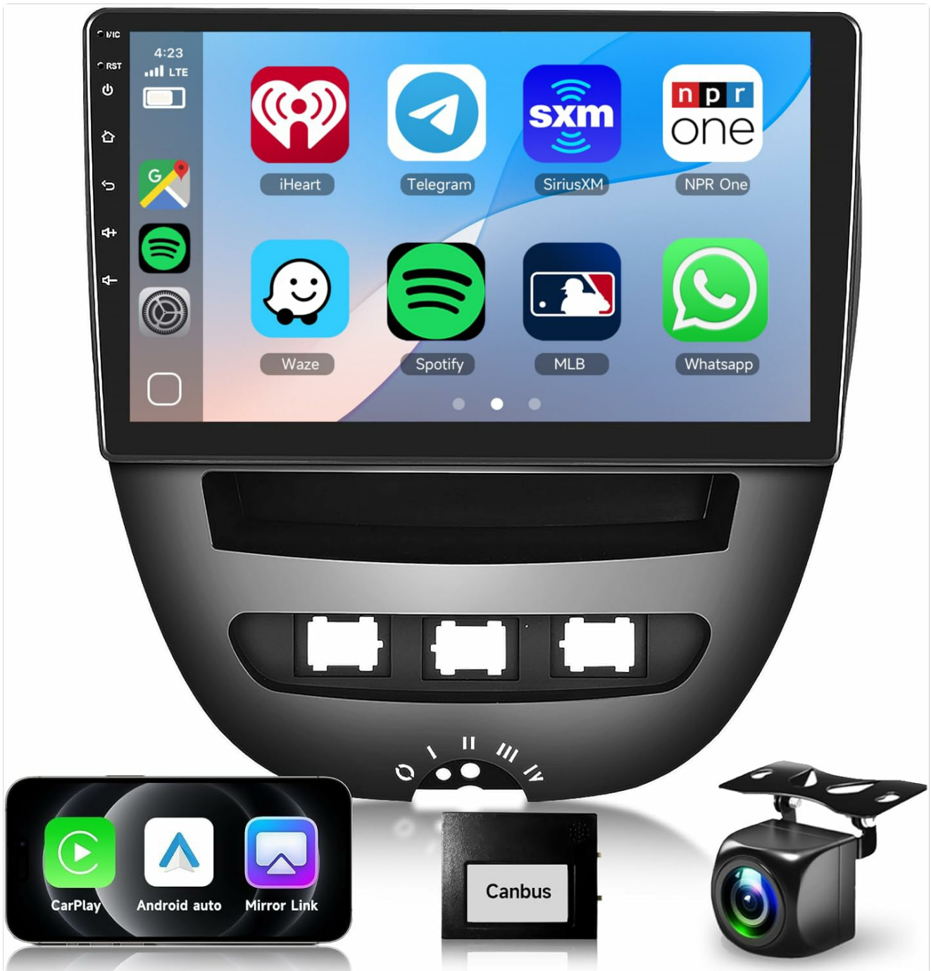
Image: Comparison of the car dashboard before and after installing the PODOFO Android 13 Car Radio, demonstrating seamless integration.