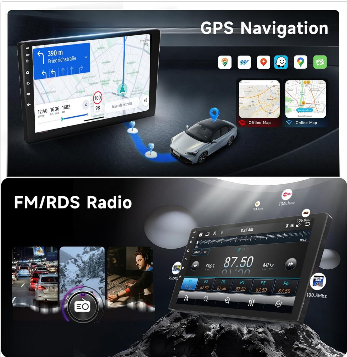
Image: Illustrates the GPS navigation feature with map display and route information.