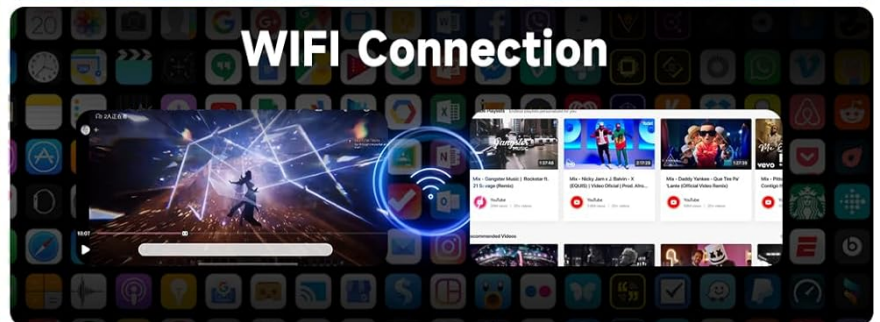
Image: Visual representation of the core specifications including Android 13, 6GB RAM, 128GB ROM, Octa-Core processor, Bluetooth, and WiFi.