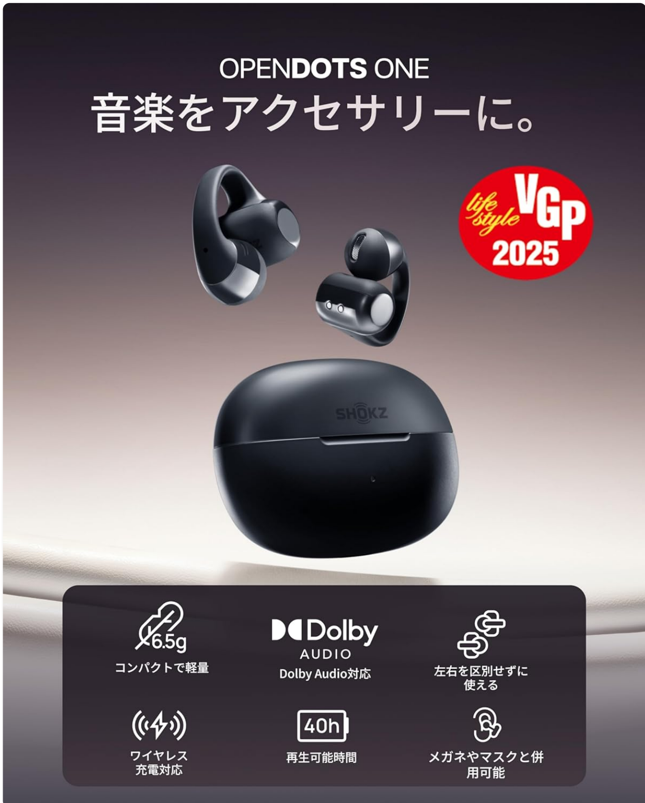
Image 1.2: Overview of key features including lightweight design, Dolby Audio, 40-hour battery, IP54 rating, and wireless charging.