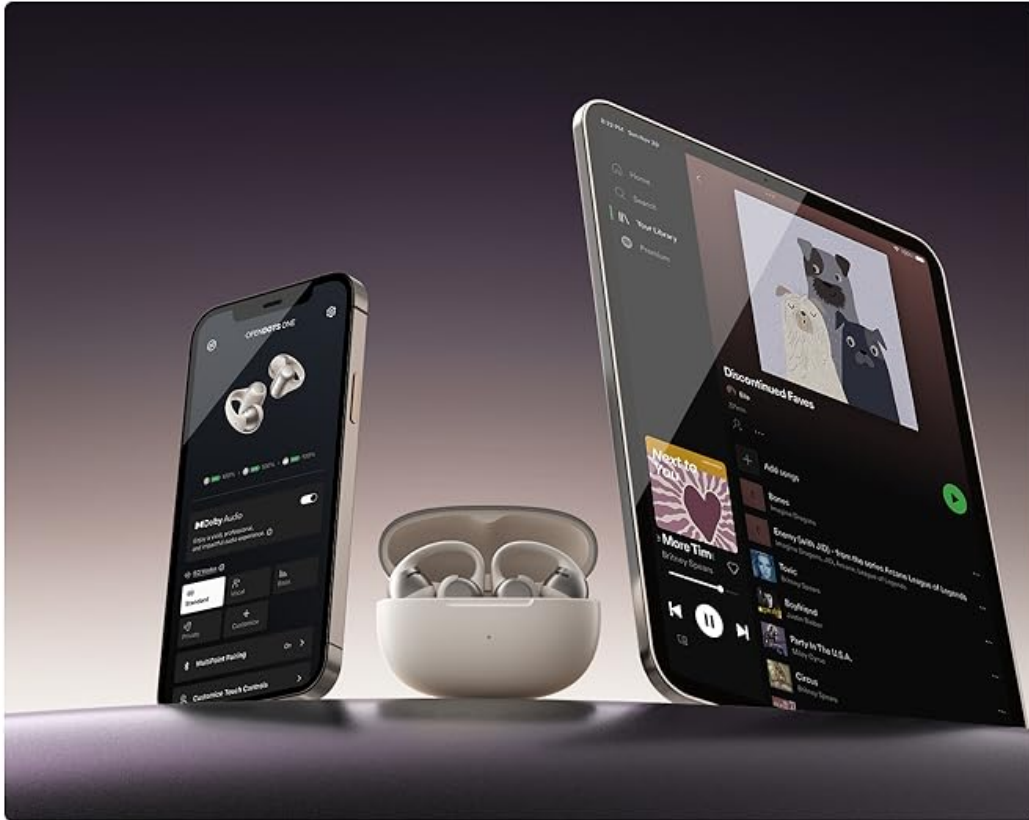
Image 3.1: The Shokz app interface, showing options for EQ settings and other customizations.