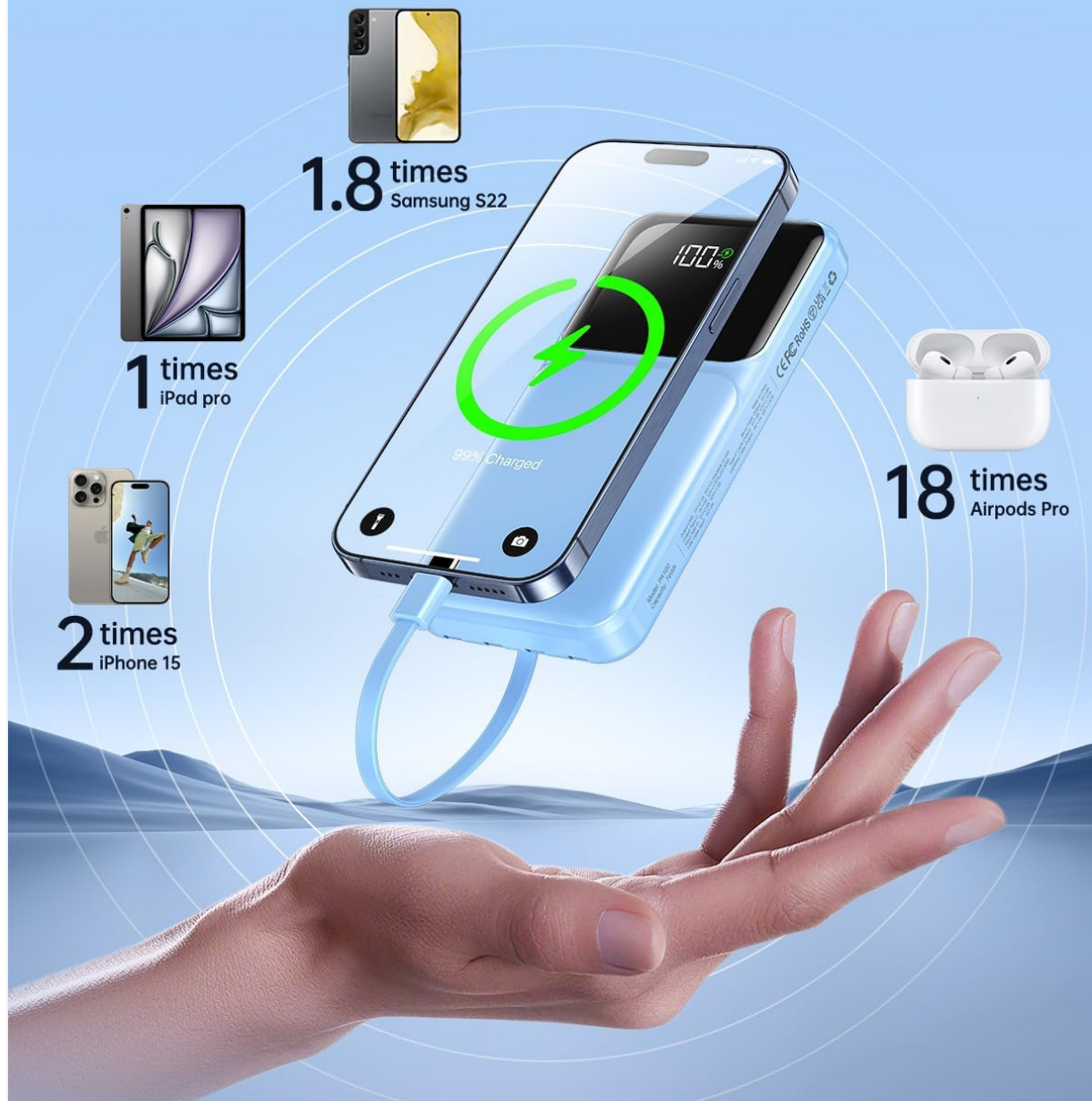
Figure 4: The power bank's compatibility and charging capacity for various devices.