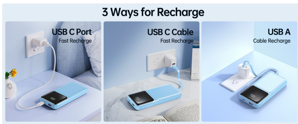
Figure 2: Various methods for recharging the power bank.