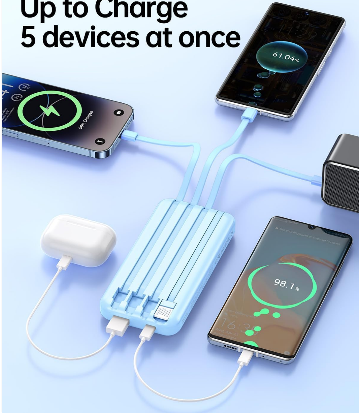
Figure 3: Charging multiple devices simultaneously.