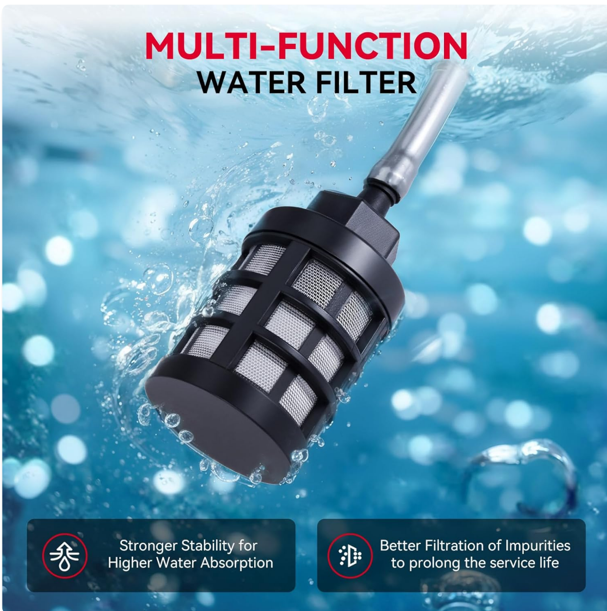
Figure 7: The multi-function water filter ensures better filtration of impurities.