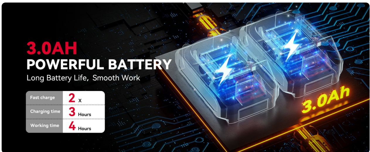
Figure 6: Battery specifications and charging details.

The 3.0Ah Lithium-Ion batteries charge fully in approximately 3 hours. Use the provided charger to ensure optimal battery life.