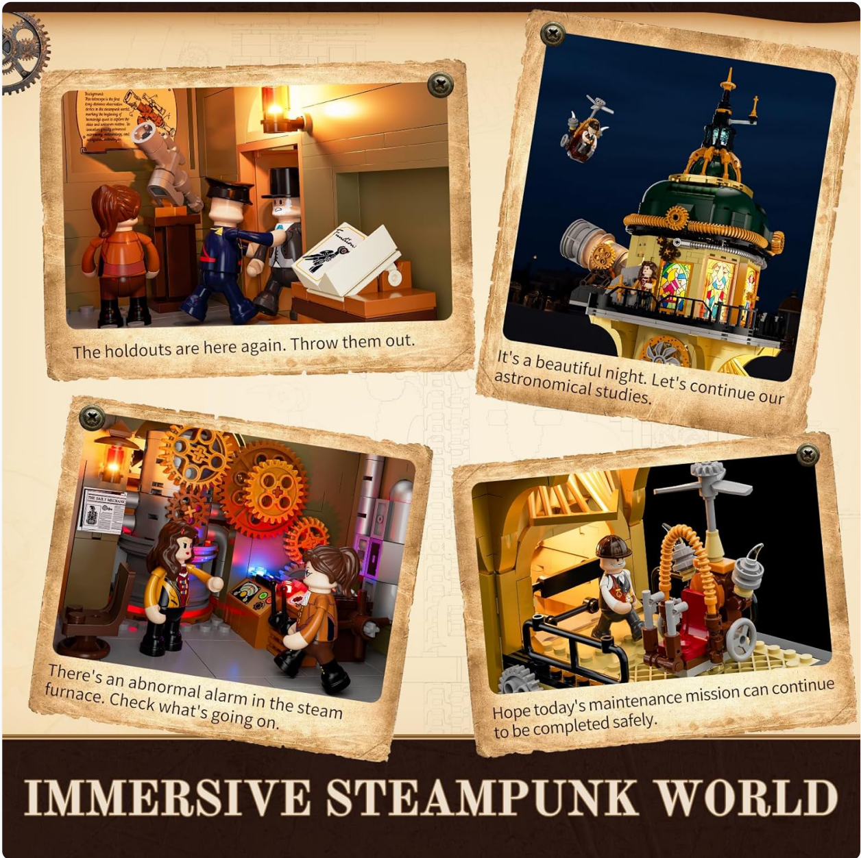
The holdouts are here again. Throw them out.