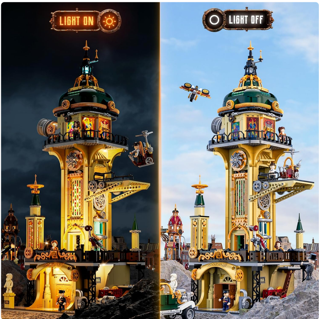
This image illustrates the visual transformation of the Observatory Tower from daylight to an illuminated night scene, highlighting the integrated lighting system.

The set includes an exclusive lighting kit with 19 distinct glow points. These lights illuminate various parts of the tower, including the entryway chandelier, reactor's red flames, blue/red indicator lights, the telescope's warm glow, and a breathing blue beacon. The lighting system is USB powered (batteries not included).