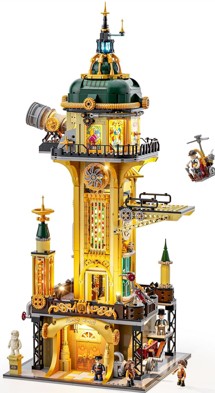
The complete FUNWHOLE F9070 Steampunk Observatory Tower, showcasing its intricate design and integrated lighting.