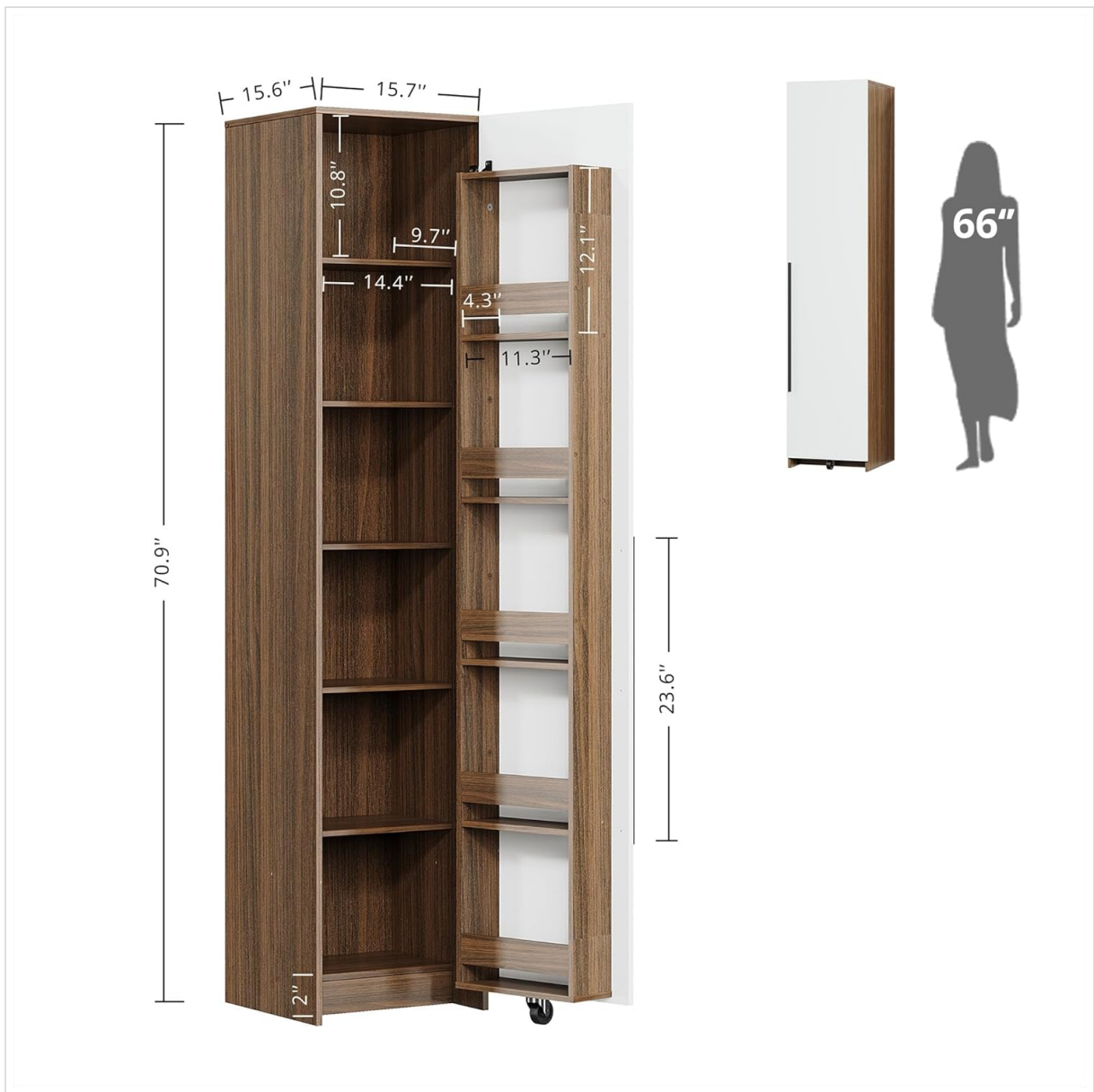
Image: Cabinet dimensions and internal layout. This diagram illustrates the overall size and the arrangement of shelves within the cabinet and on the door.

Your browser does not support the video tag.