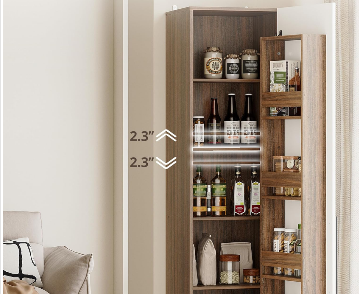
Image: Adjustable shelf feature. This image highlights the flexibility of the internal shelves, allowing users to customize storage space.

Meet your storage needs for items of different sizes