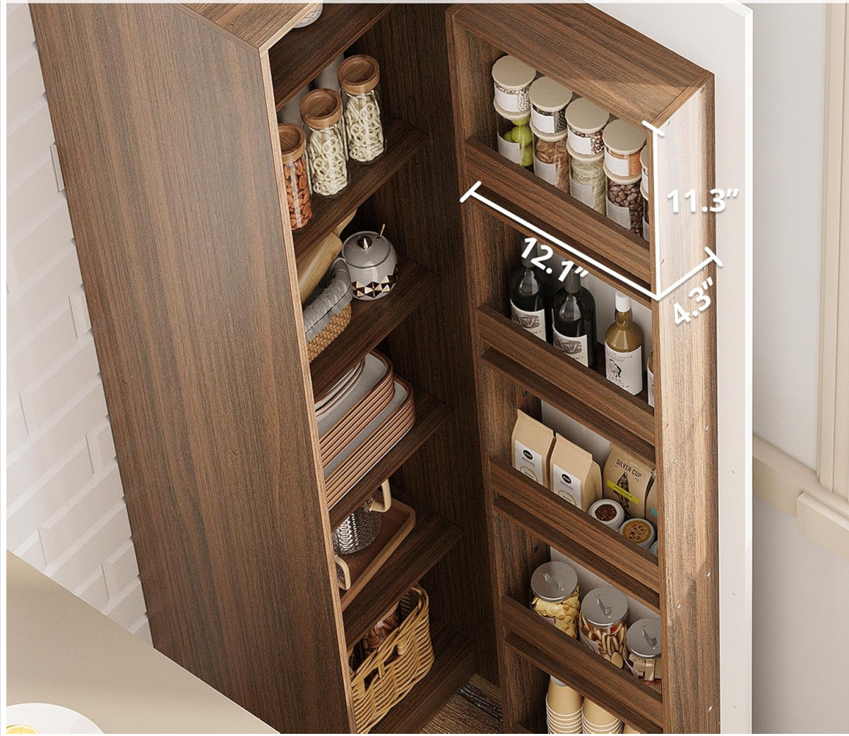
Image: 5-layer side storage rack. This image details the door-mounted shelves, showing their capacity for smaller items and the design to prevent items from falling.

Widen the partition to better prevent items from falling