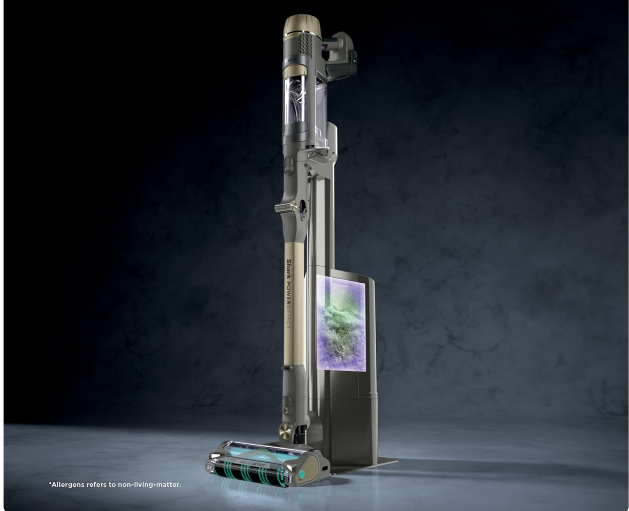
Figure 3: The PowerDetect intelligence automatically boosts power when dirt, edges, or different floor types are detected.

Auto-empty dock locks away dirt, debris, and allergens* for up to 45 days after cleaning