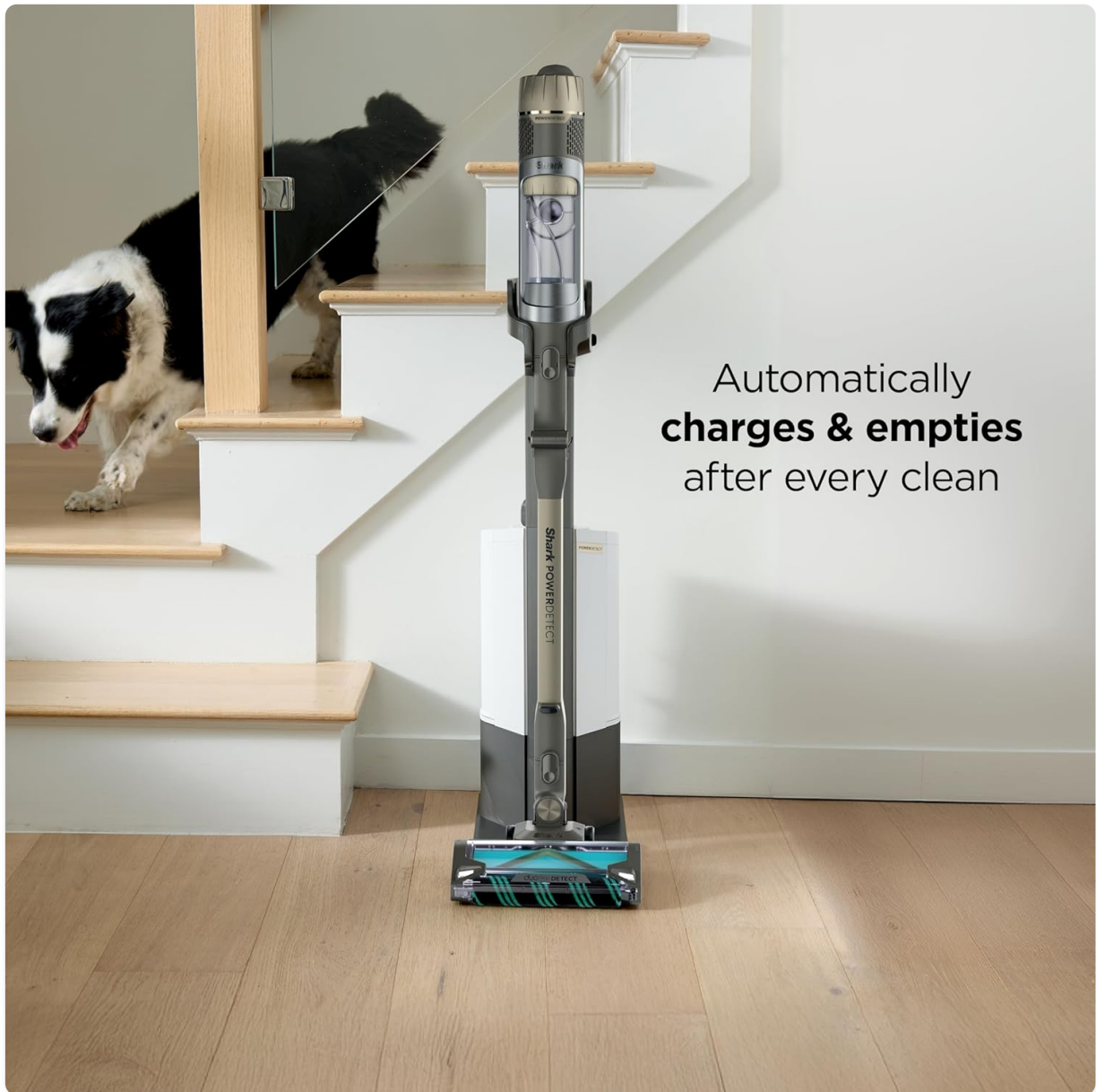
Figure 2: The Shark PowerDetect vacuum automatically charges and empties when docked on its Auto-Empty System.

Dock the assembled vacuum onto the Auto-Empty base. The vacuum will automatically begin charging. A full charge takes approximately 6 hours. The Auto-Empty system also features Odor Neutralizer Technology to guard against odors from collected debris.