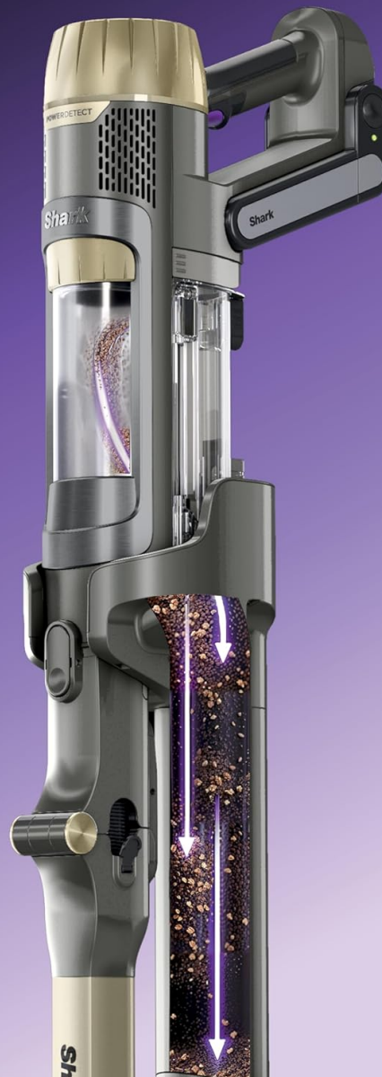
Figure 8: The Auto-Empty system seals away fine dust, debris, allergens, and odors after every clean, preventing dust clouds.

*Allergens refers to non-living-matter. **vs. Shark Navigator NV130.