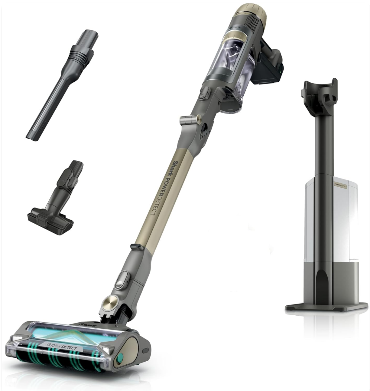
Figure 1: All components of the Shark PowerDetect Clean & Empty system, including the main unit, attachments, and auto-empty base.

Connect the MultiFLEX wand to the main handheld vacuum until it clicks securely. Then, attach the DuoClean Detect nozzle to the bottom of the MultiFLEX wand, ensuring it clicks into place.