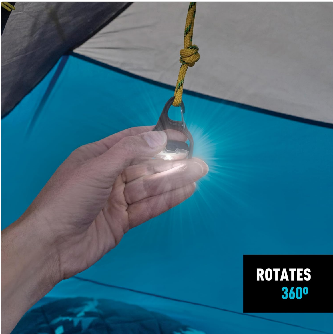
Figure 3: The lantern's 360-degree swiveling body allows for adjustable light direction.