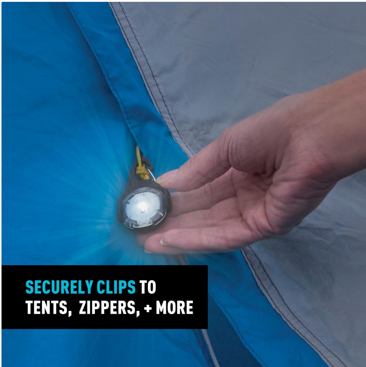
Figure 4: The integrated carabiner clip allows for secure attachment to various items like tents or zippers.

Your browser does not support the video tag.