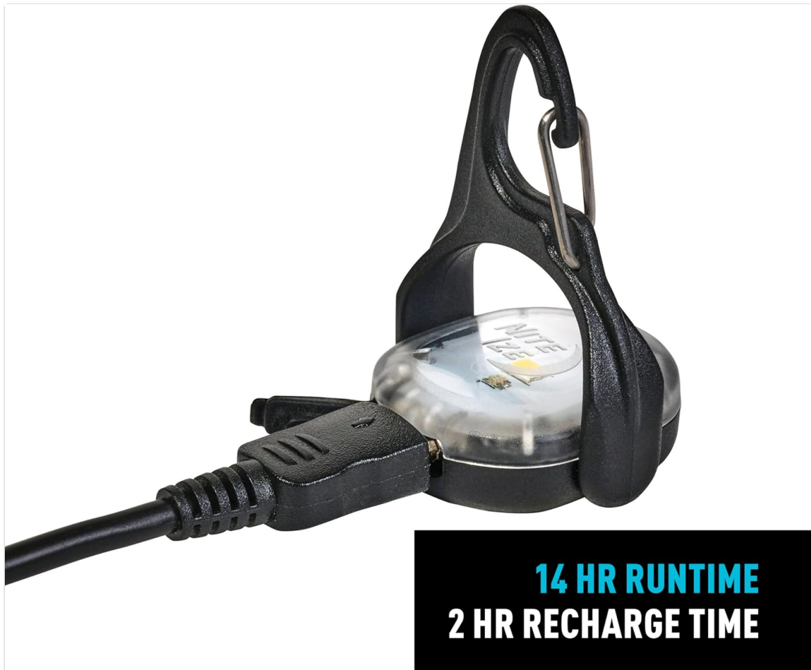
Figure 5: The charging port of the MoonLit Micro Lantern with a Micro-USB cable inserted. The red light indicates active charging.