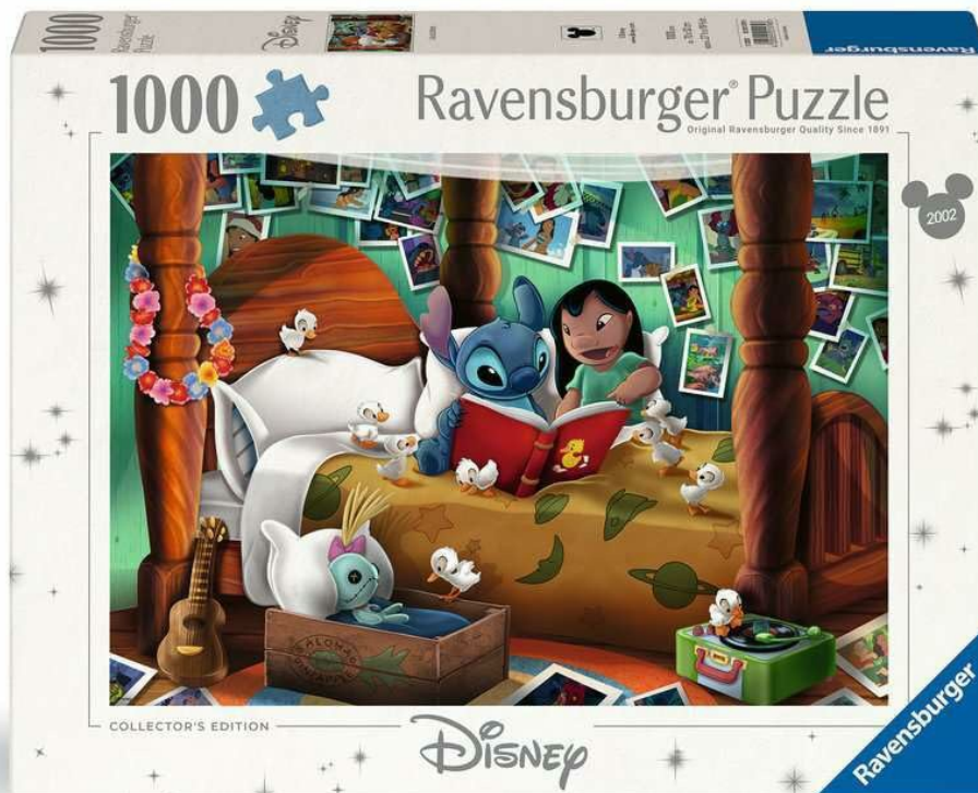
Image 1.1: The completed Ravensburger Lilo & Stitch 1000 Piece Jigsaw Puzzle, showcasing the detailed artwork.

This manual provides instructions for the Ravensburger Collectors Edition Lilo & Stitch 1000 Piece Jigsaw Puzzle. This puzzle features a vibrant depiction of Lilo and Stitch, designed for enthusiasts aged 14 and above. The puzzle is crafted with Ravensburger's Softclick Technology for a precise fit and is made from FSC-certified materials.