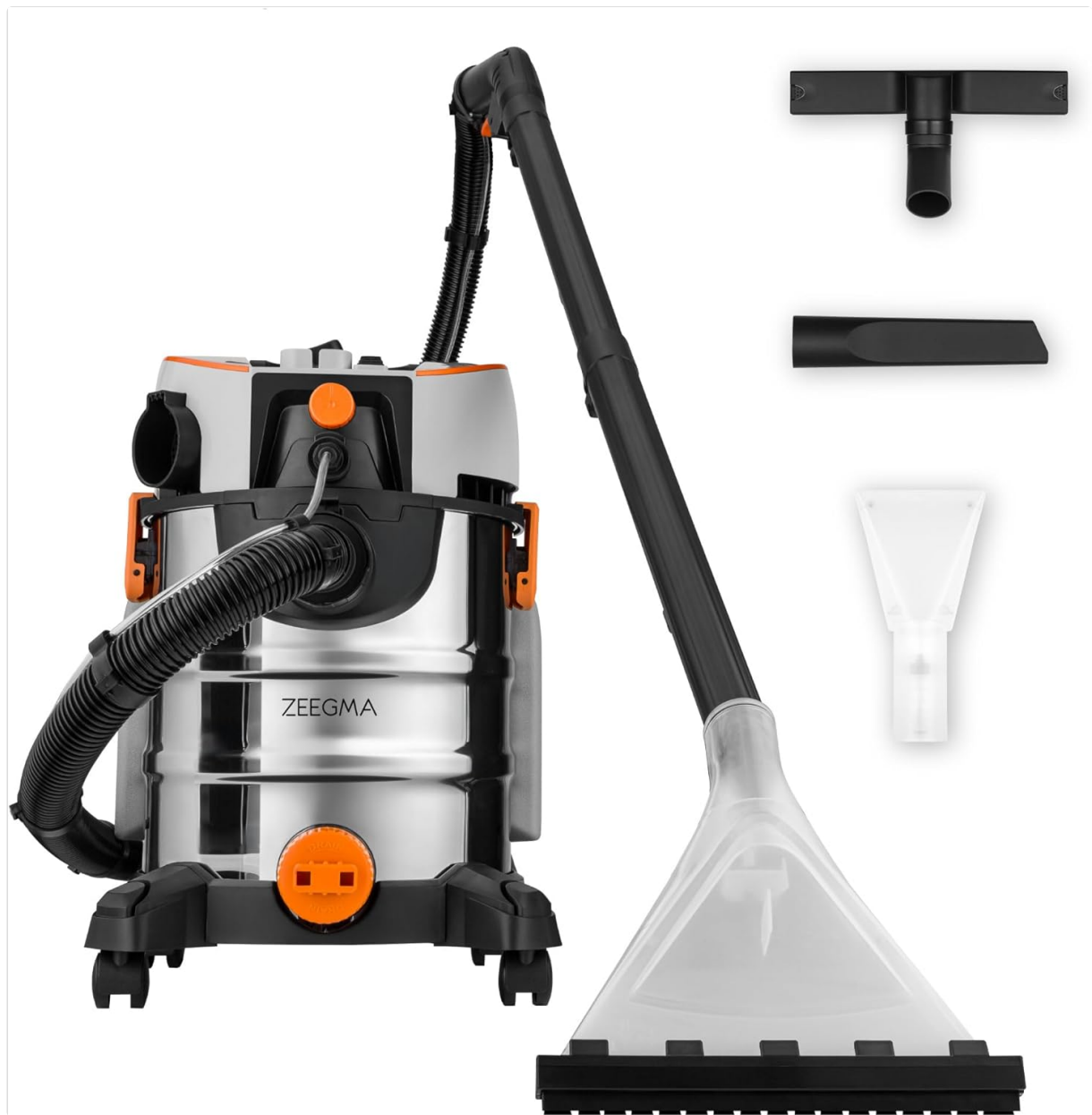
Image 1: The Zeegma ZONDER Pro Aqua wet and dry vacuum cleaner with its included accessories, such as the floor nozzle, crevice tool, and spray/extraction nozzles.