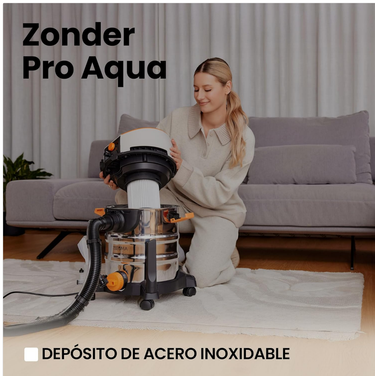
Image 7: A user removing the filter from the Zeegma ZONDER Pro Aqua, illustrating a key step in routine maintenance.