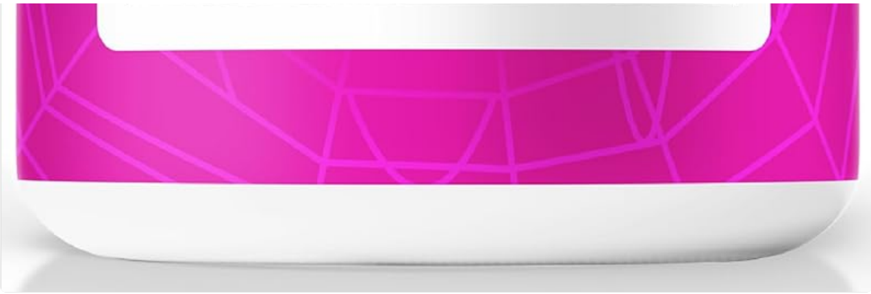
Image: Rear view of the Spider-Sense bottle, clearly showing the "Suggested Use" and "Caution" sections of the label.