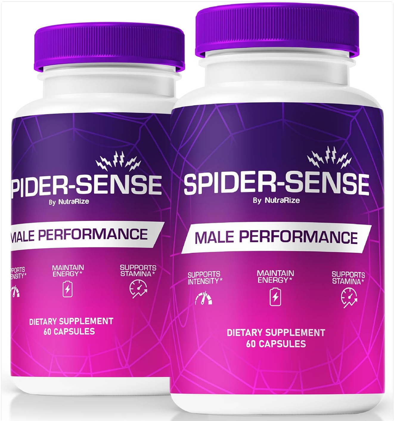
Image: Two bottles of NutraRize Spider-Sense Male Performance Dietary Supplement, showing the front label with product name and key benefits.