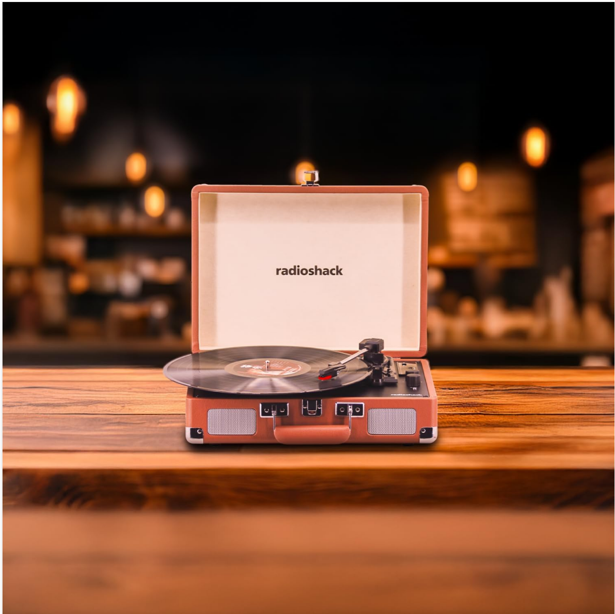
Image: The RadioShack Portable Suitcase Turntable, open and ready to play a record.