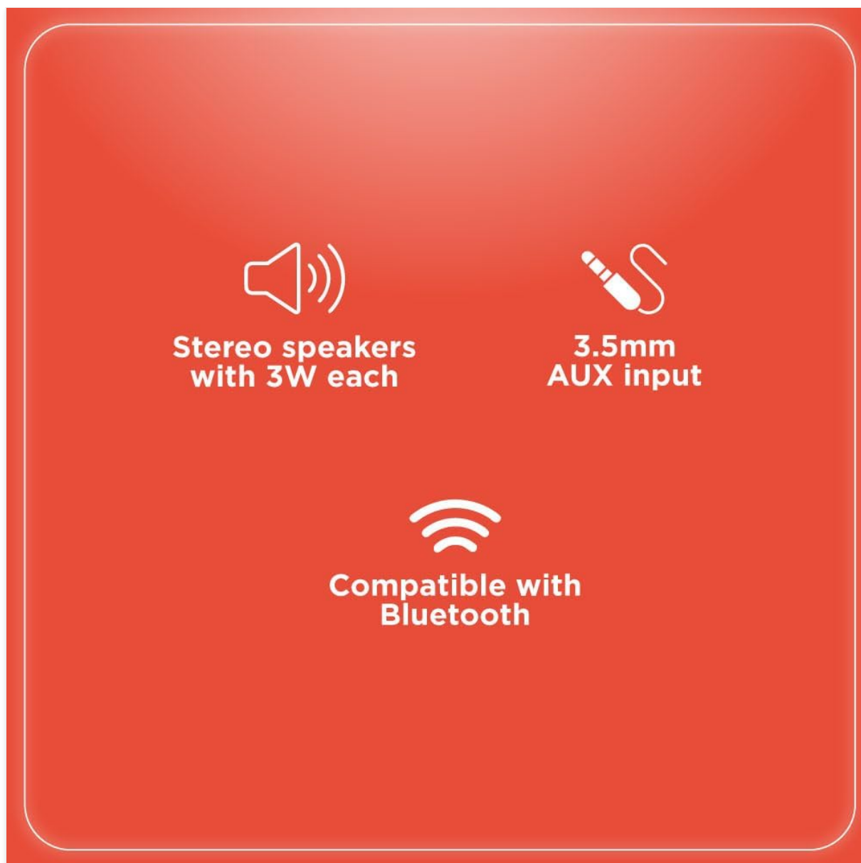
Image: Key features including stereo speakers, 3.5mm AUX input, and Bluetooth compatibility.