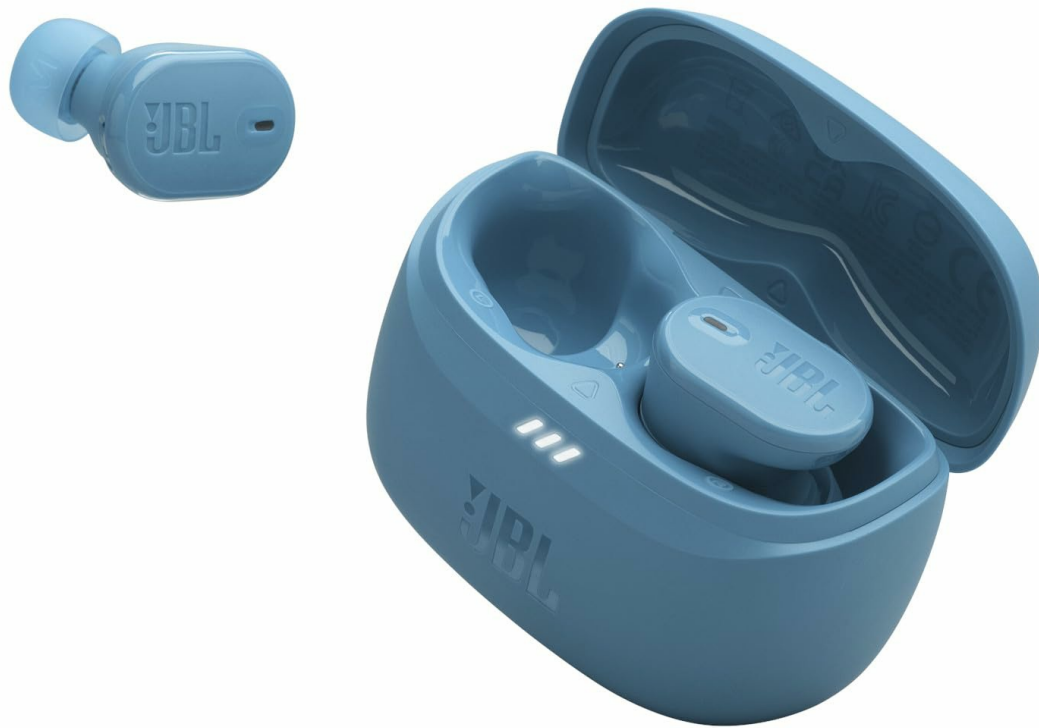
Image: JBL Tune Buds 2 in Teal, showing both earbuds and the charging case.