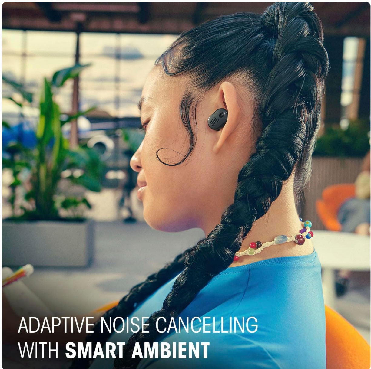
Image: A person wearing teal JBL Tune Buds 2 earbuds, illustrating the use of Adaptive Noise Cancelling and Smart Ambient features.