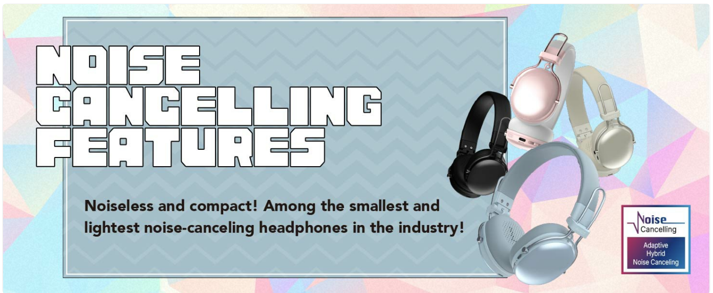
Image: Graphic detailing the noise canceling capabilities of the AVIOT WA-Q1 headphones, including Adaptive Hybrid Noise Canceling.