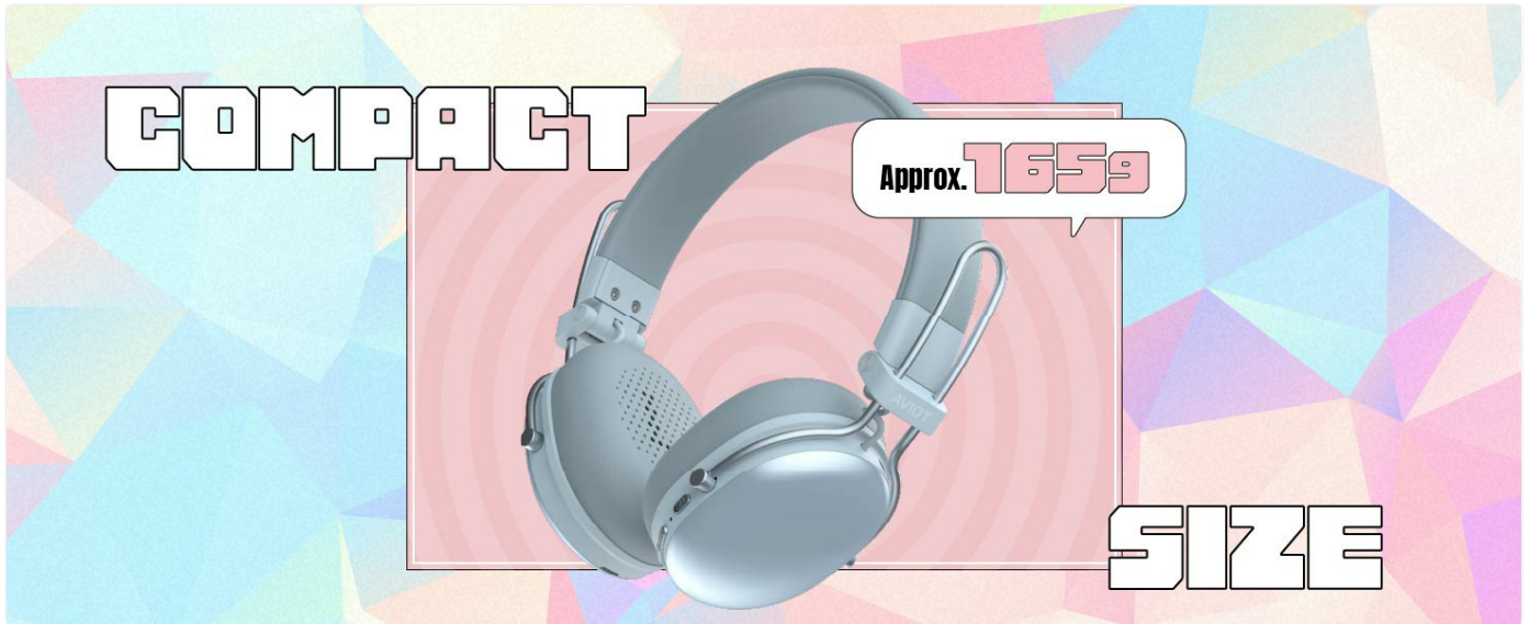
Image: Illustration highlighting the compact size and lightweight design of the WA-Q1 headphones, weighing approximately 165 grams.

The AVIOT WA-Q1 headphones are designed for portability and comfort, weighing approximately 165g. They feature intuitive controls for easy access to various functions.