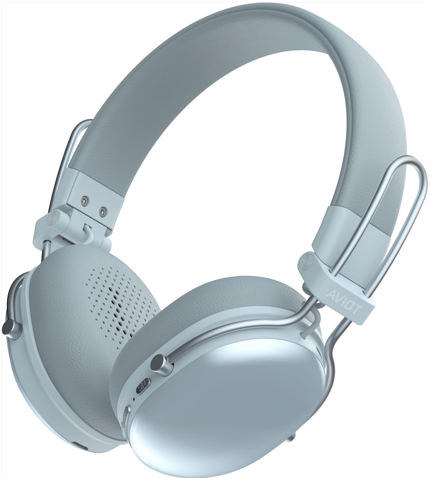
Image: AVIOT WA-Q1 Noise-Canceling Wireless Headphones, showcasing the sleek design.