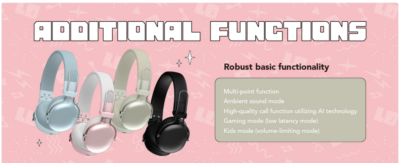
Image: Graphic highlighting additional functionalities such as multi-point connectivity, ambient sound mode, and high-quality call features powered by AI technology.