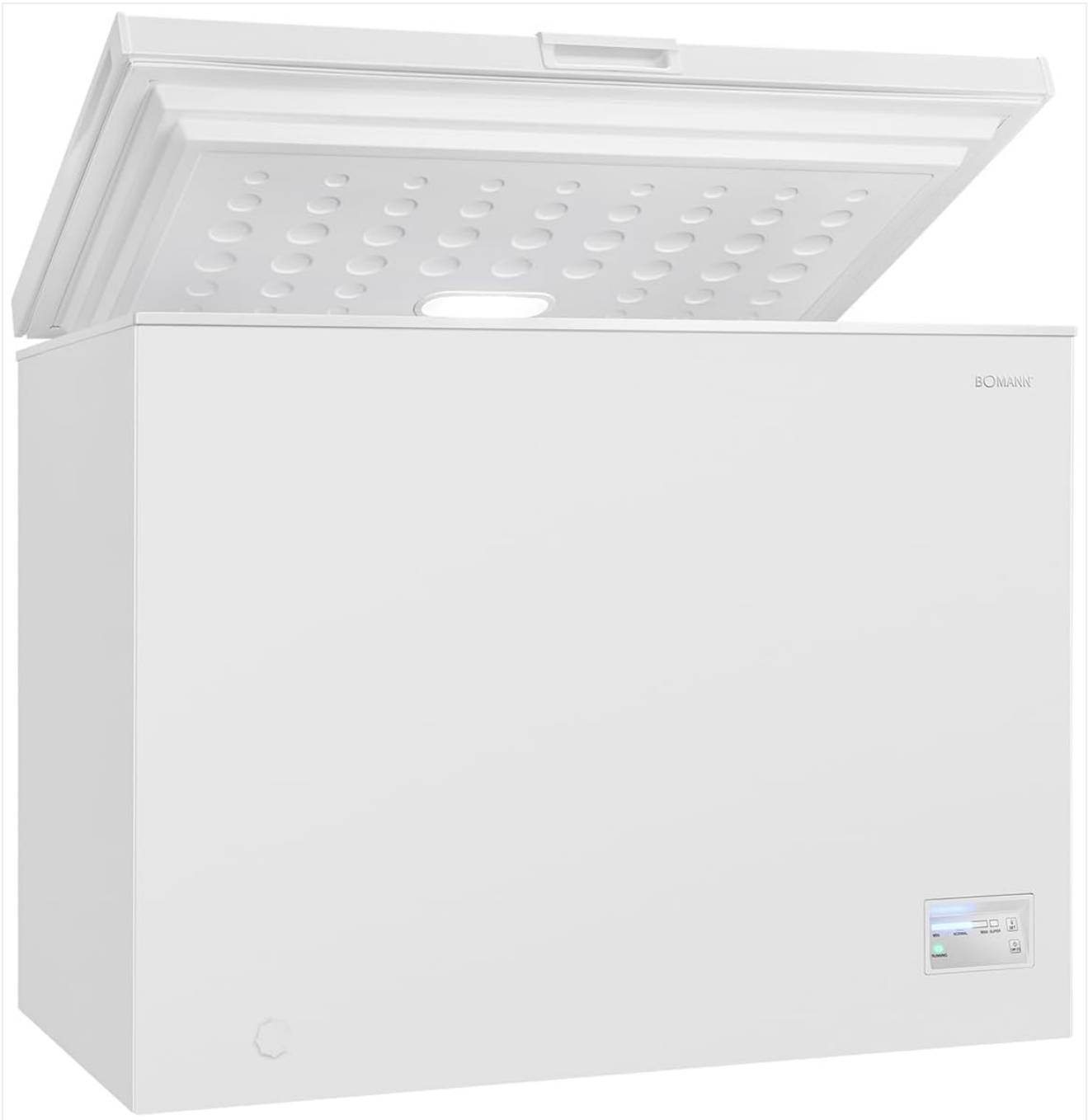
Figure 1: Front view of the Bomann GT7356 Chest Freezer with the lid partially open, revealing the interior. This image provides a general overview of the appliance.

The Bomann GT7356 is a 198-liter chest freezer designed for efficient and reliable food storage. Key features include LED lighting, electronic temperature control, and a Super Freeze function.