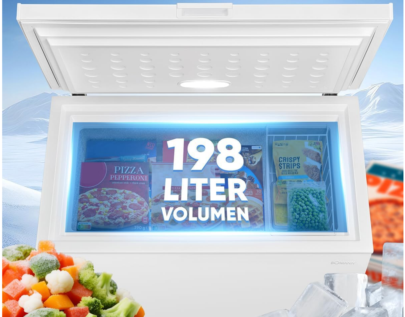
Figure 2: The spacious interior of the Bomann GT7356 chest freezer, demonstrating its 198-liter volume for storing various frozen items.

MEHR PLATZ FÜR ALLES, WAS DIR WICHTIG IST!