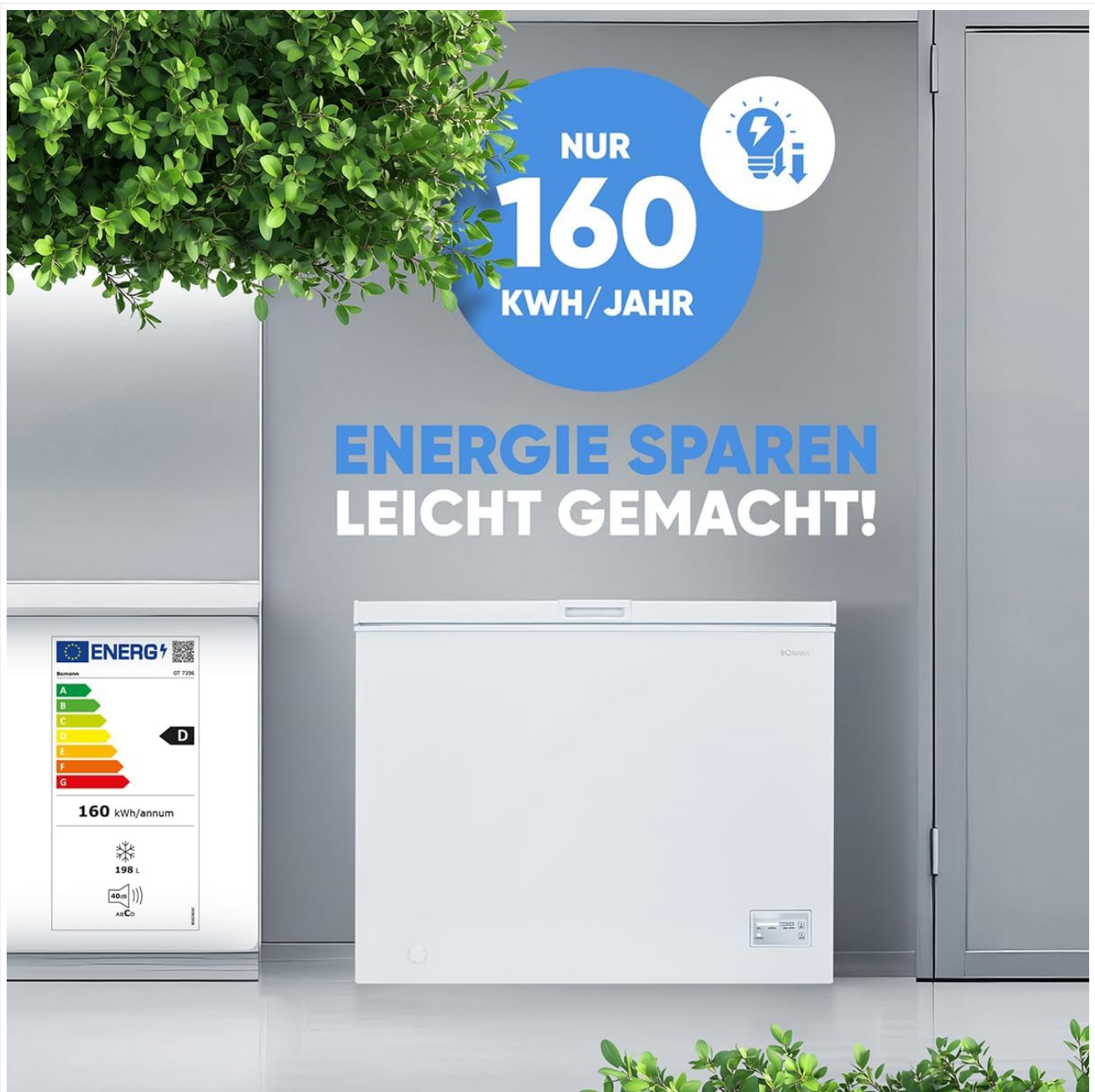
Figure 5: The Bomann GT7356 chest freezer displayed alongside its energy label, highlighting its annual energy consumption of 160 kWh.