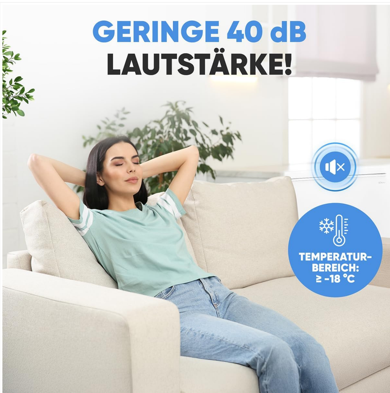
Figure 4: This image emphasizes the low noise level of the Bomann GT7356 chest freezer (40 dB), making it suitable for various home environments.