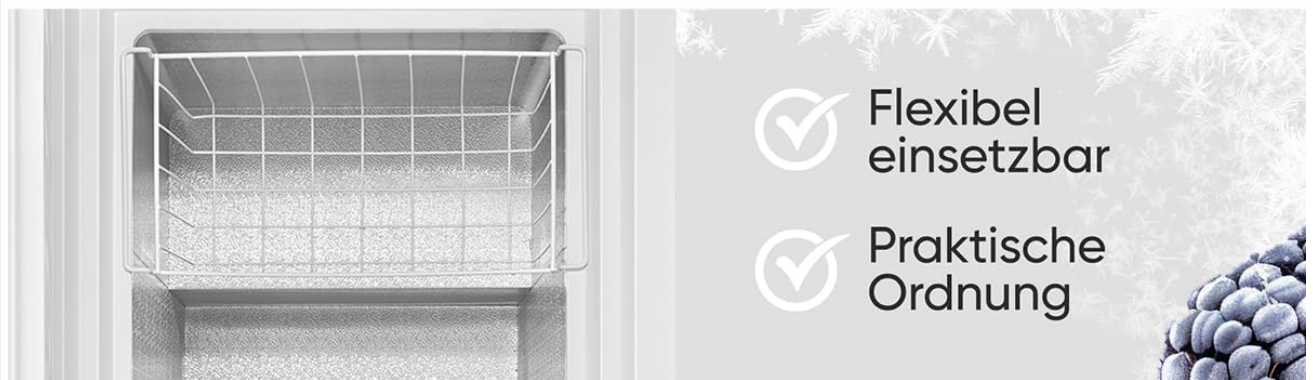
Figure 3: This image shows the practical, removable freezing basket, allowing for organized storage within the freezer.