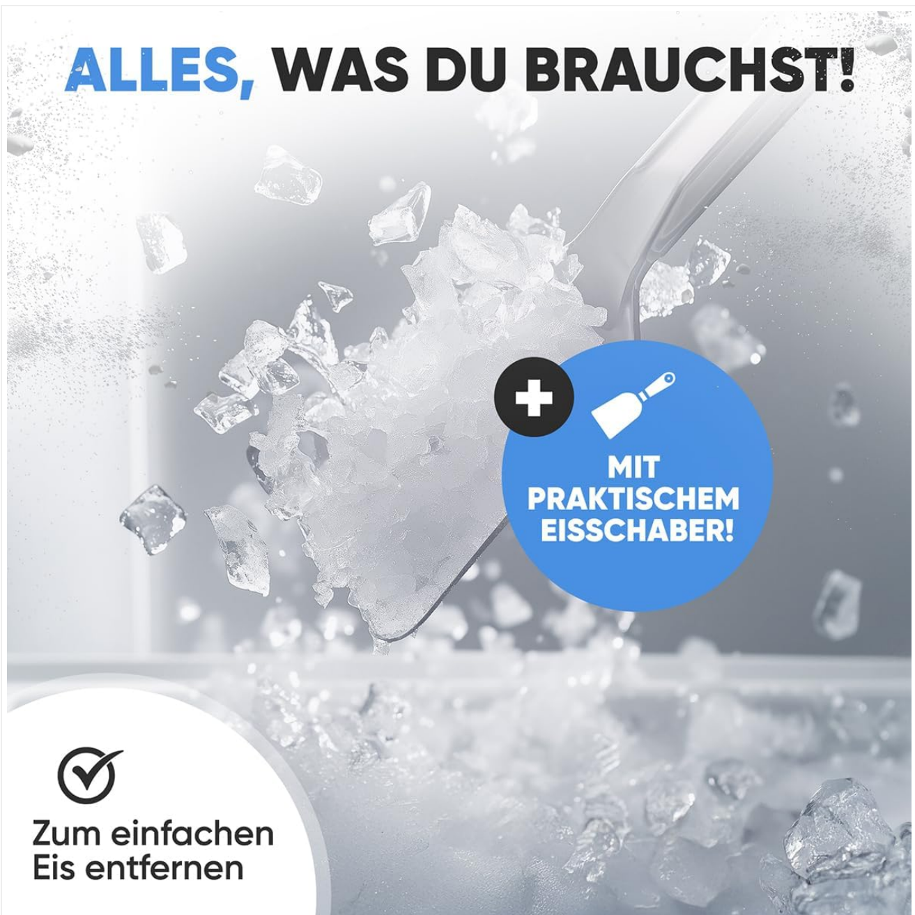
Figure 6: An image of the included ice scraper, designed for safe and easy removal of ice buildup during defrosting.