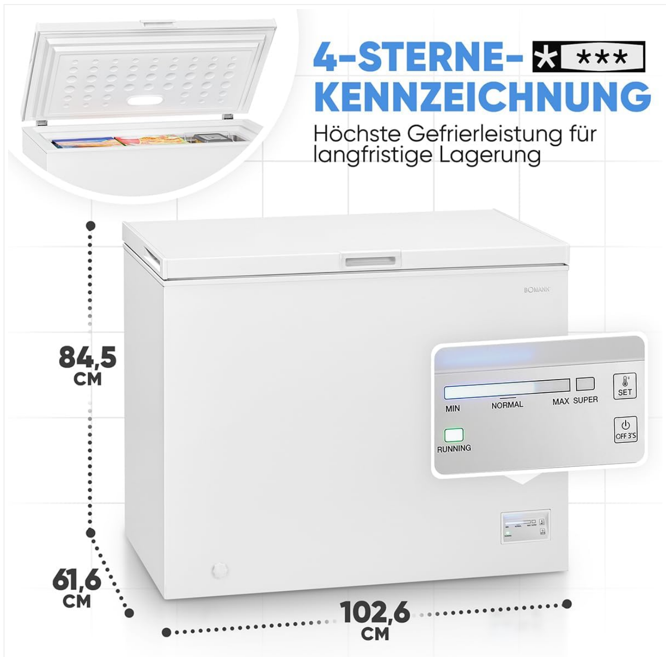
Figure 7: This image illustrates the overall dimensions of the Bomann GT7356 chest freezer and provides a close-up view of its electronic control panel.