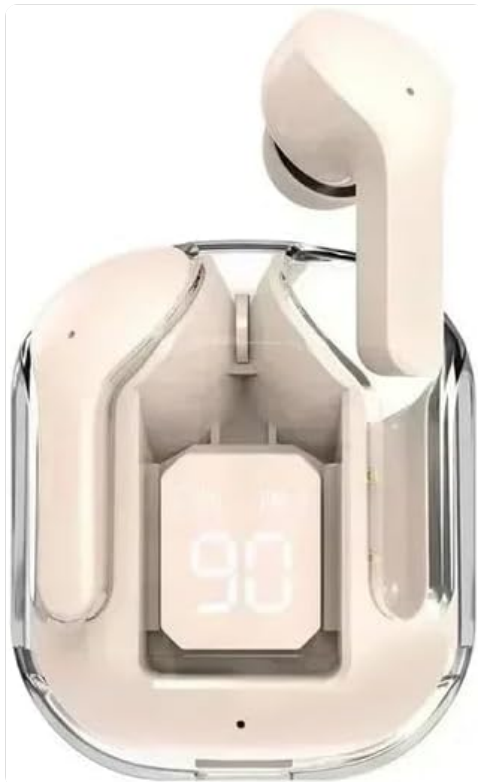
Image: The TWS T2 Wireless Earbuds, shown in their transparent charging case. The case features an LED digital display indicating a 90% charge level. One earbud is partially visible, highlighting the compact design.