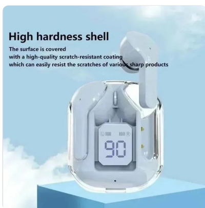
Image: A single white TWS T2 earbud is shown within its transparent charging case, with the LED display indicating a 90% charge. The image emphasizes the high hardness shell, which is covered with a high-quality scratch-resistant coating designed to resist scratches from various sharp products.