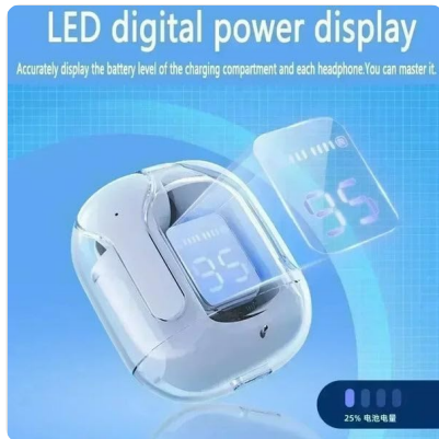
Image: A close-up of the transparent charging case with an LED digital display. The display accurately shows the battery level of both the charging compartment and individual headphones, indicating 95% for the case and 35% for the earbuds.

Before first use, fully charge the earbuds and the charging case. Connect the provided USB-C cable to the charging port on the case and to a USB power source. The LED display on the case will show the charging progress. A full charge typically takes 1-2 hours.