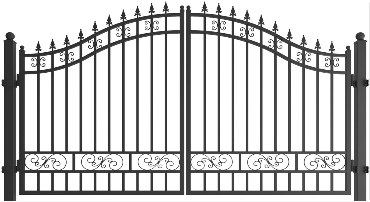
Figure 1.1: Simpol Home Dual Swing Driveway Gates (Black, 12 x 7 Feet).