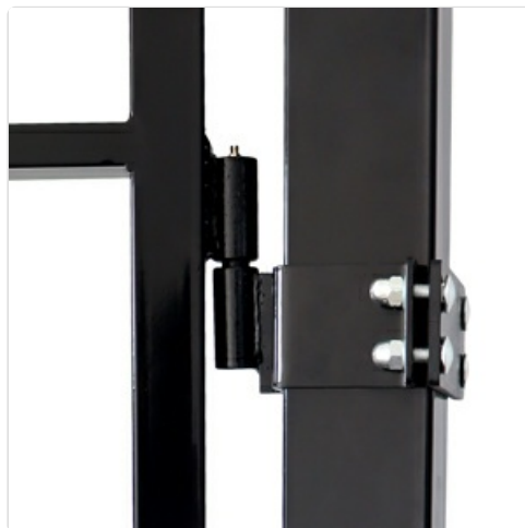
Figure 4.3: Detailed View of Gate Hinge.