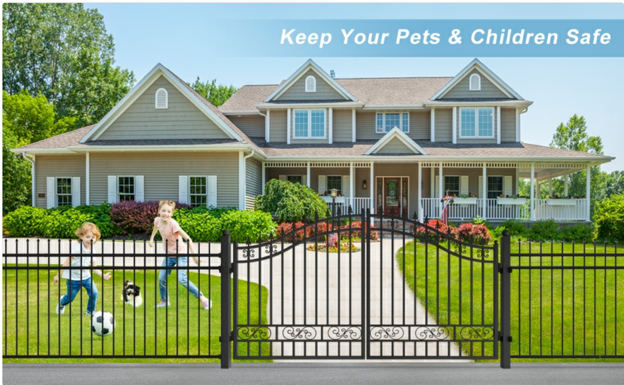
Figure 5.1: Gates Provide Security for Children and Pets.