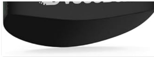
Figure 3: Key Button Areas

This image provides a detailed view of the vSeeBox V3 Plus remote, focusing on the central circular navigation pad with an "OK" button, the voice command button (represented by a microphone icon), and the volume and channel controls. It also shows the dedicated app buttons at the bottom.