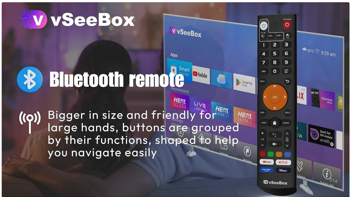
Figure 2: Bluetooth Pairing Illustration

Important: If you exit the pairing prompt on your vSeeBox without successfully pairing the remote, you may need to restart your vSeeBox device to bring up the pairing prompt again.