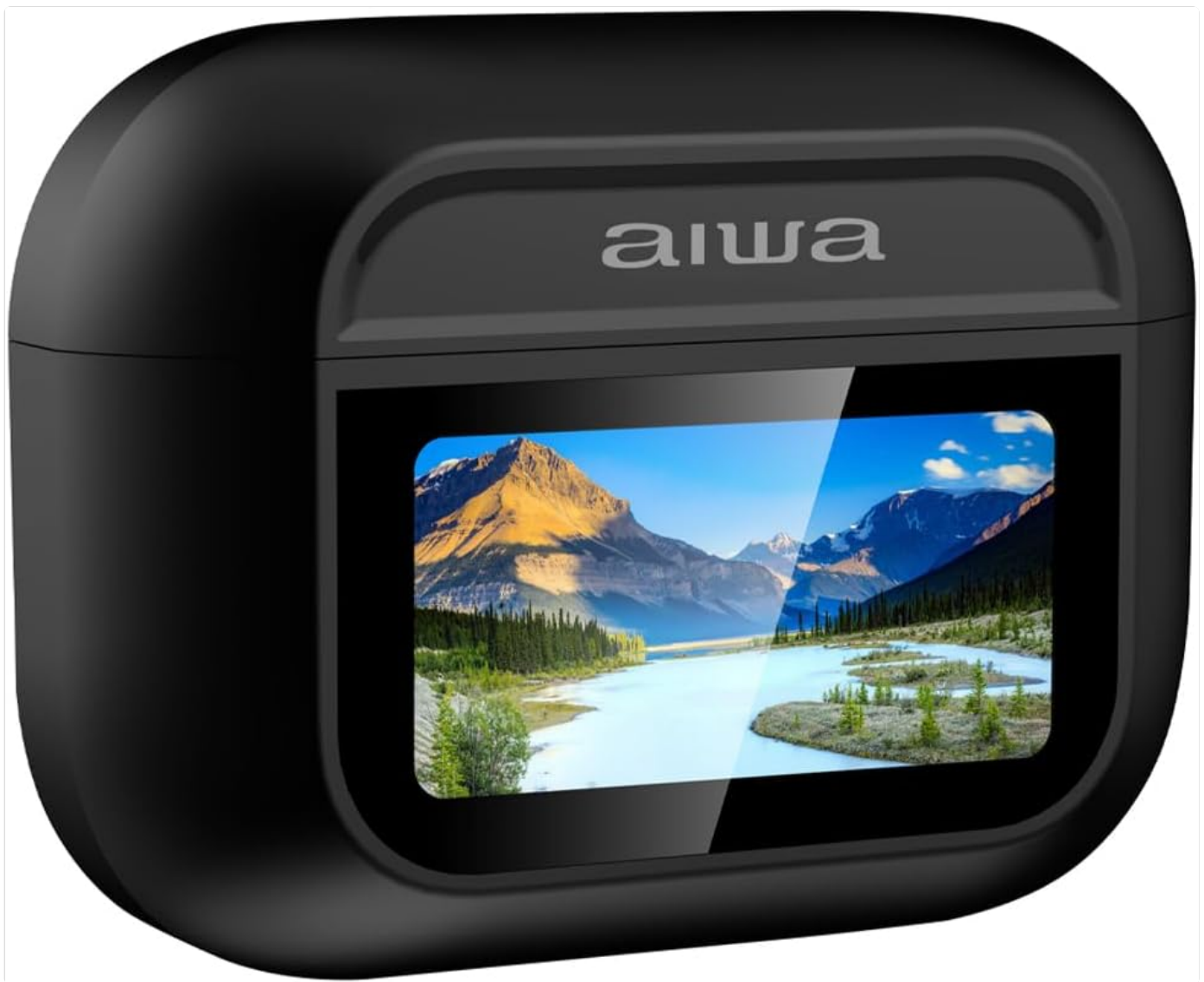
Image 5.1: The Aiwa AWTWSGPROB charging case with its touch screen displaying a vibrant scenic image of mountains and a lake, demonstrating the screen's visual capabilities beyond just controls.