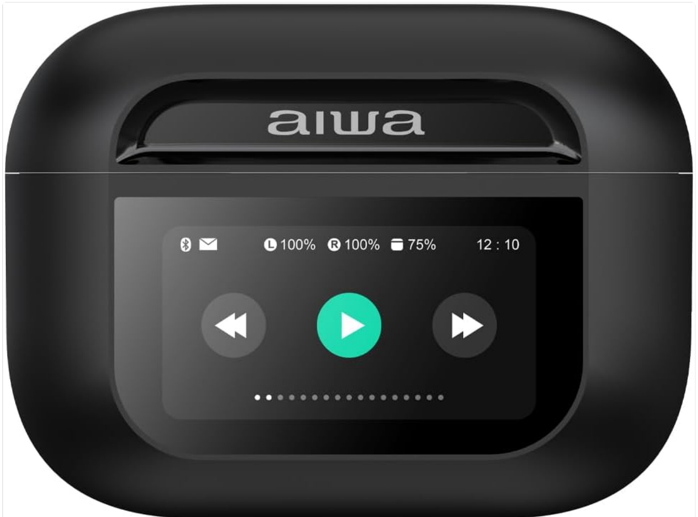
Image 3.2: A detailed view of the Aiwa AWTWSGPROB charging case's touch screen. The screen displays Bluetooth connection status, battery levels for both left and right earbuds (L 100%, R 100%), the case battery level (75%), current time (12:10), and music playback controls (previous, play/pause, next).