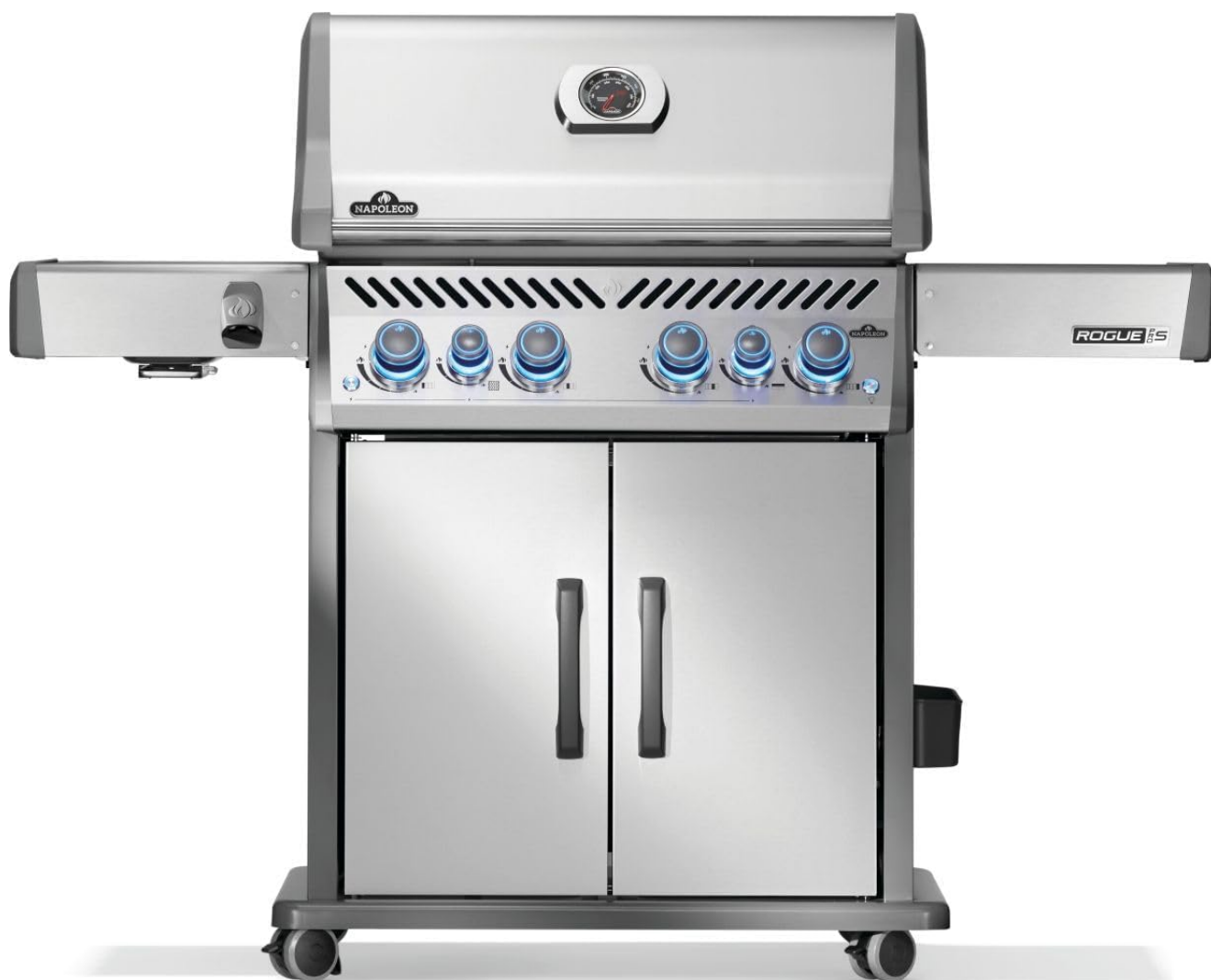
Image: The Napoleon Rogue PRO-S 525 Propane Gas Grill in stainless steel, with its lid closed and side shelves extended, showcasing its sleek design and compact footprint.

Your grill includes the main grill unit, side shelves, cooking grids, burners, control knobs, and a user manual.