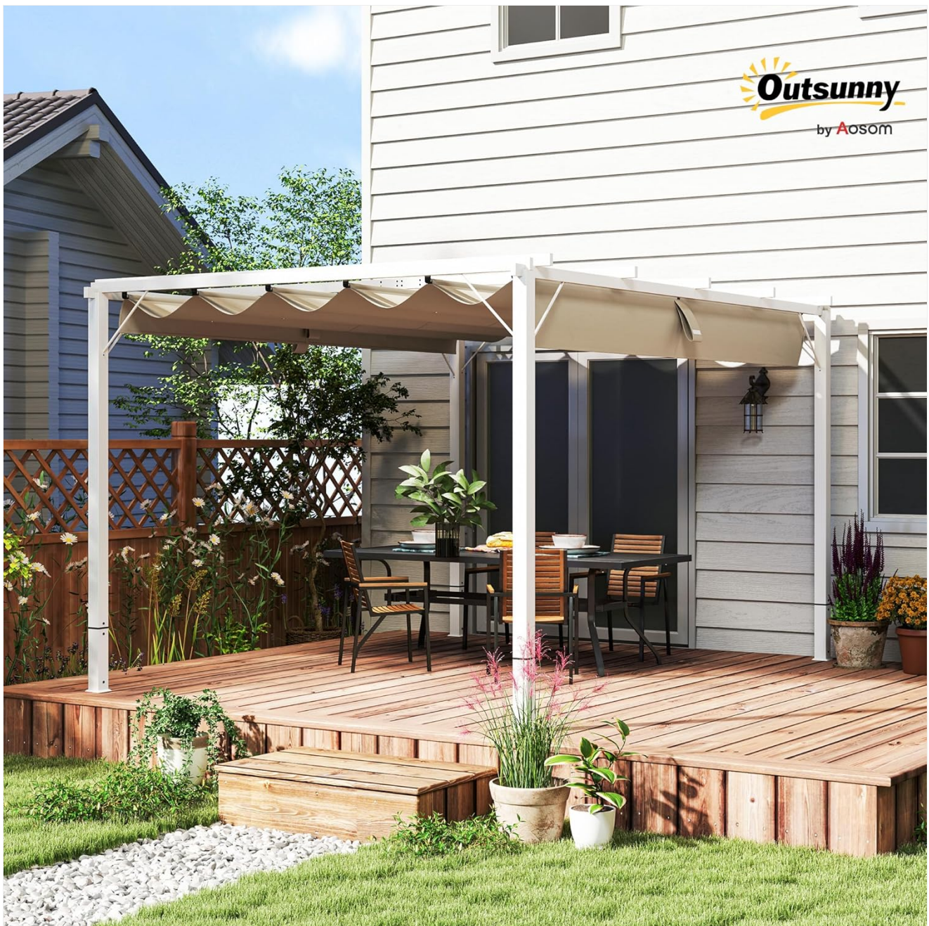
Image 1.1: The Outsunny 3x4m Retractable Aluminium Garden Pergola providing shade over an outdoor dining area.