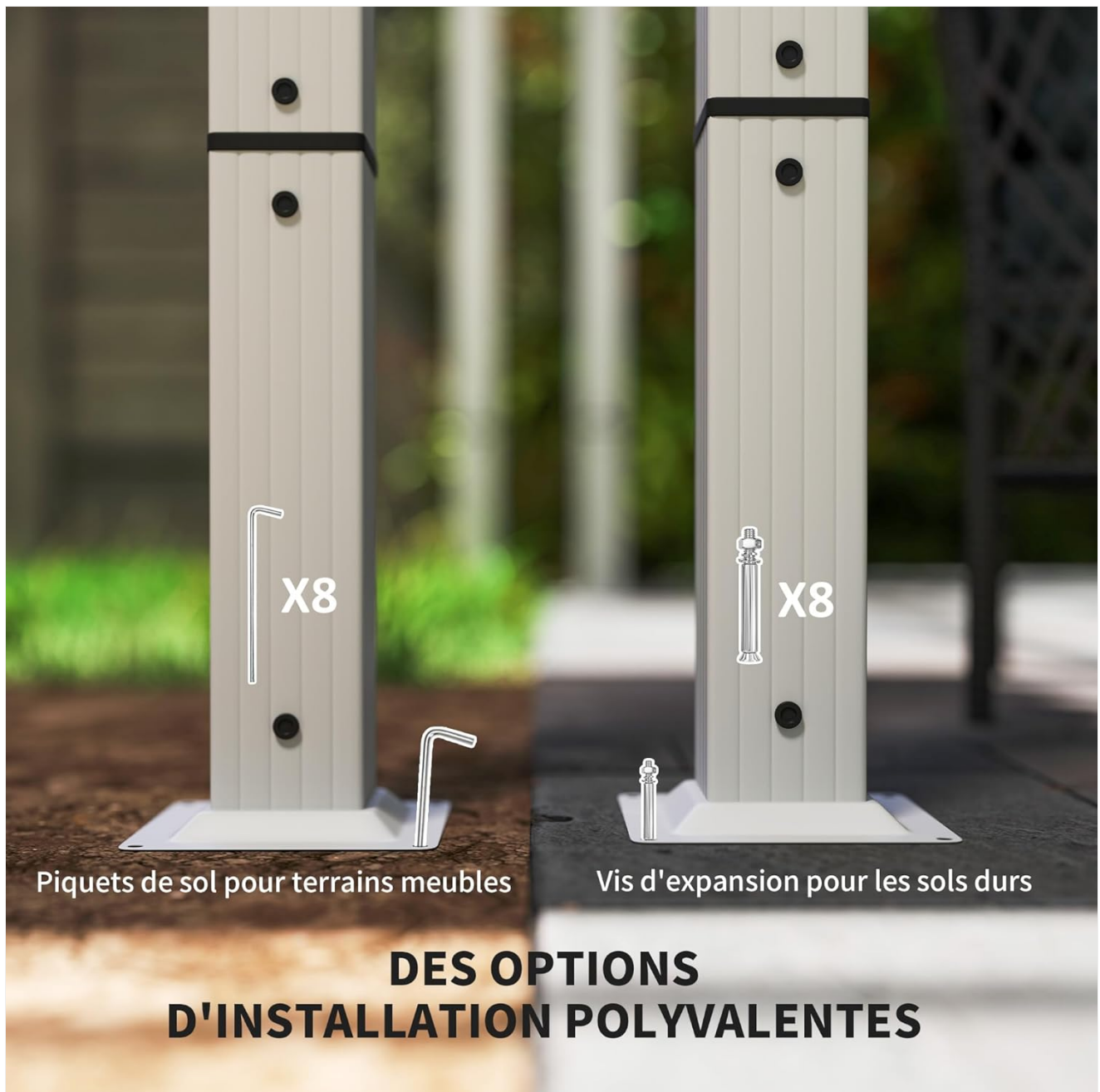
Image 4.2: Installation options for securing the pergola to different ground types.