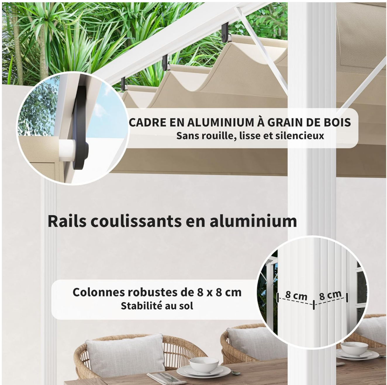
Image 4.1: Close-up of the aluminum frame, highlighting the sliding rails and column dimensions.