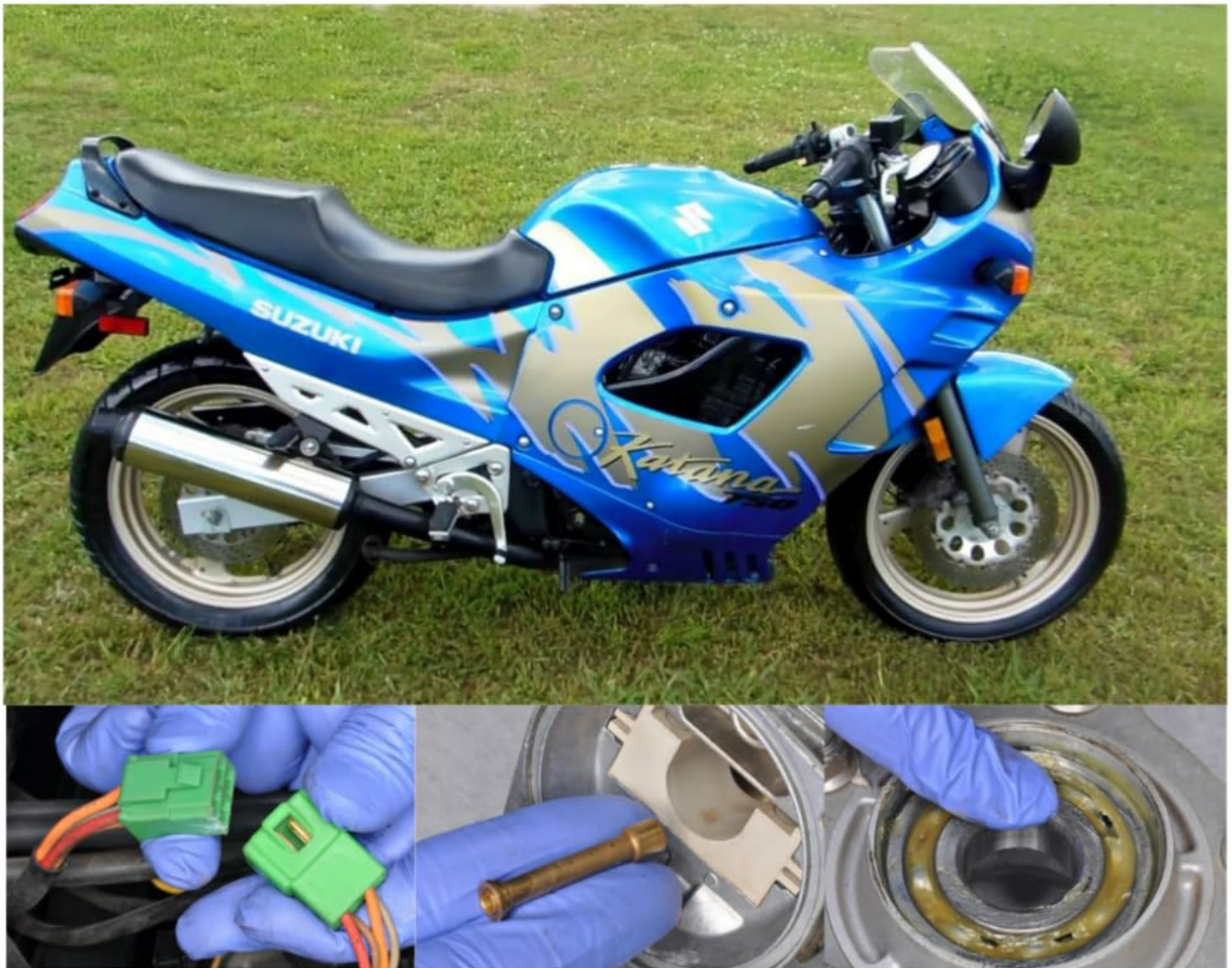
Figure 1: Front cover of the Cyclepedia Service Manual for Suzuki GSX600F and GSX750F Katana motorcycles (1988-1997). This image displays the title and branding of the manual.