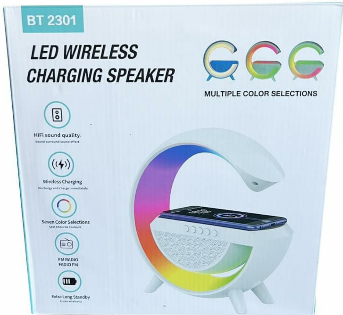
Figure 2: The product packaging for the BT2301 speaker, highlighting key features such as HiFi sound quality, wireless charging, multiple color selections, FM radio, and extra long standby.

lighting, and wireless charging pad with a smartphone placed on it.