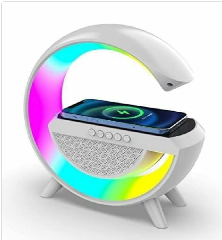
Figure 1: The LED Wireless Charging Bluetooth Speaker (Model BT2301) showcasing its G-shaped design, integrated LED mood