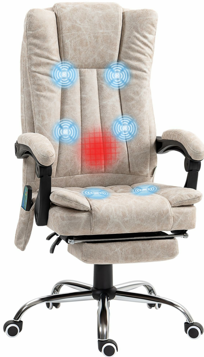
Image 1.1: The Vinsetto Massage and Heated Office Chair in an office environment.