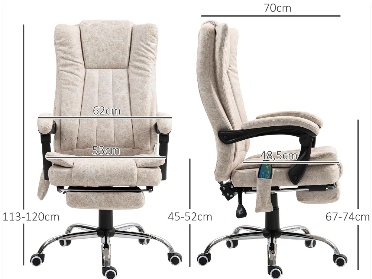
Image 8.1: Key dimensions of the Vinsetto Massage and Heated Office Chair.