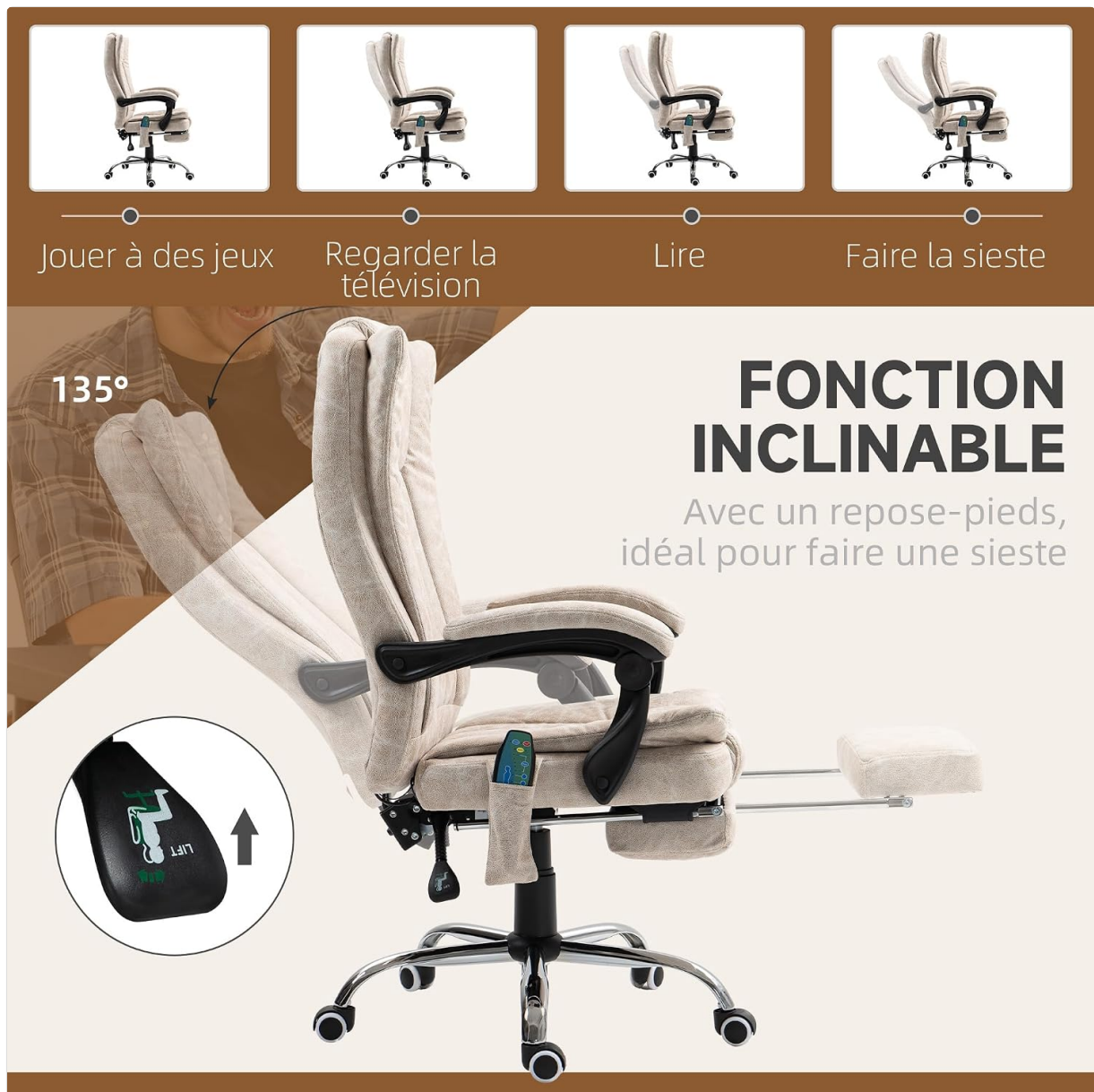
Image 5.2: The chair's reclining function, ideal for various activities including napping.