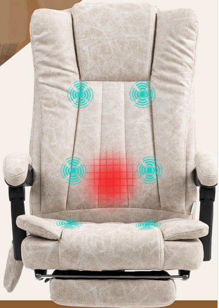
Image 5.3: Illustration of the 6-point vibration massage system and the remote control storage pocket.

Poche de côté: Pour ranger le contrôleur