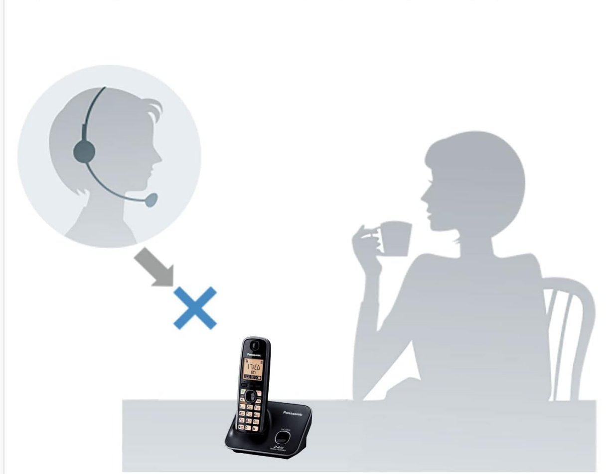
Figure 3.1: Incoming Call Barring. This diagram shows how the Incoming Call Barring feature works, preventing unwanted calls. A headset icon represents a caller, an 'X' symbol indicates a blocked call, and a person relaxing signifies undisturbed peace. This feature requires a Caller ID service subscription.

* Requires subscription to Caller ID service offered by your provider/telephone company