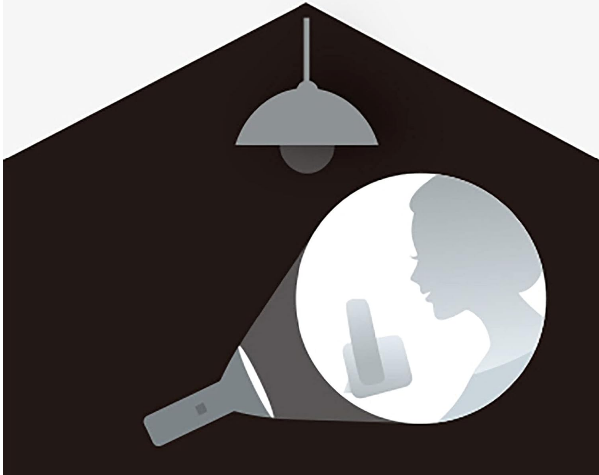
Figure 4.1: Power Back-Up Operation. An illustration depicting the Power Back-Up Operation. In the event of a power failure, placing the handset on the base unit allows the user to temporarily use the speakerphone function, indicated by a flashlight illuminating the phone.

By placing the handset on the base unit, you can use the speaker phone temporarily even during a power failure.