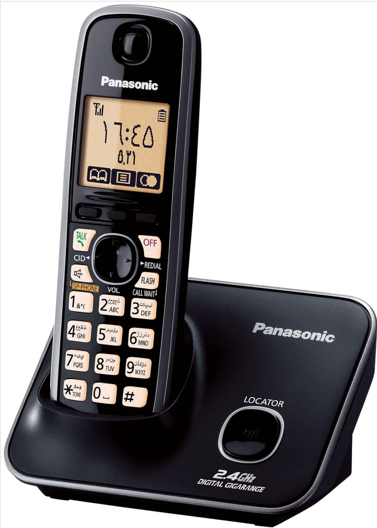
Figure 1.1: Panasonic KX-TG3711BX Cordless Phone System. This image displays the Panasonic KX-TG3711BX cordless phone, featuring a black handset with an amber backlit LCD screen, placed securely on its matching black base unit. The base unit includes a 'LOCATOR' button.