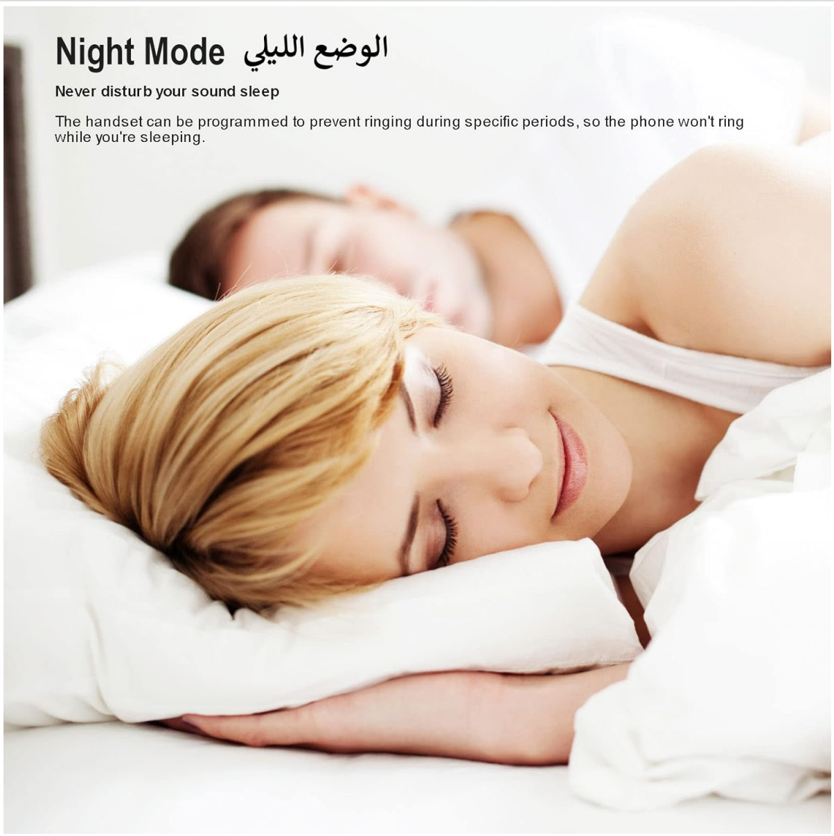
Figure 3.2: Night Mode in Operation. This image illustrates the Night Mode feature, which allows the handset to be programmed to prevent ringing during specific periods, ensuring undisturbed sleep.

The handset can be programmed to prevent ringing during specific periods, so the phone won't ring while you're sleeping.