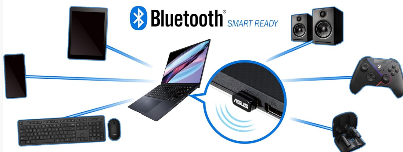
Image 3: The adapter enables multi-device connectivity, supporting up to seven Bluetooth devices simultaneously.