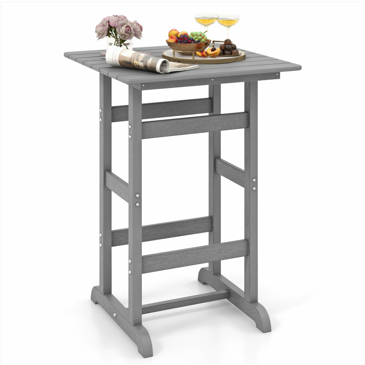
Image 1.1: The Giantex 42" Height Outdoor Tall Bar Table in a patio setting.