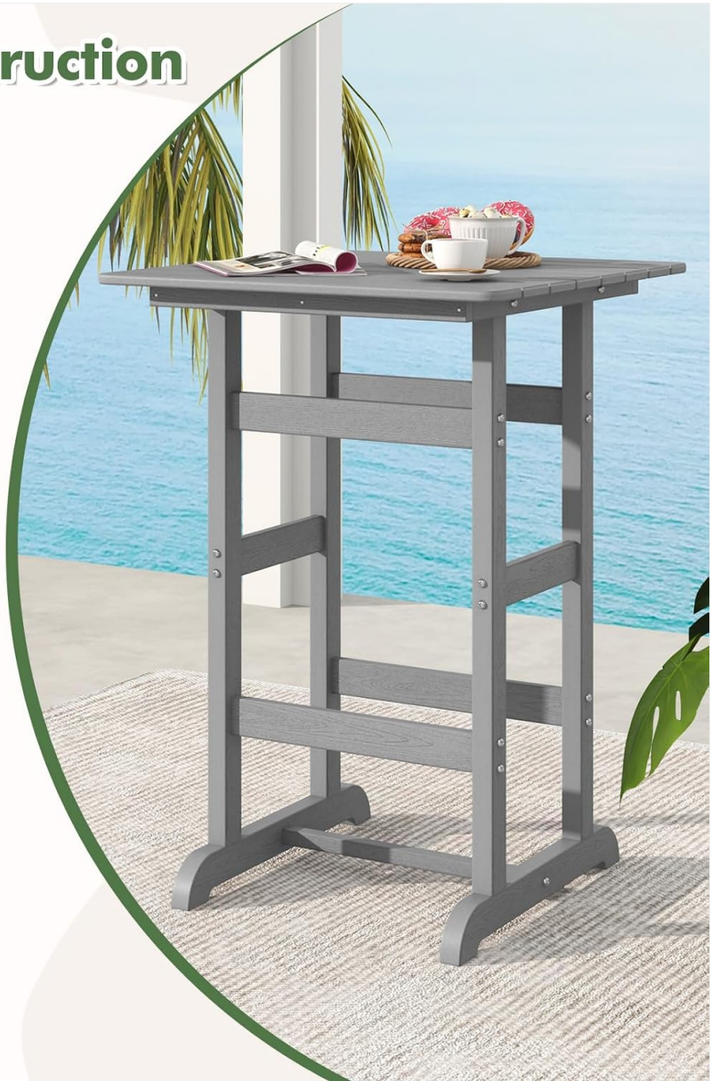
Image 4.1: Thoughtful design features including footrests and side bars.

Balanced H-shaped Legs Provide added stability