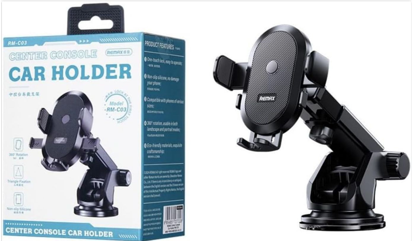
Figure 1: Remax RM-C03 Car Phone Holder and its retail packaging.

The Remax RM-C03 Car Phone Holder is designed to provide a secure and convenient mounting solution for your smartphone in your vehicle. Its adjustable design ensures compatibility with a wide range of mobile devices, offering hands-free access for navigation, calls, and music.