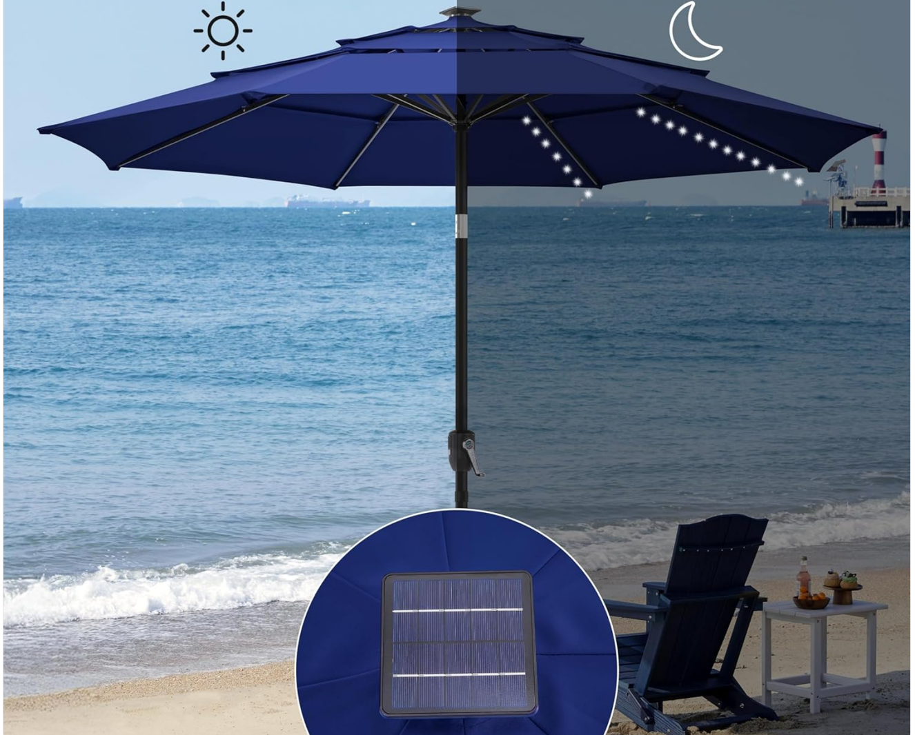
Image: A split image illustrating the umbrella's function during the day for shade and at night with solar-powered LED lights, with a close-up of the solar panel.

Video: A demonstration of the 3-Tier Vented Outdoor Parasol with Color-Changing LED Strip, highlighting its lighting features.