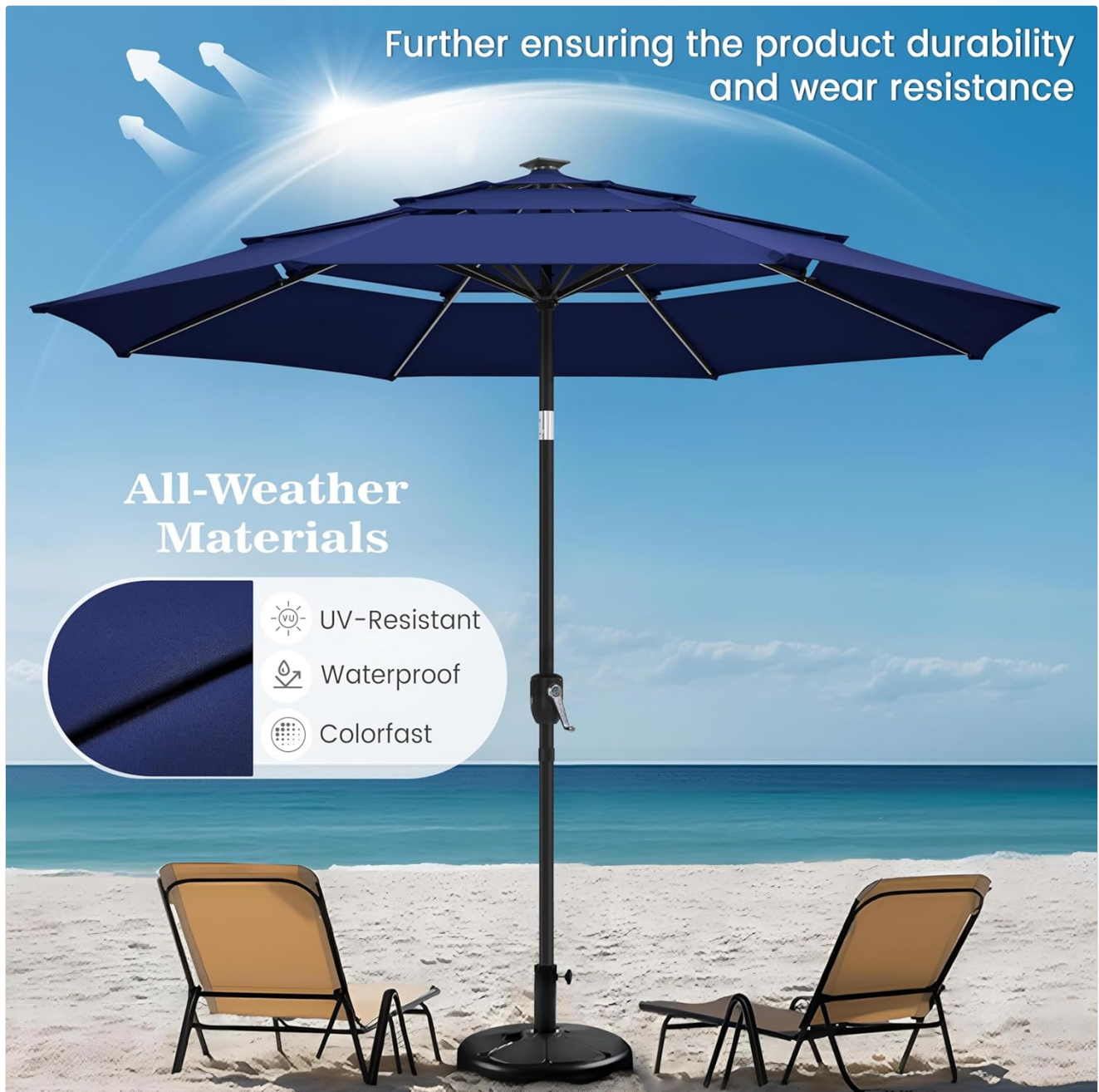
Image: Close-up of the umbrella fabric, highlighting its all-weather properties: UV-resistant, waterproof, and colorfast.