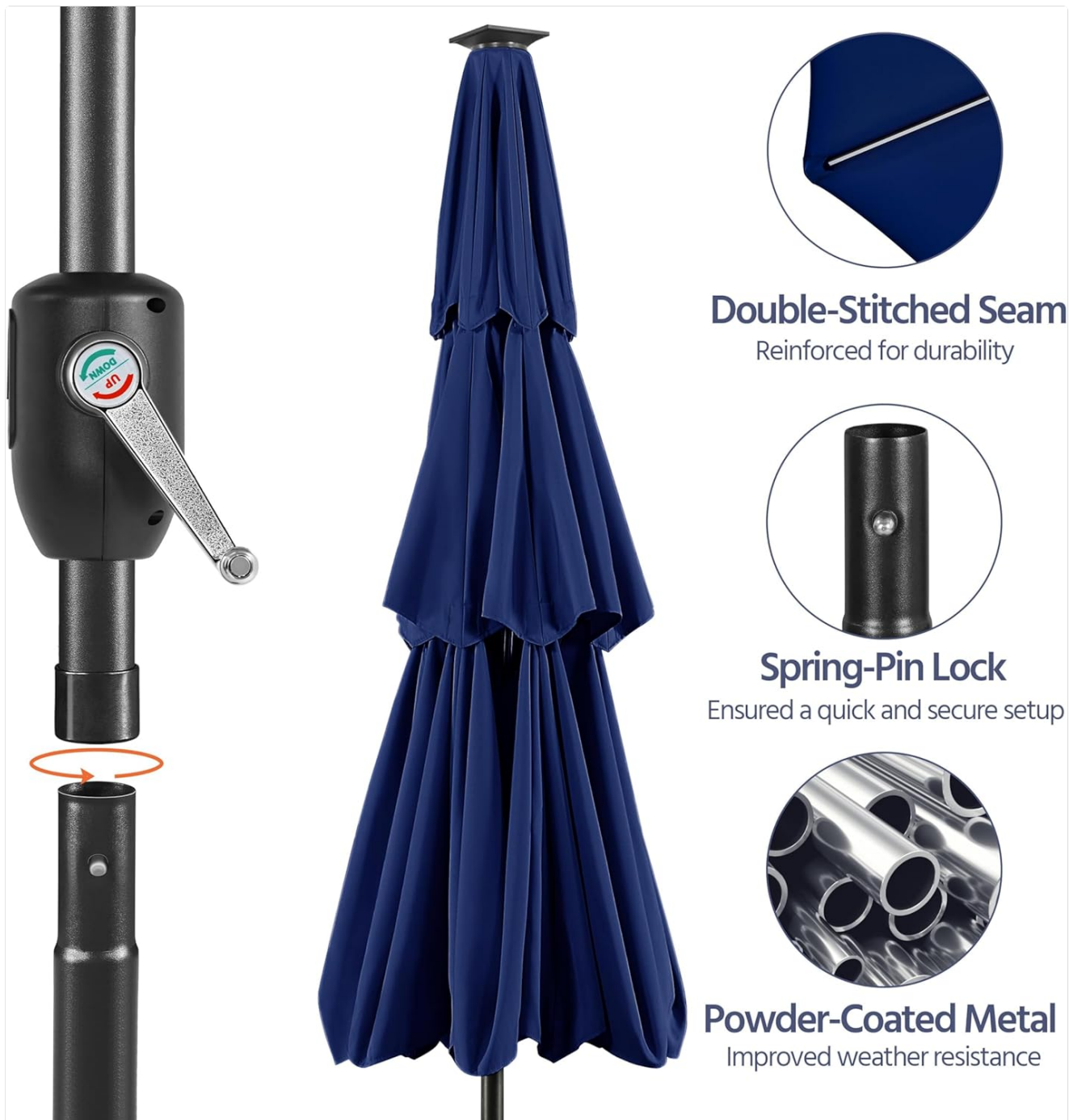
Image: Detailed view of the umbrella pole, highlighting the double-stitched seam for durability, the spring-pin lock for secure assembly, and the powder-coated metal finish for weather resistance.

Video: A demonstration of the 10ft 8-Ribs Patio Umbrella, showing its overall structure and features.