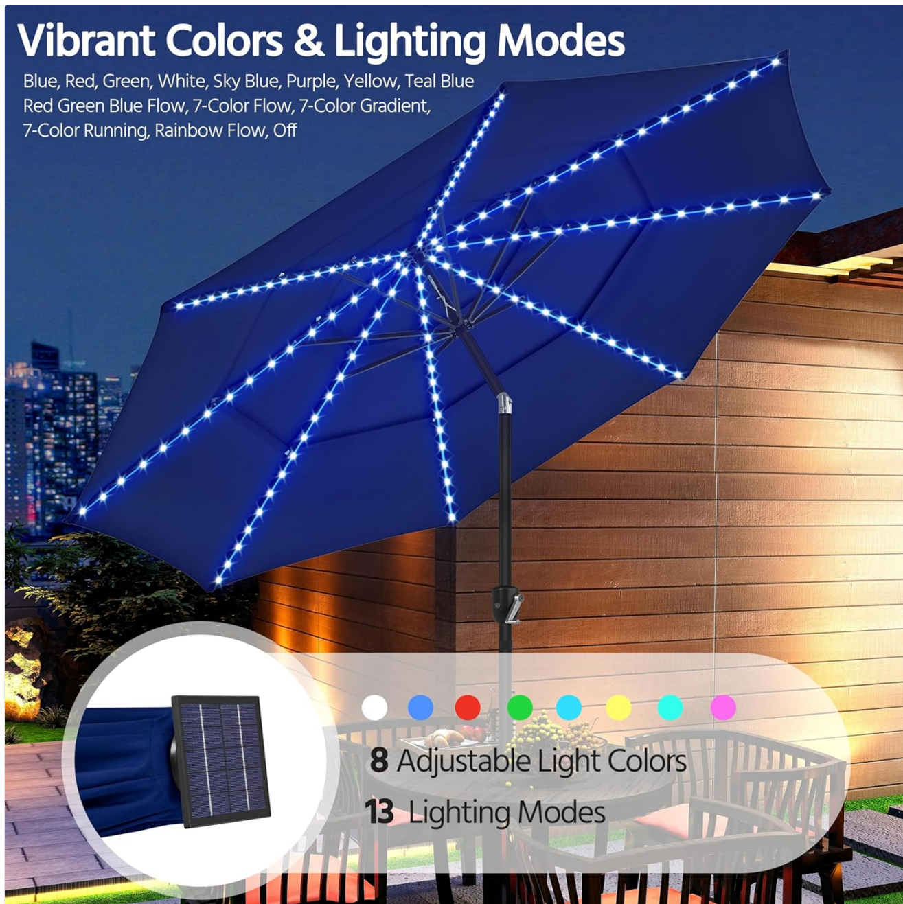
Image: The underside of the umbrella canopy illuminated by vibrant color-changing LED lights, showcasing various lighting modes.

Blue, Red, Green, White, Sky Blue, Purple, Yellow, Teal Blue Red Green Blue Flow, 7-Color Flow, 7-Color Gradient, 7-Color Running, Rainbow Flow, Off