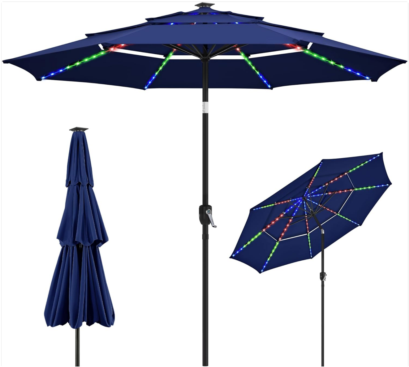
Image: The Yaheetech 10ft 3-Tier Solar Patio Umbrella, showcasing its multi-tiered canopy and integrated LED lights.