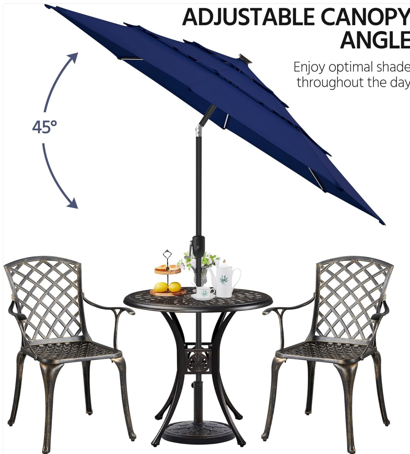
Image: The umbrella demonstrating its adjustable canopy angle, allowing users to optimize shade as the sun moves.

Release the button to lock the tilt in place.