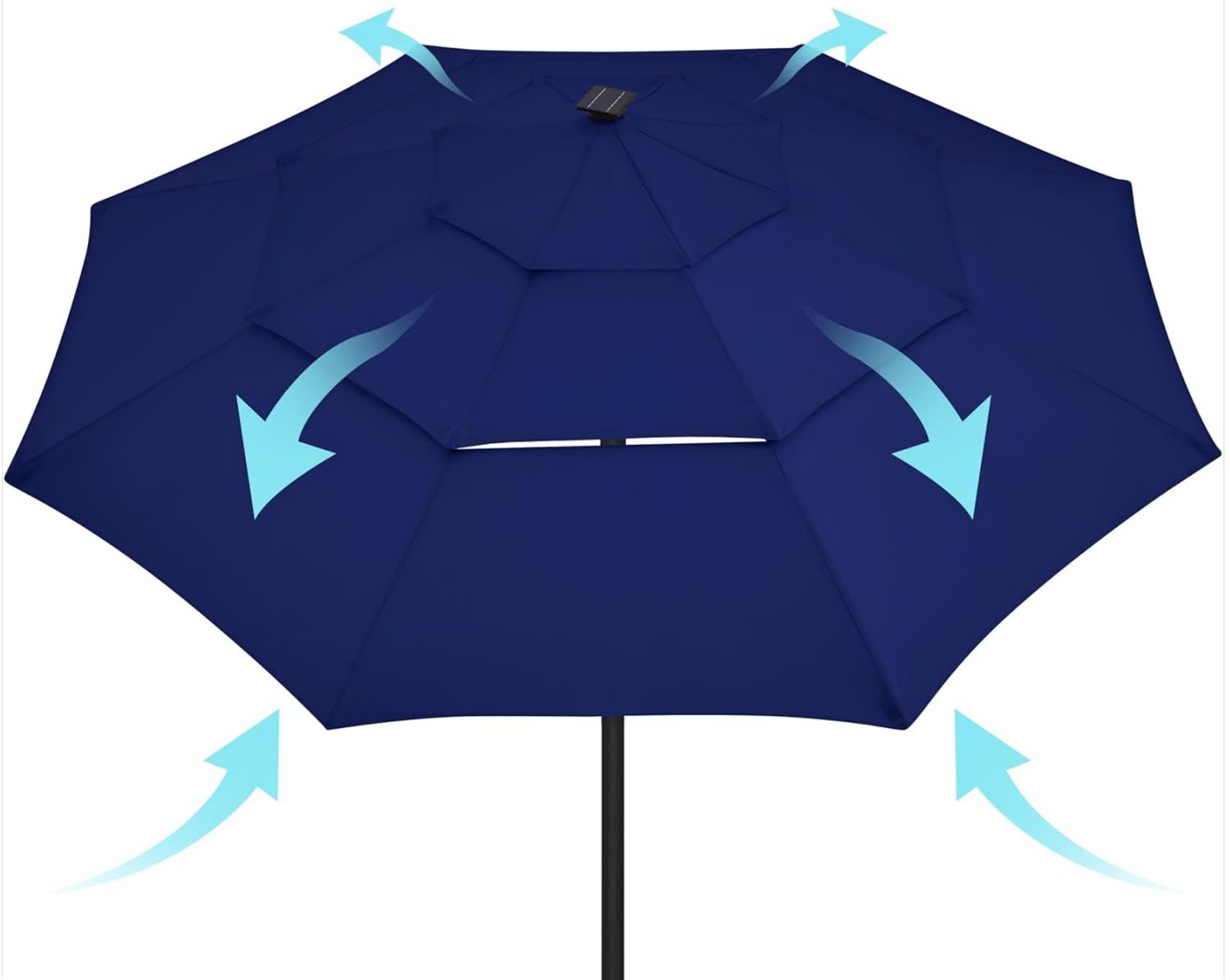
Image: A close-up view of the 3-tier vented top of the umbrella, with arrows indicating improved air circulation, heat dissipation, and wind resistance.

Better Breathability, Heat Dissipation, and Wind Resistance.