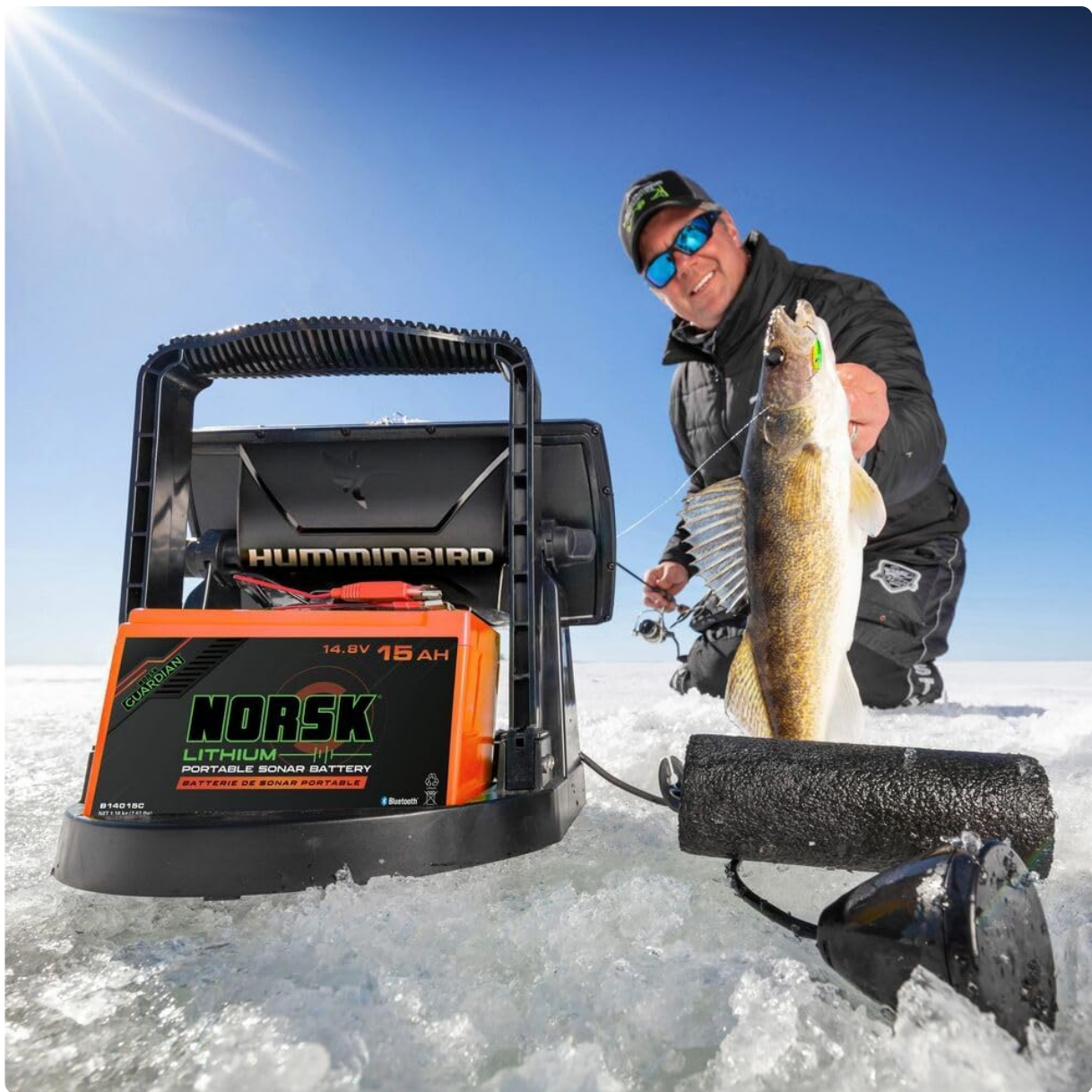
Image: A Norsk Lithium battery connected to and powering a Humminbird sonar system, demonstrating its use in an ice fishing scenario.