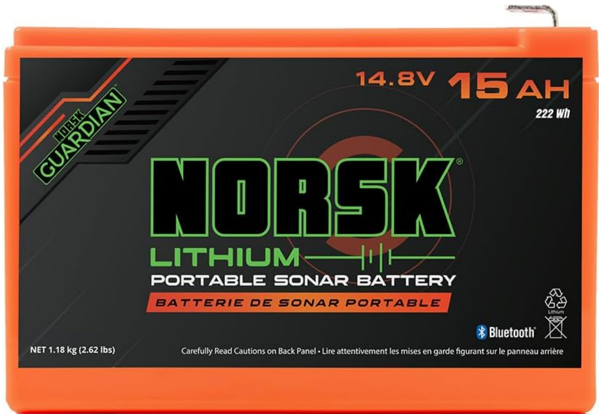
Image: Front view of the Norsk Lithium 14.8V 15AH Lithium Ion Battery, showing the Norsk Lithium branding and key specifications like 14.8V and 15AH.