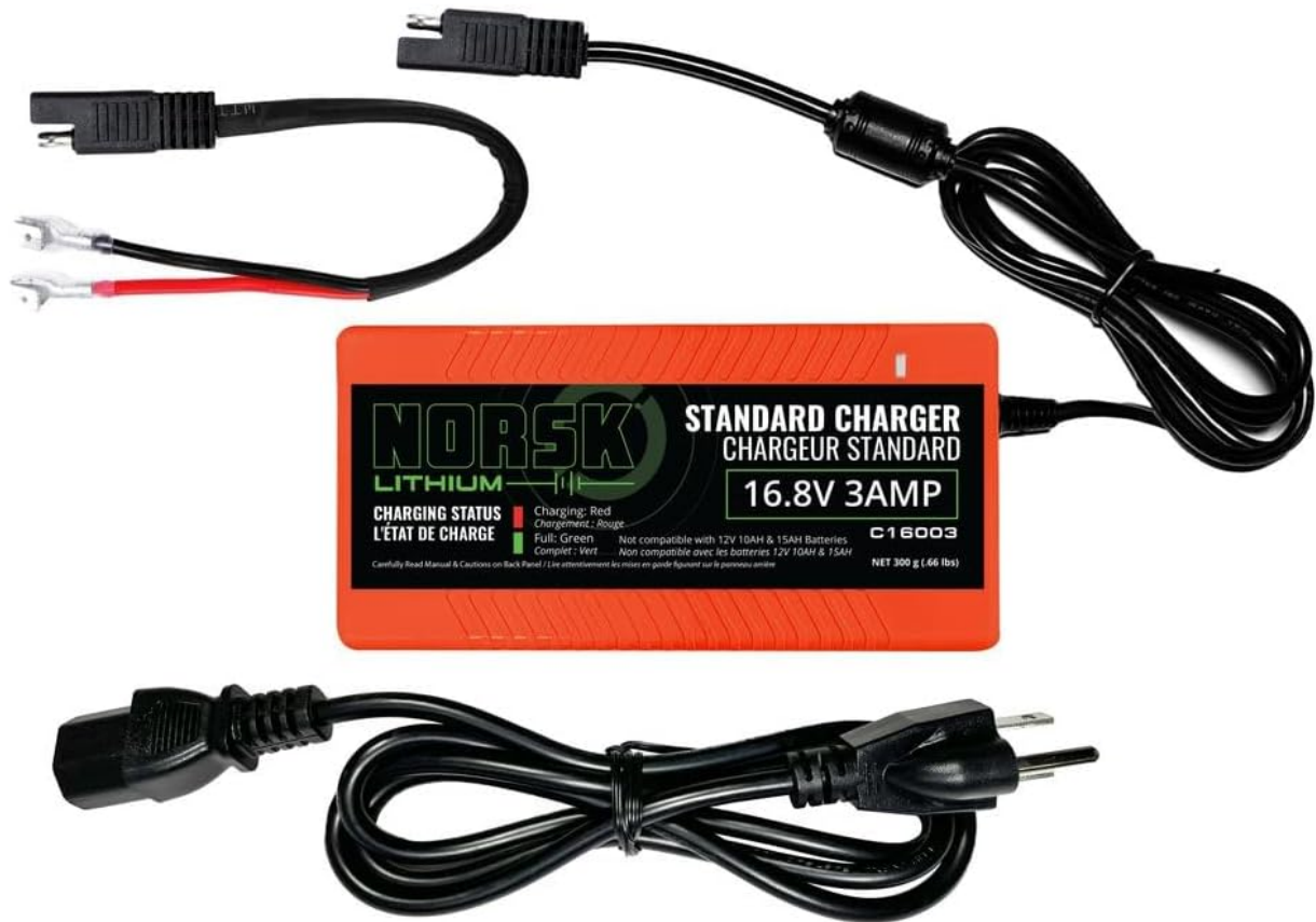
Image: The Norsk Lithium 3A 16.8V Standard Charger and accompanying power cables included with the battery.