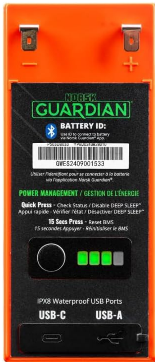
Image: Rear view of the Norsk Lithium battery, highlighting the Norsk Guardian branding, battery ID, power management buttons (Quick Press for status/Deep Sleep, 15 Secs Press for BMS reset), state-of-charge indicator, and the IPX8 waterproof USB-C and USB-A ports.